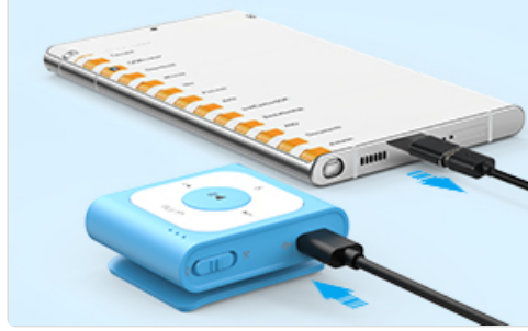
Image: Visual representation of the AGPTEK A53PL MP3 Player, earphones, USB-C cable, and user manual included in the package.