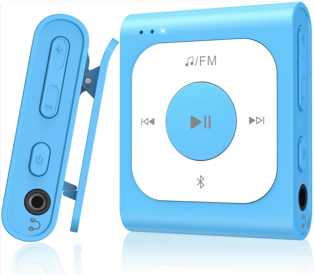
Image: The AGPTEK A53PL MP3 Player, showcasing its compact design and clip mechanism.