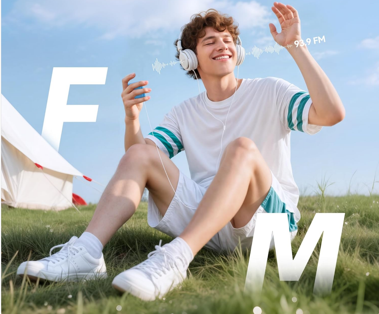
Image: A person relaxing outdoors with headphones, listening to FM radio on the AGPTEK A53PL MP3 Player, with a visual representation of radio waves and frequency.