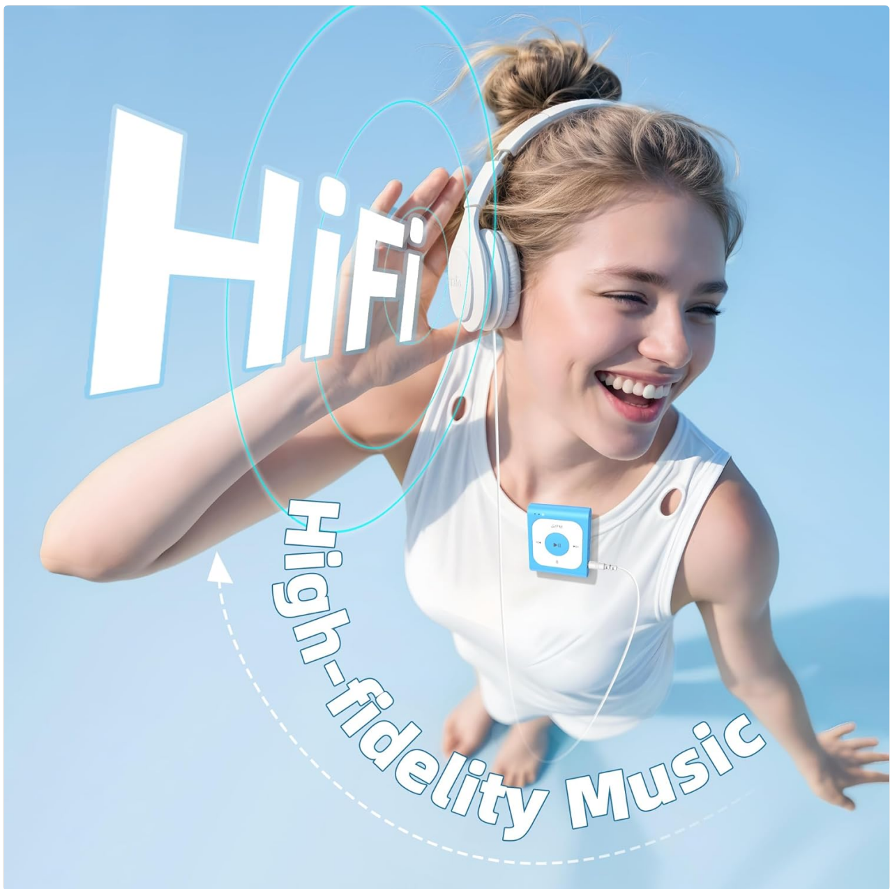
Image: A person wearing headphones and smiling, indicating enjoyment of high-fidelity music playback from the AGPTEK A53PL MP3 Player.