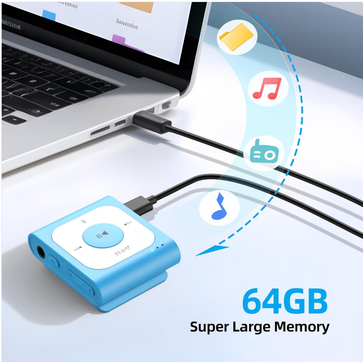
Image: The AGPTEK A53PL MP3 Player connected to a laptop via USB-C cable, illustrating the process of transferring music files to its 64GB internal memory.