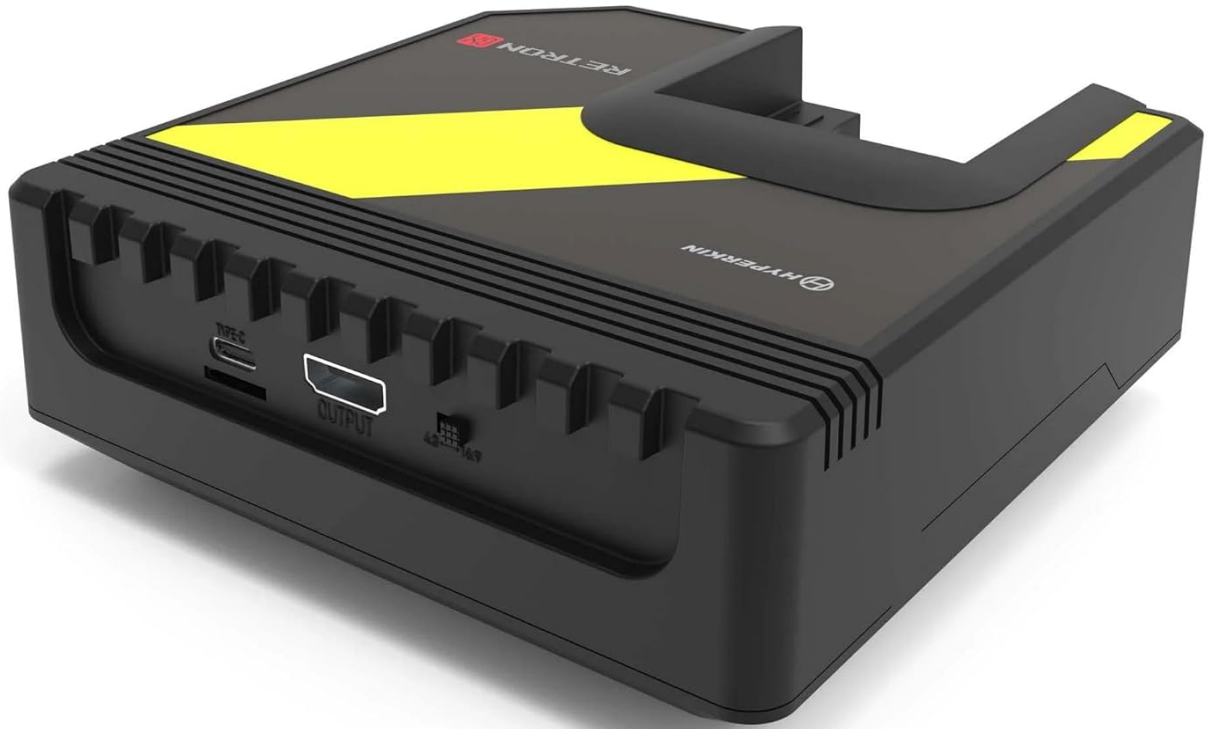
Image 3.2: Rear view of the RetroN GX console, displaying the USB-C power input, HDMI output, and system switches.