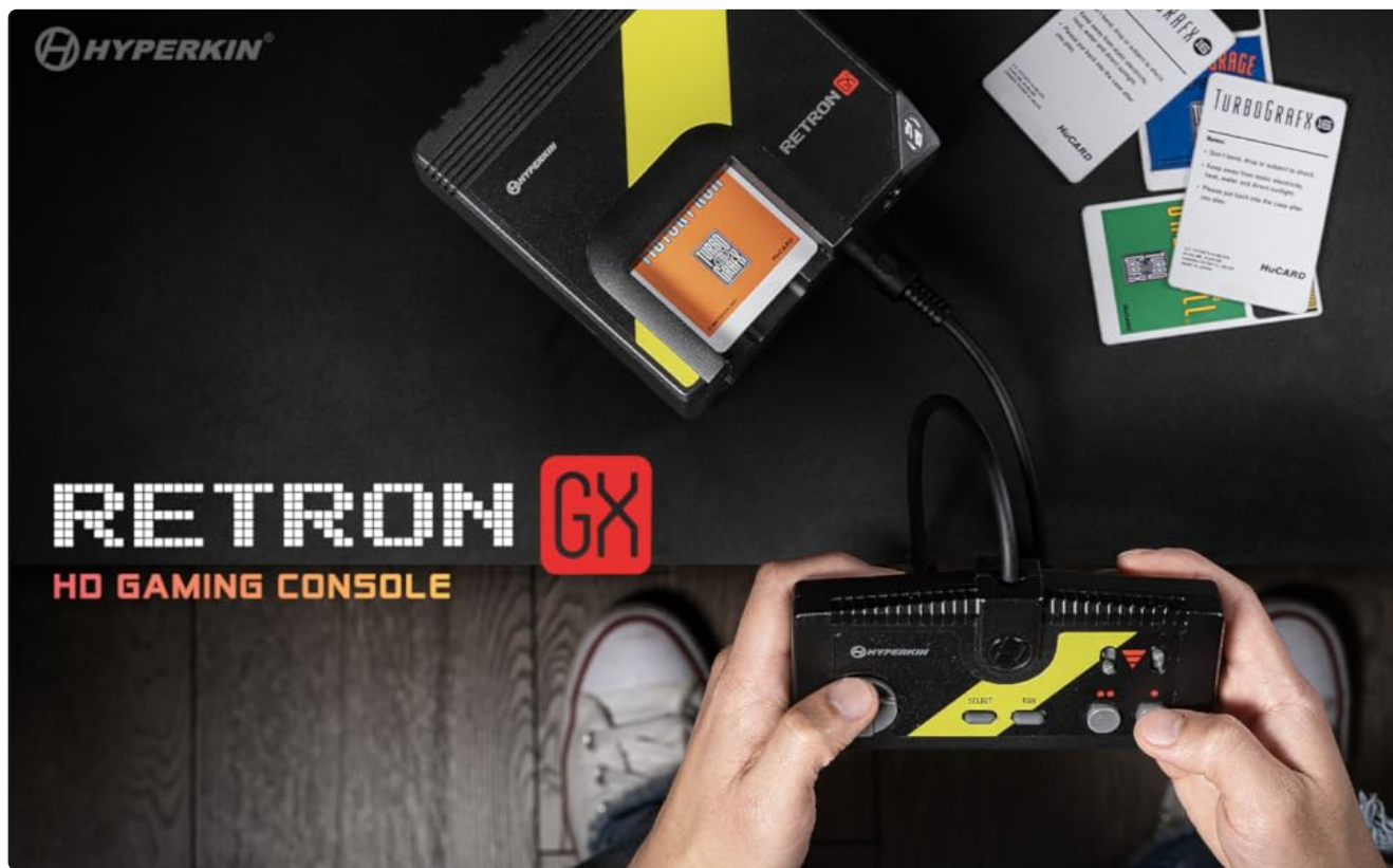
Image 1.1: The Hyperkin RetroN GX console with its wired controller and game cartridges.

The Hyperkin RetroN GX is a high-definition gaming console designed to play original TurboGrafx-16 HuCard/Turbo chip and PC Engine cartridges. It offers a modern gaming experience with classic titles, featuring 720p HD output, multiple aspect ratio options, and various video enhancements. This manual provides essential information for the proper setup, operation, and maintenance of your RetroN GX console.