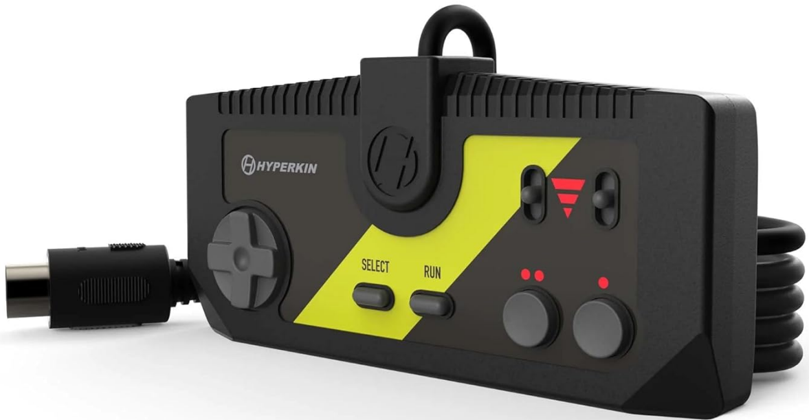
Image 3.3: Close-up of the RetroN GX wired controller, showing its buttons and D-pad.

The included wired controller features a D-pad, action buttons, SELECT, RUN buttons, and auto-fire switches for an authentic retro gaming experience.