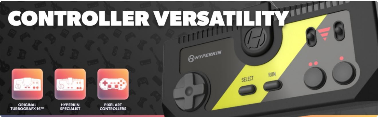
Image 8.1: The RetroN GX supports various controllers, including original TurboGrafx-16, Hyperkin Specialist, and Pixel Art controllers.