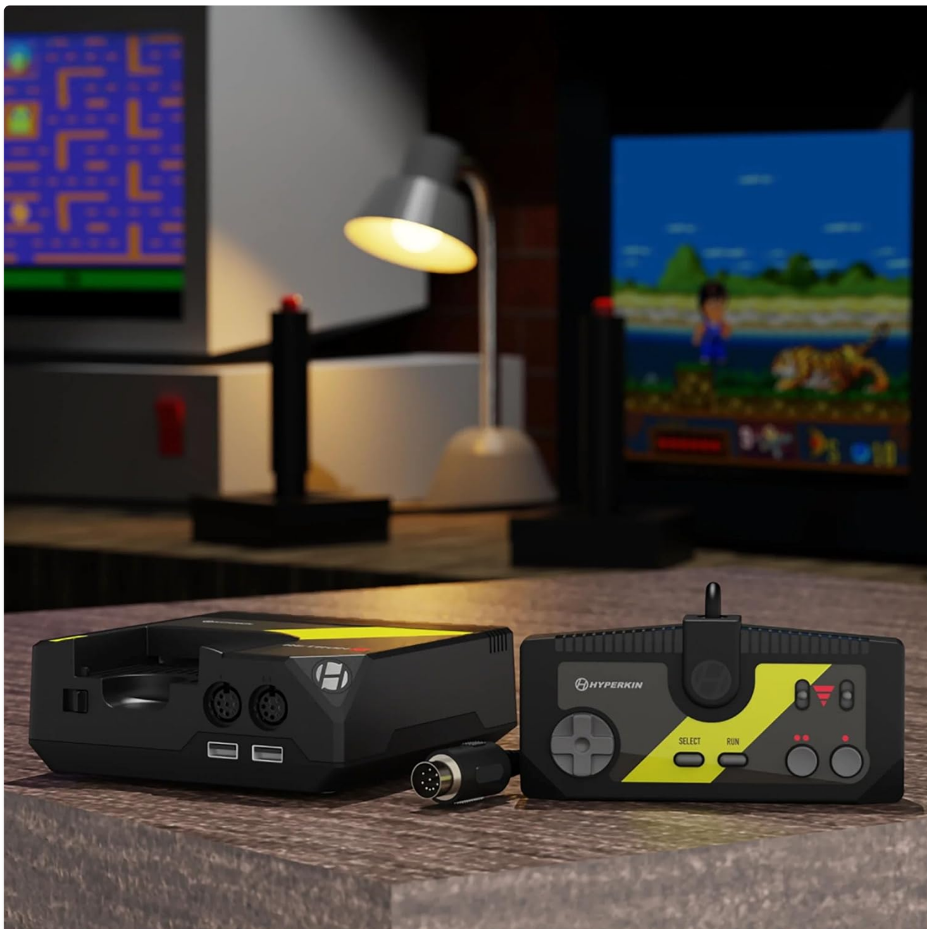
Image 4.1: The RetroN GX console and controller connected to a television, ready for gameplay.