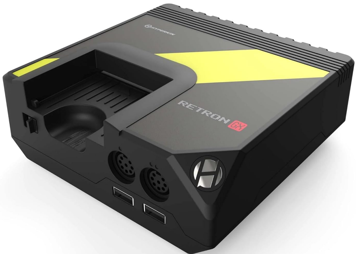
Image 3.1: Top view of the RetroN GX console, highlighting the cartridge slot and controller ports.