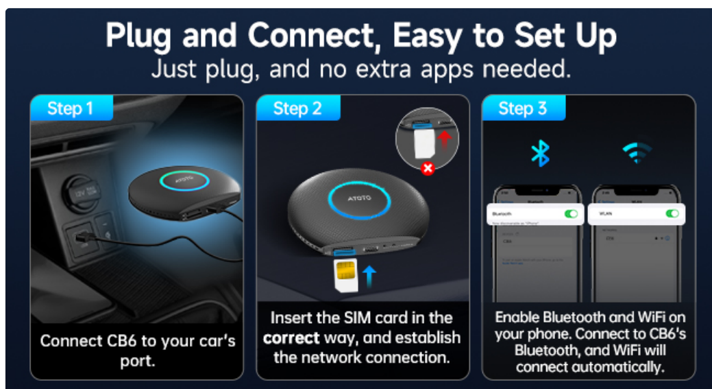
Image: Visual guide for connecting the CB6A to your car, inserting a SIM card, and pairing with your phone via Bluetooth and Wi-Fi.