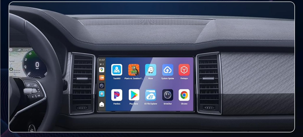
Image: Visual representation of the CB6A AI Box enabling wireless CarPlay and Android Auto from a wired connection.