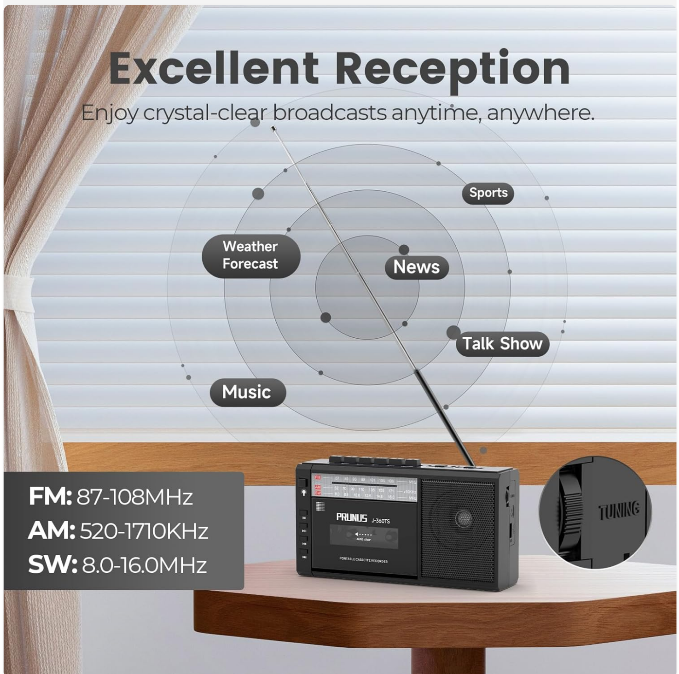
Image: The PRUNUS J-360TS demonstrating its radio reception capabilities with an extended antenna and listed frequency bands.