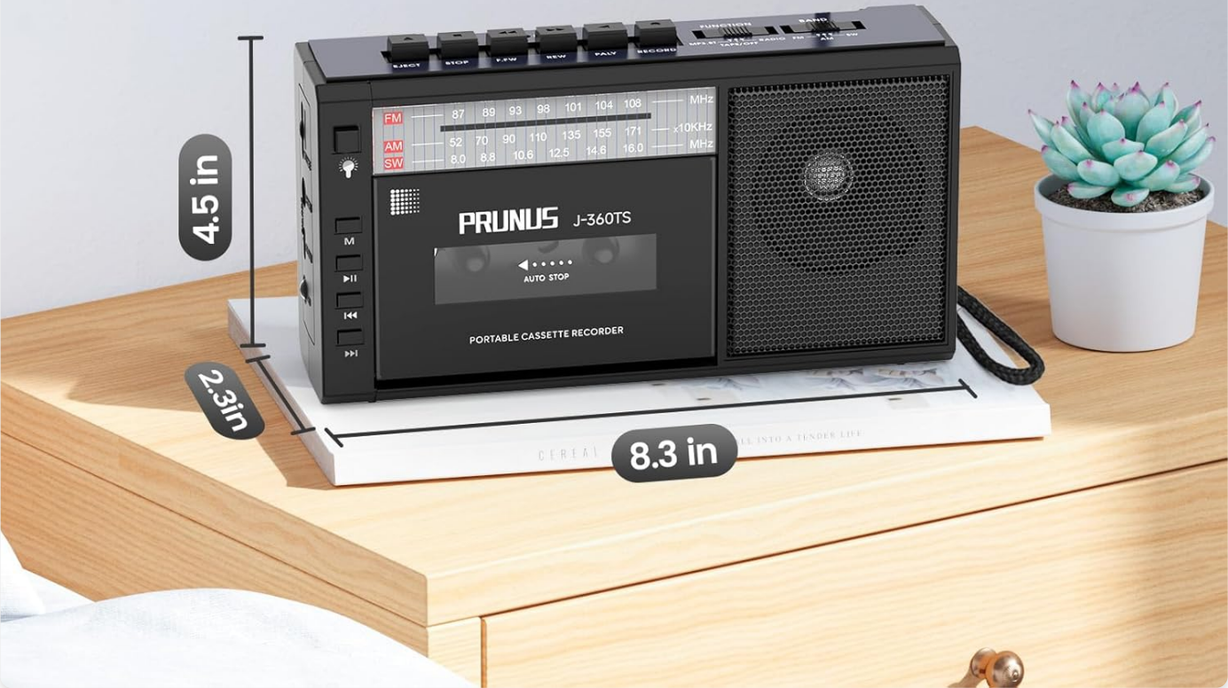
Image: The PRUNUS J-360TS highlighting its compact and portable design with dimensions and weight.