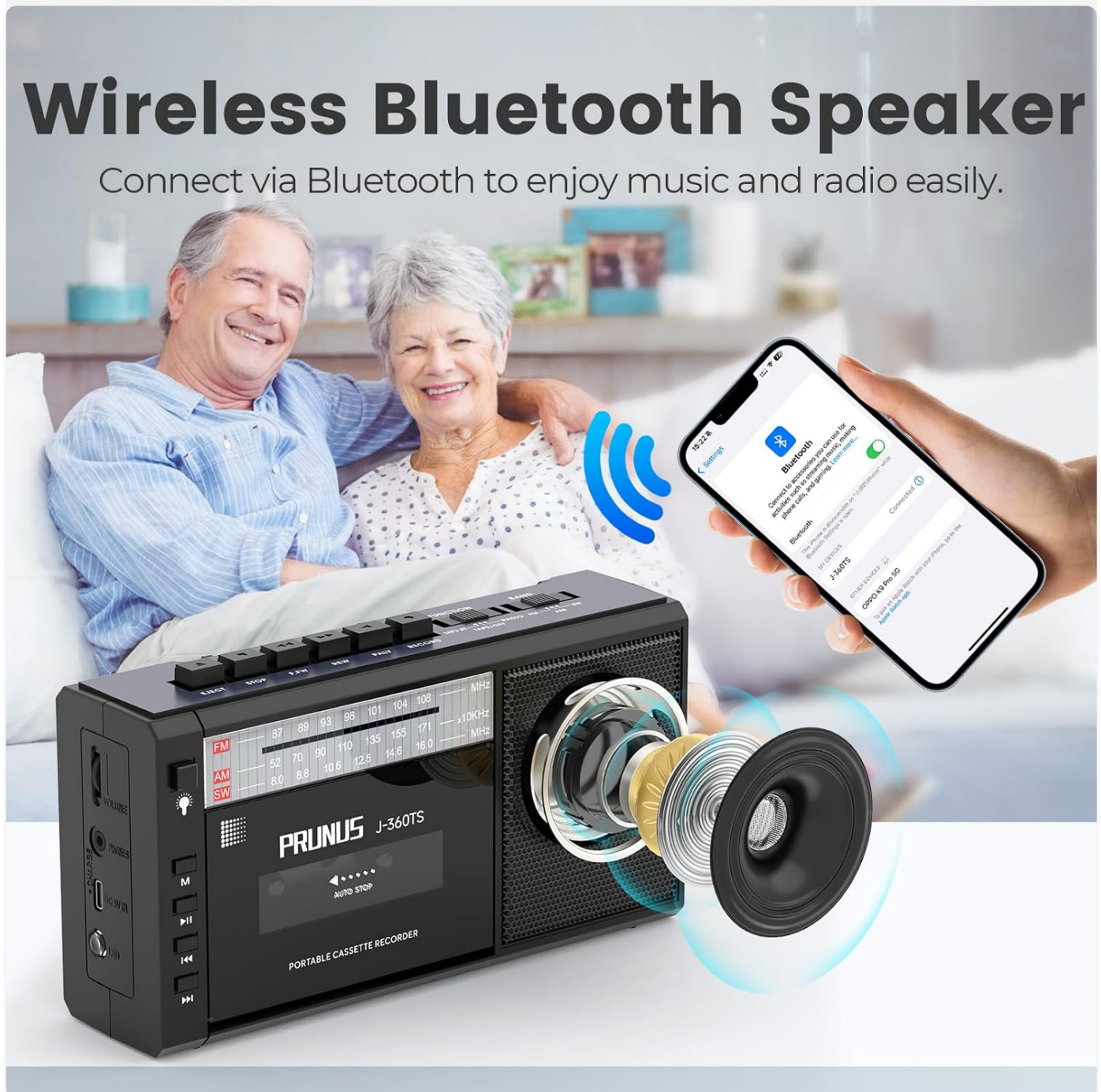
Image: The PRUNUS J-360TS functioning as a wireless Bluetooth speaker, connected to a mobile phone.