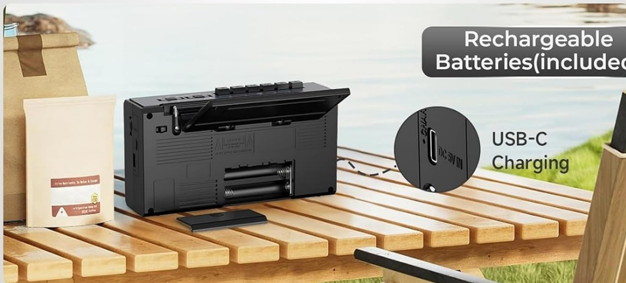
Image: Illustration of the two primary power sources: the solar panel and the rechargeable batteries accessible via USB-C charging.