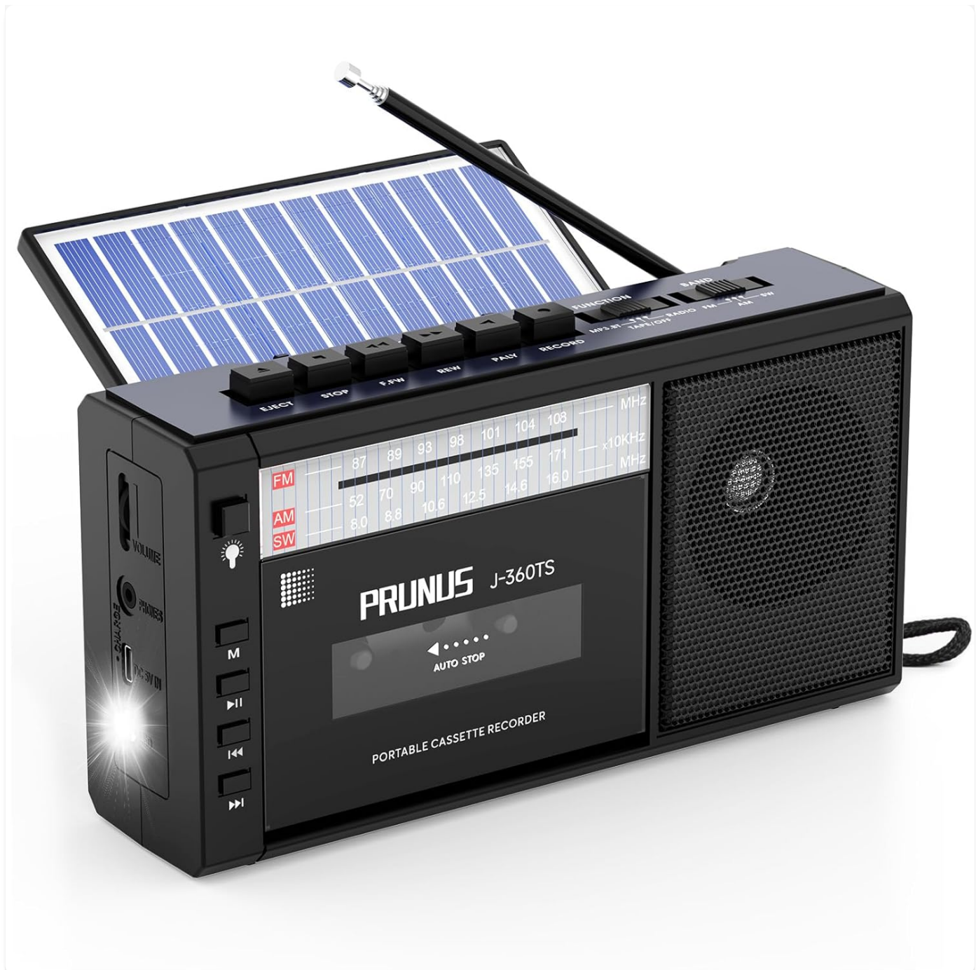
Image: The PRUNUS J-360TS unit, showcasing its solar panel, flashlight, and overall design.