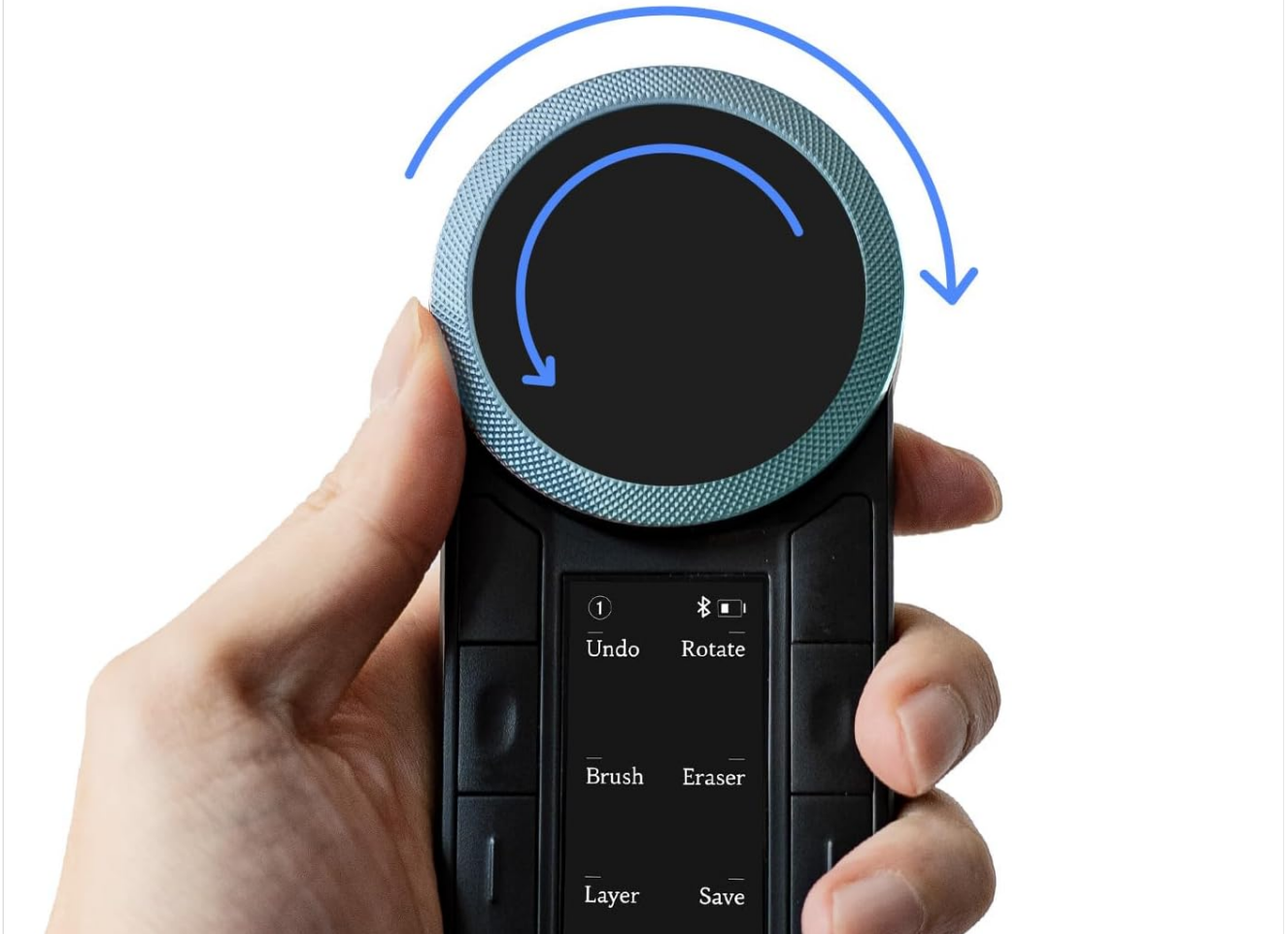
Image 3.1: A hand demonstrating the use of the dual dials on the Keydial Remote, highlighting the inner and outer ring functionality.

The dial controller is comprised of an inner circle and an outer ring, enabling quick access to two different functions with one hand.