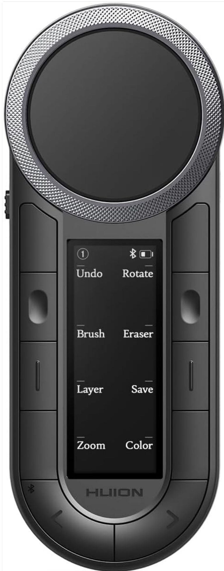
Image 1.1: Front view of the HUION Keydial Remote, showcasing its compact design and OLED display.