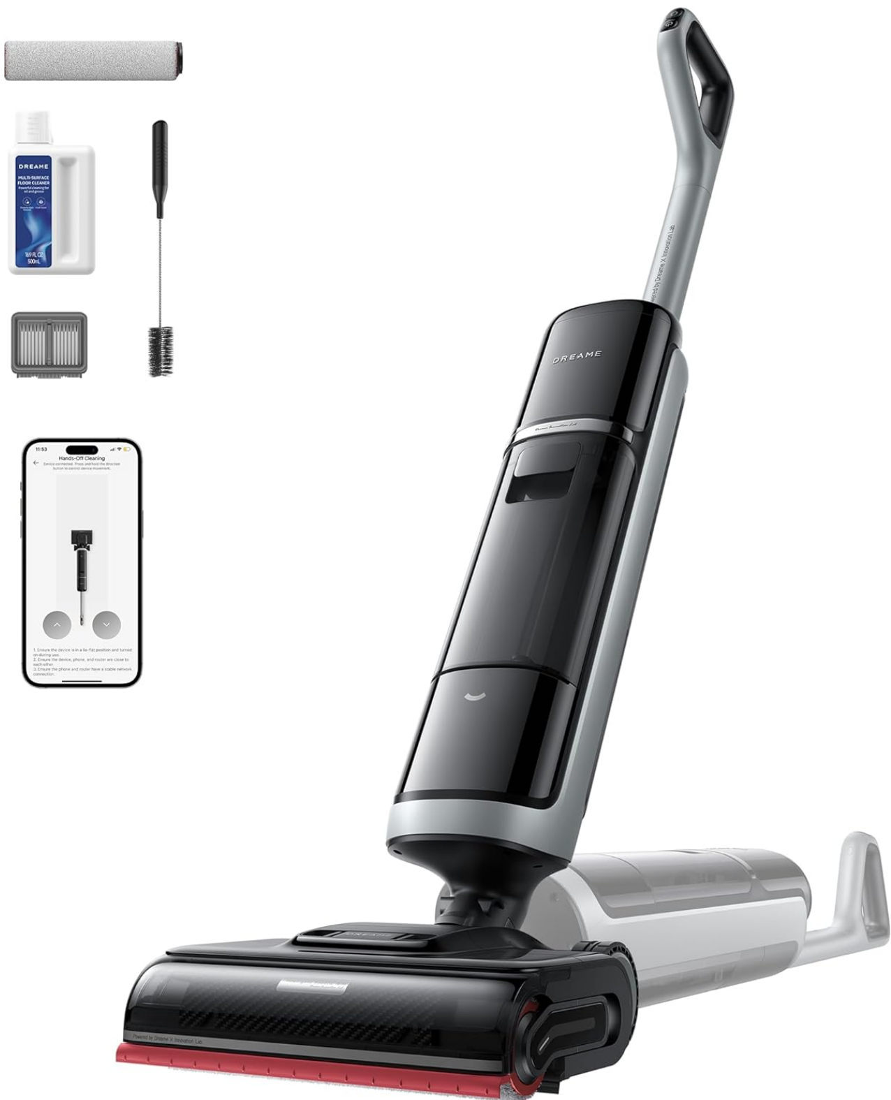
Image: DREAME H15 Pro Heat Wet Dry Vacuum Cleaner with its included accessories, showcasing its sleek design and components.