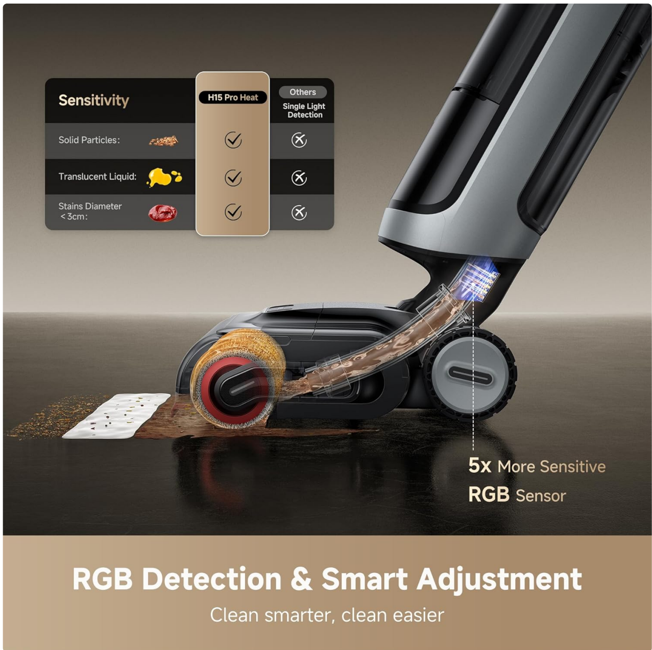
Image: The DREAME H15 Pro Heat's RGB detection system, showing its sensitivity to different types of dirt for smart adjustment of cleaning power.