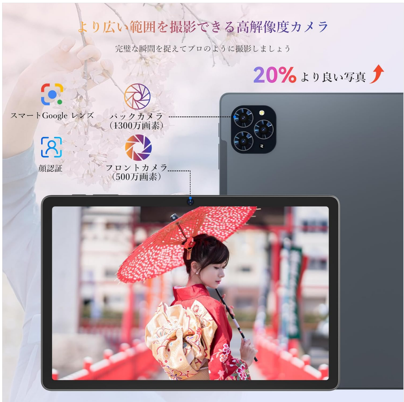
Image: Camera interface and rear camera module.