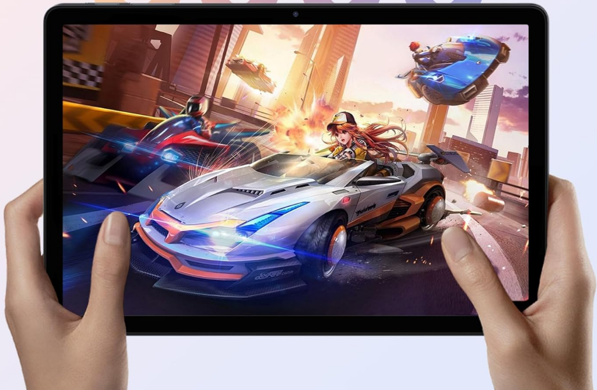
Image: 8000 mAh battery capacity and usage estimates.