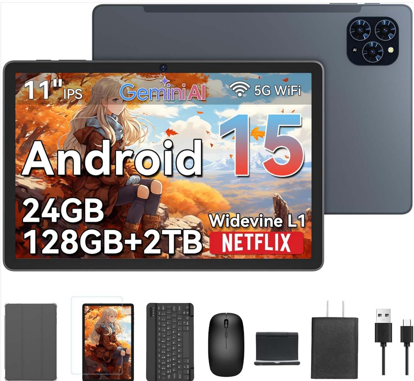
Image: TABWEE T90 Tablet and its complete set of accessories.