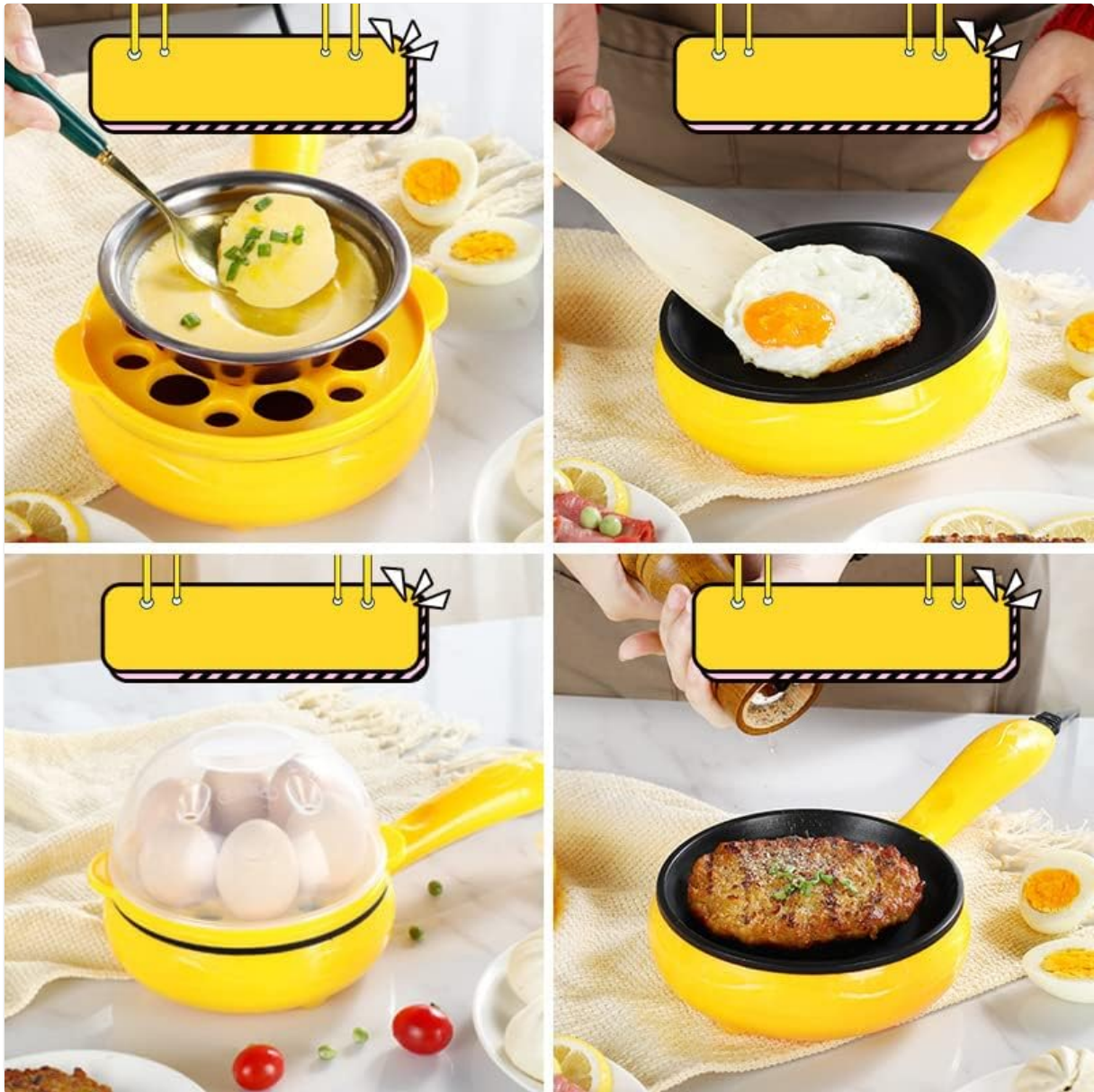
Image Description: A person is carefully lifting a fried egg from the non-stick frying pan of the Jwthee Egg Cooker using a wooden spatula. The egg appears fully cooked, and the pan's non-stick properties are evident as the egg easily detaches. Other food items are visible in the background.