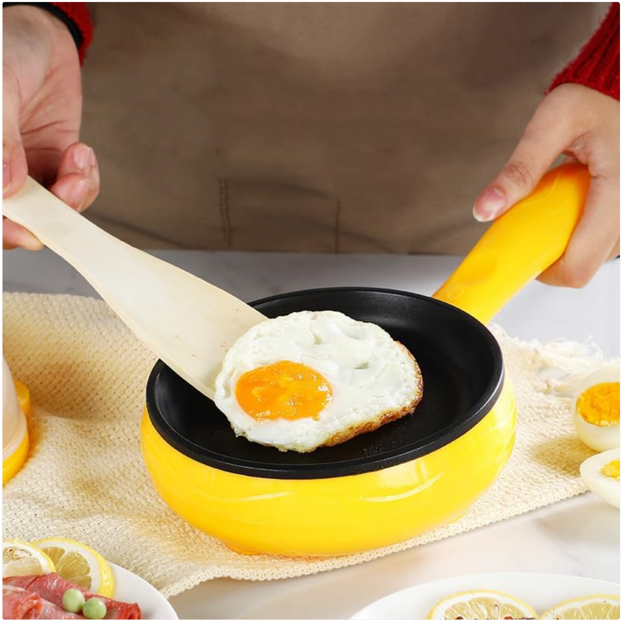
Image Description: A perfectly fried egg with a bright yellow yolk and crispy white is shown cooking in the non-stick frying pan of the Jwthee Egg Cooker. The yellow handle of the cooker is visible, and the image highlights the pan's non-stick surface.