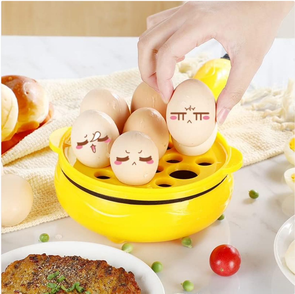
Image Description: A hand is gently placing an egg with a drawn face onto the yellow egg steaming rack of the Jwthree Egg Cooker. Several other eggs are already in place, some also with drawn faces, indicating the cooker's capacity for multiple eggs. The cooker is on a white countertop with other food items in the background.