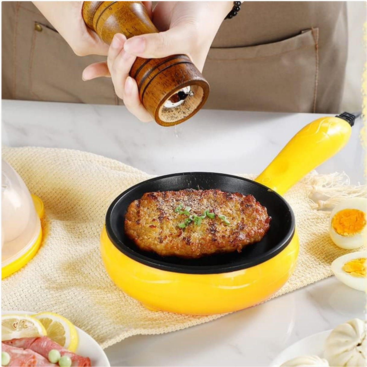
Image Description: A person is seasoning a cooked patty with a pepper grinder while it rests in the non-stick frying pan of the Jwthee Egg Cooker. The yellow cooker is on a light-colored cloth on a countertop, with other food items like boiled eggs and lemon slices in the background, demonstrating its use for frying.