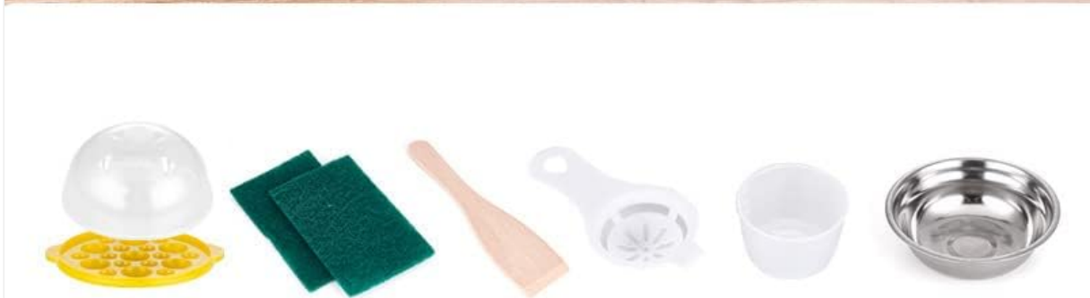
Image Description: An overhead view of the Jwthee 2-in-1 Egg Cooker showing its main unit (yellow base with handle and power cord), a transparent dome lid, an egg steaming rack, a small wooden spatula, a white egg separator, a small measuring cup, and a small stainless steel bowl. This image illustrates the various accessories included with the product.