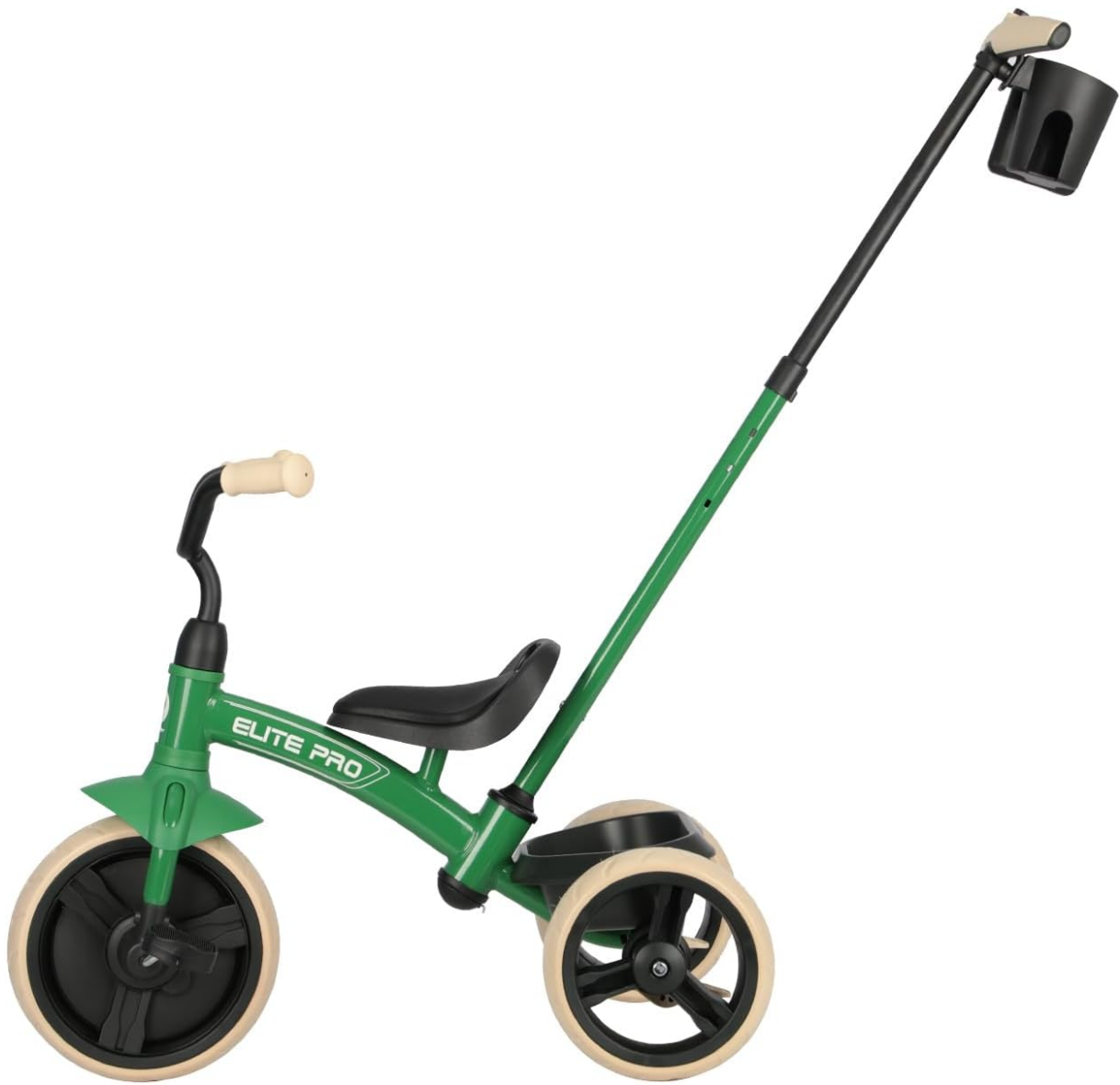
Figure 8.1: QPLAY Elite Pro Trike dimensions.