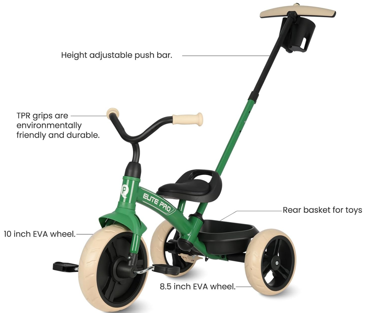
Figure 4.1: Labeled components of the QPLAY Elite Pro Trike.

A Joyful Companion for Your Child's Development.