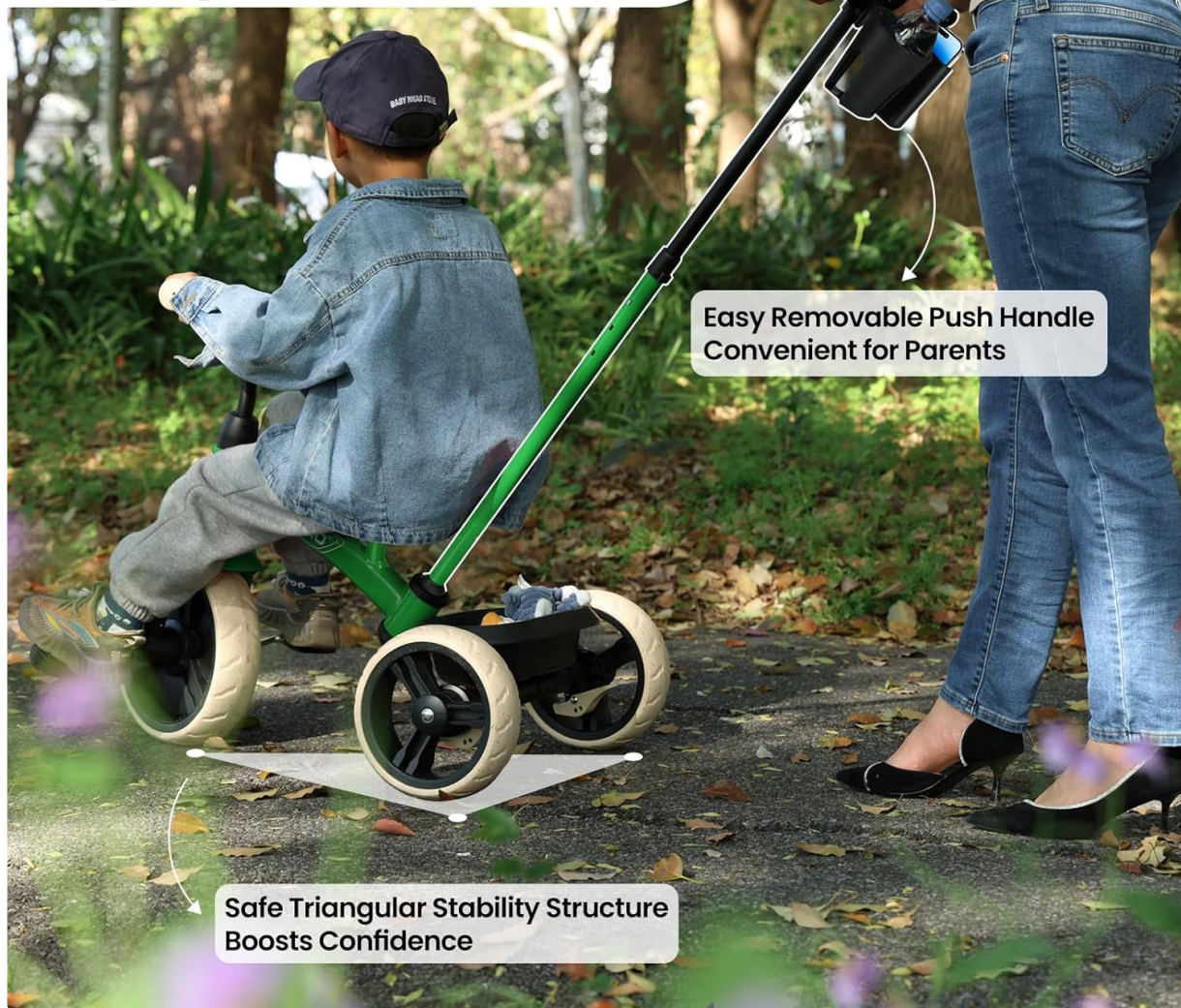
Figure 1.1: Child enjoying the QPLAY Elite Pro Trike in parent-push mode.