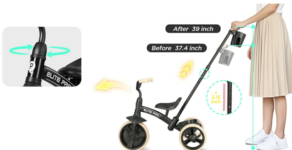
Figure 4.2: Adjustable push handle for parental comfort.