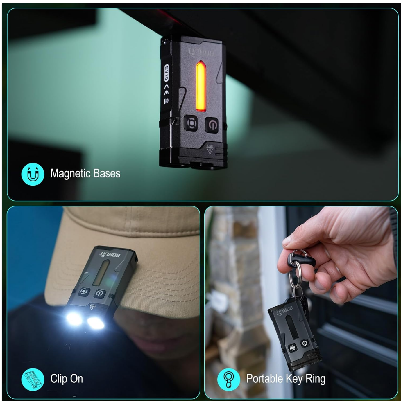
Image: Demonstrates the magnetic base feature, the flashlight clipped onto a cap, and attached to a keyring.