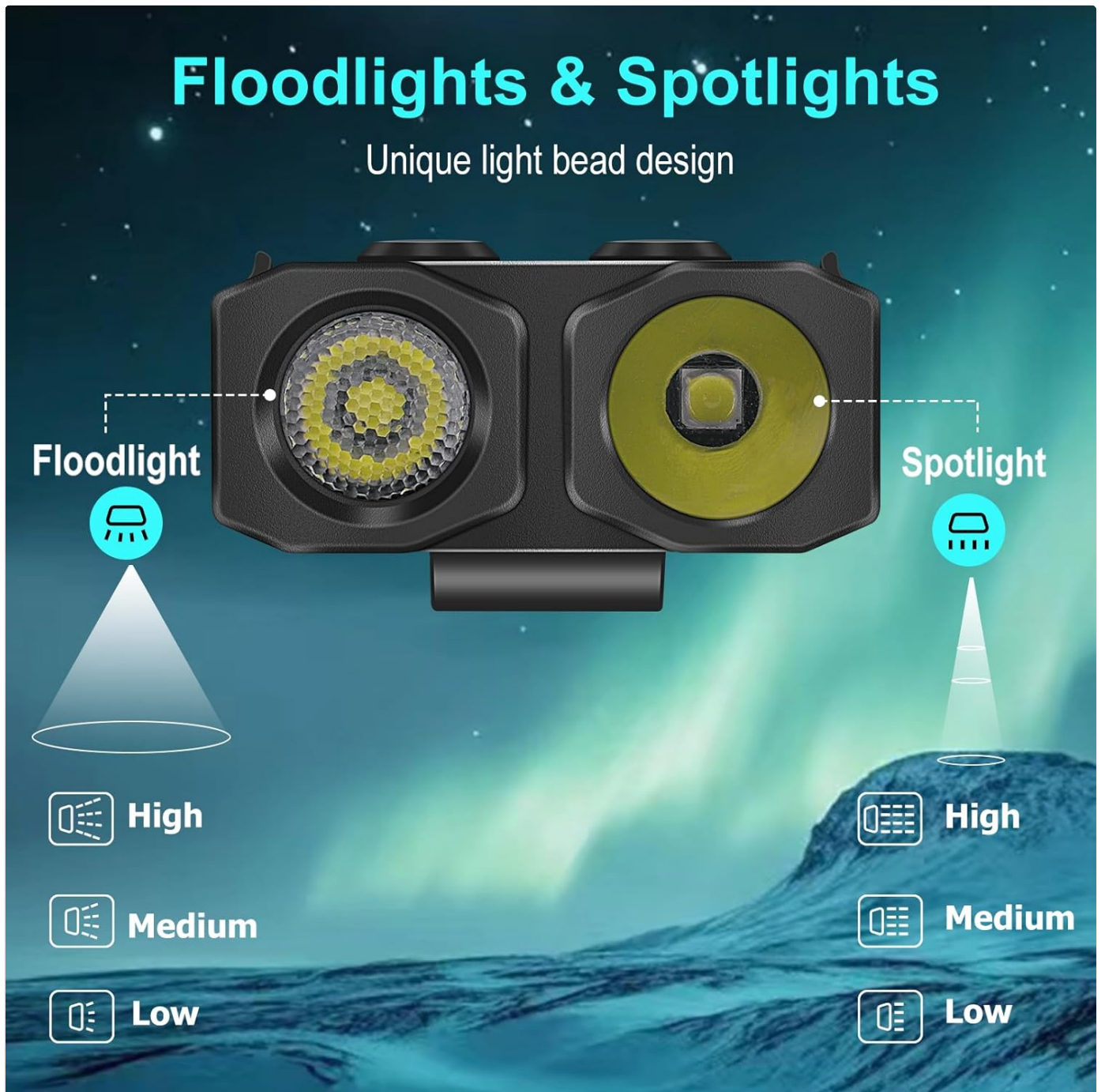
Image: Diagram illustrating the separate floodlight and spotlight beams of the EV10 flashlight, each with High, Medium, and Low settings.