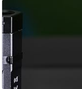
Image: The BORUIT EV10 flashlight magnetically attached to a metal surface, demonstrating its hands-free capability.

The EV10 flashlight is equipped with a strong magnetic tail, allowing it to be securely attached to metal surfaces. This feature provides hands-free illumination, useful for tasks like vehicle maintenance or working in dark spaces.