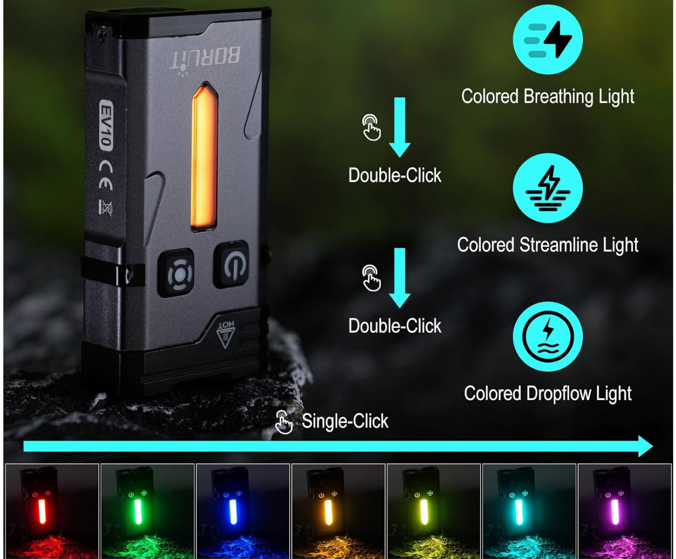
Image: Illustrates the various colorful side light modes including Colored Breathing Light, Colored Streamline Light, and Colored Dropflow Light, activated by single and double clicks of the right button. Shows a spectrum of static colors.