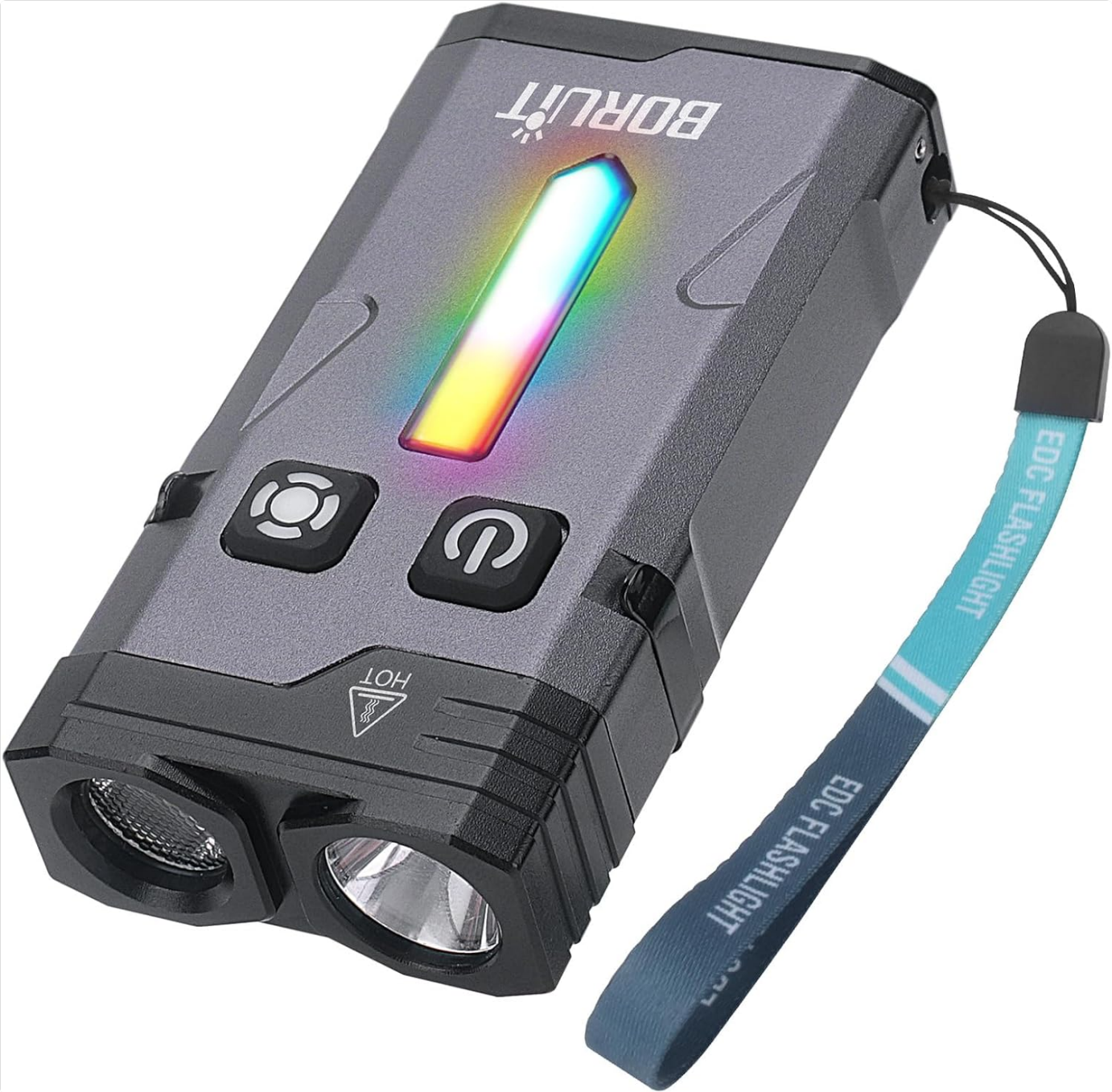
Image: The BORUIT EV10 EDC Keychain Flashlight, showcasing its compact design and RGB side light.

Please check the package contents to ensure all items are present: