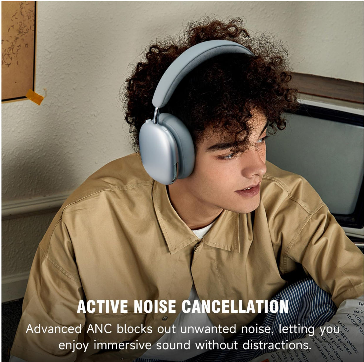
Image: A person wearing SUNJOM Freepods headphones, illustrating the active noise cancellation feature.