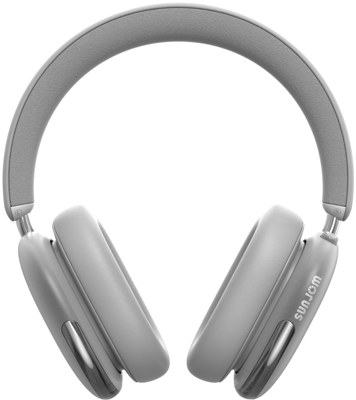
Image: SUNJOM Freepods Over-Ear Headphones in Silver.