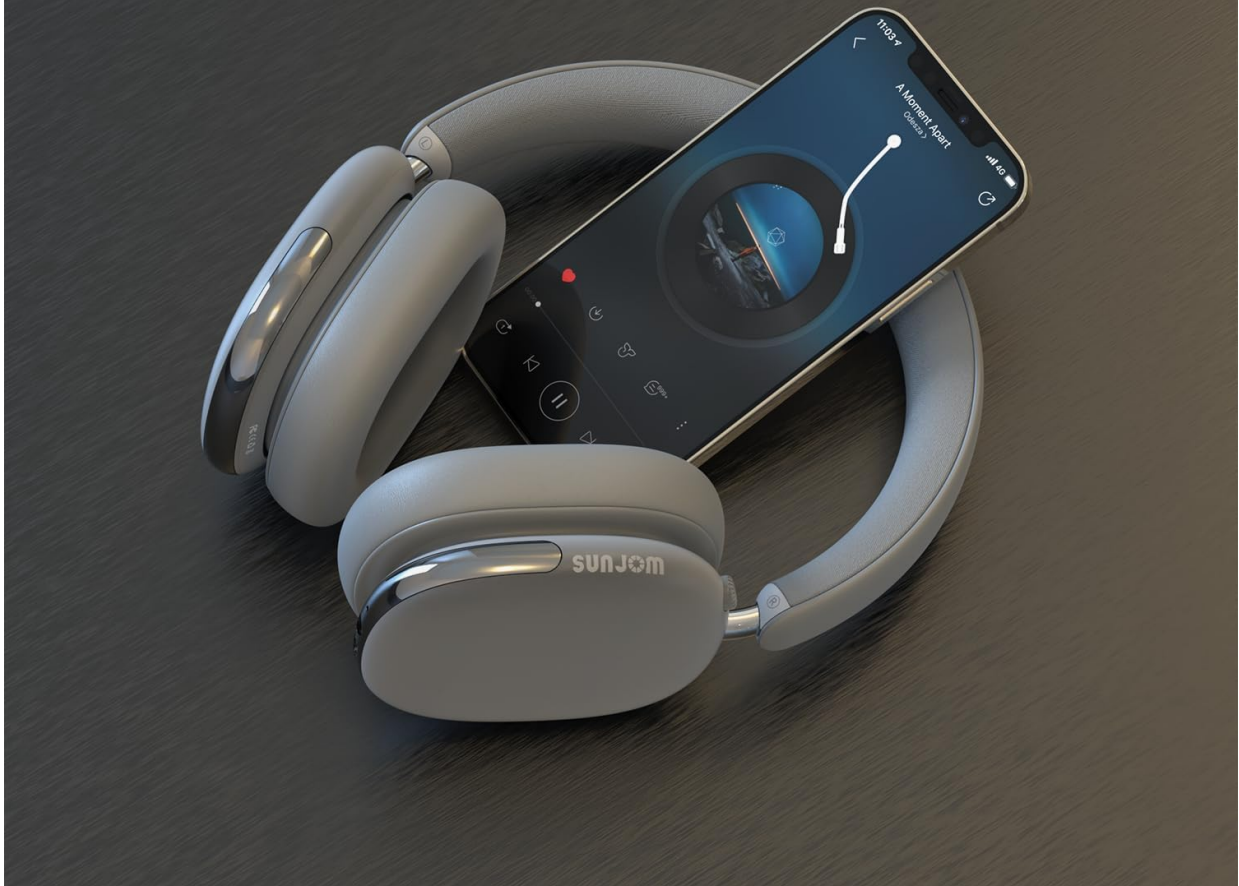
Image: The SUNJOM Freepods headphones connected wirelessly to a smartphone, demonstrating Bluetooth 5.4 technology.

Make your connection more stable and faster