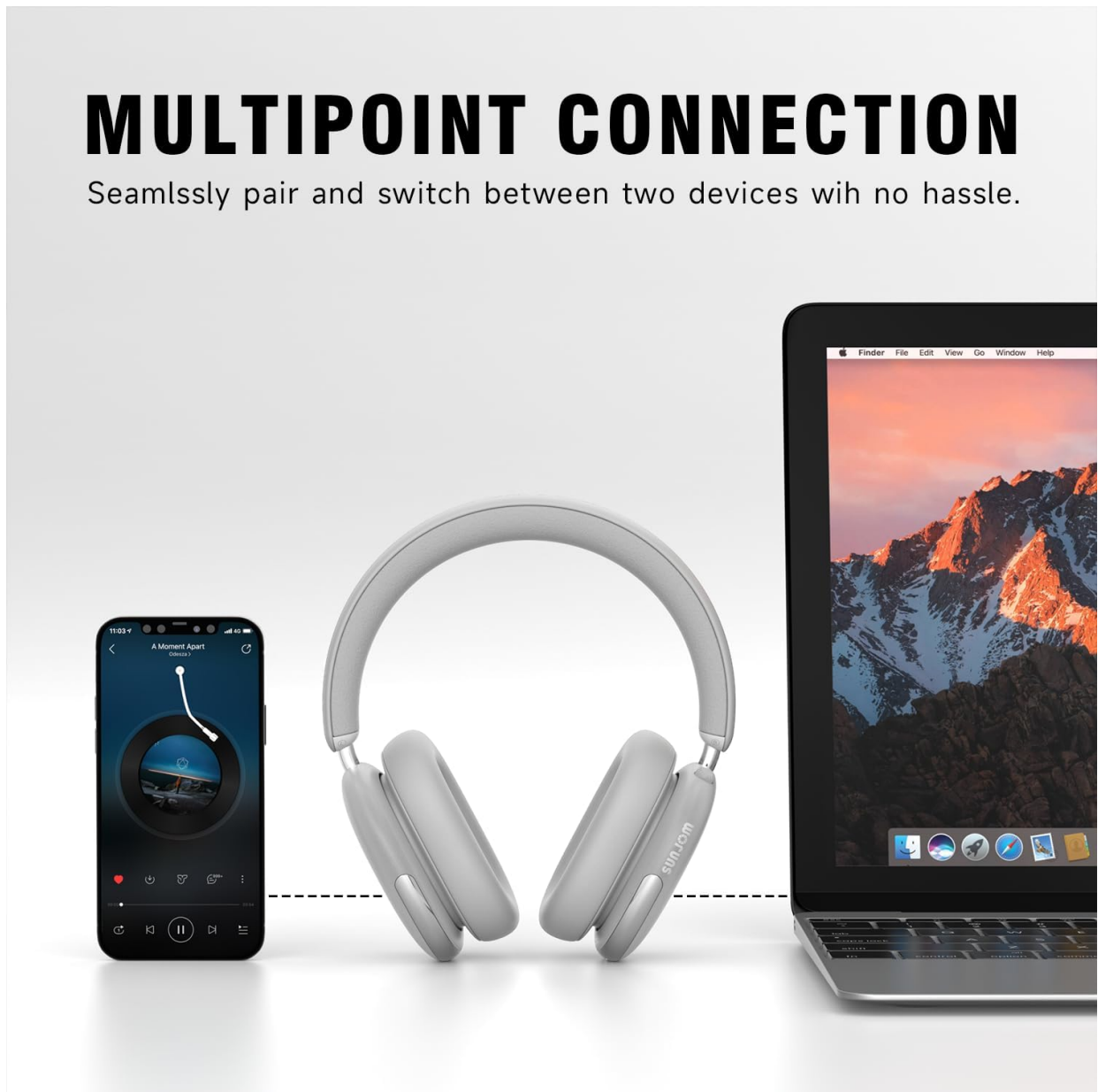
Image: SUNJOM FreePods headphones connected to a smartphone and a laptop, demonstrating multipoint connection.

Seamlessly pair and switch between two devices with no hassle.