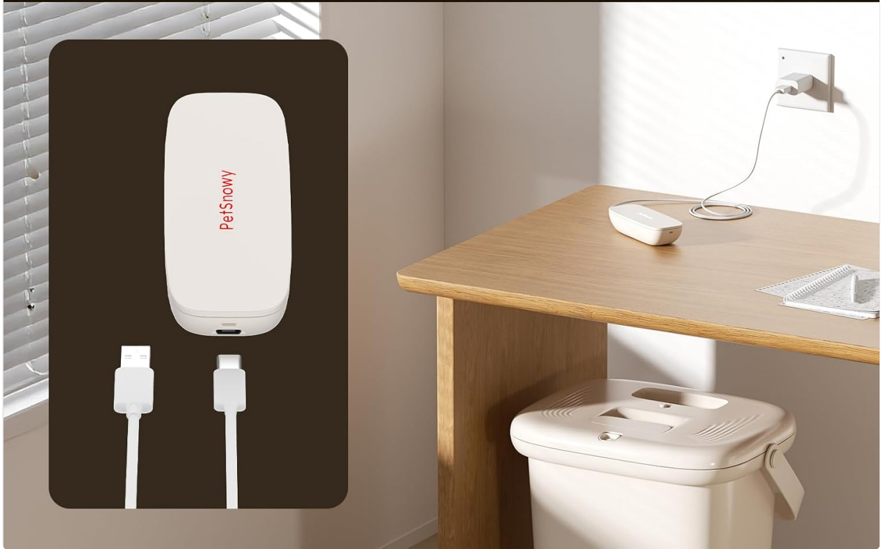
Image: The detachable Type-C charging unit is shown, emphasizing its ease of removal and charging.