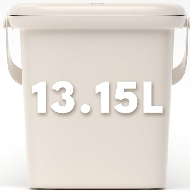
Image: The PetSnowy container prominently displays its 13.15L capacity, showcasing its ability to hold a large volume of pet food.