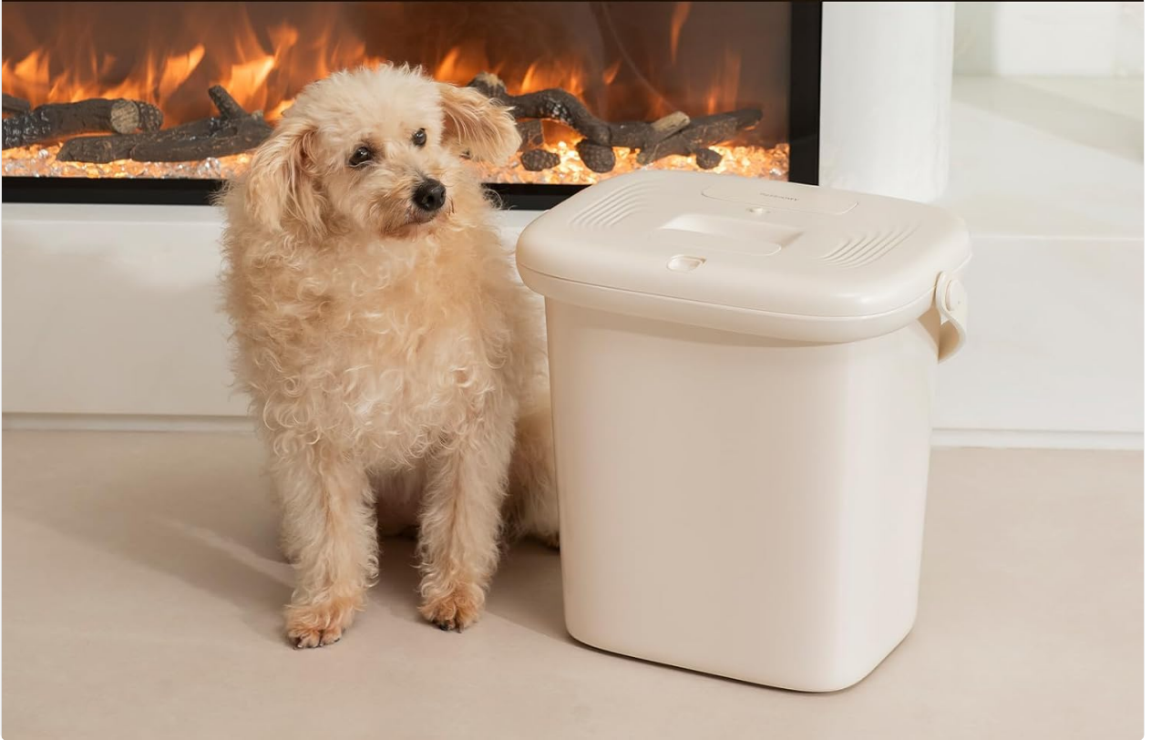
Image: A dog sits calmly beside the PetSnowy container, demonstrating its seamless integration into a pet-friendly home environment and its automatic sealing function.