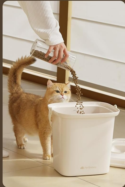
Image: An exploded view of the container's components and a cat being fed, illustrating the high-quality, food-grade materials used in its construction.