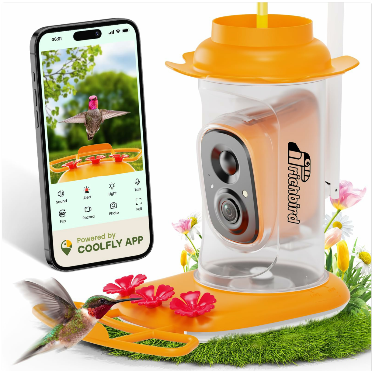
Image: RichBird Smart Hummingbird Feeder with Camera (Orange variant).