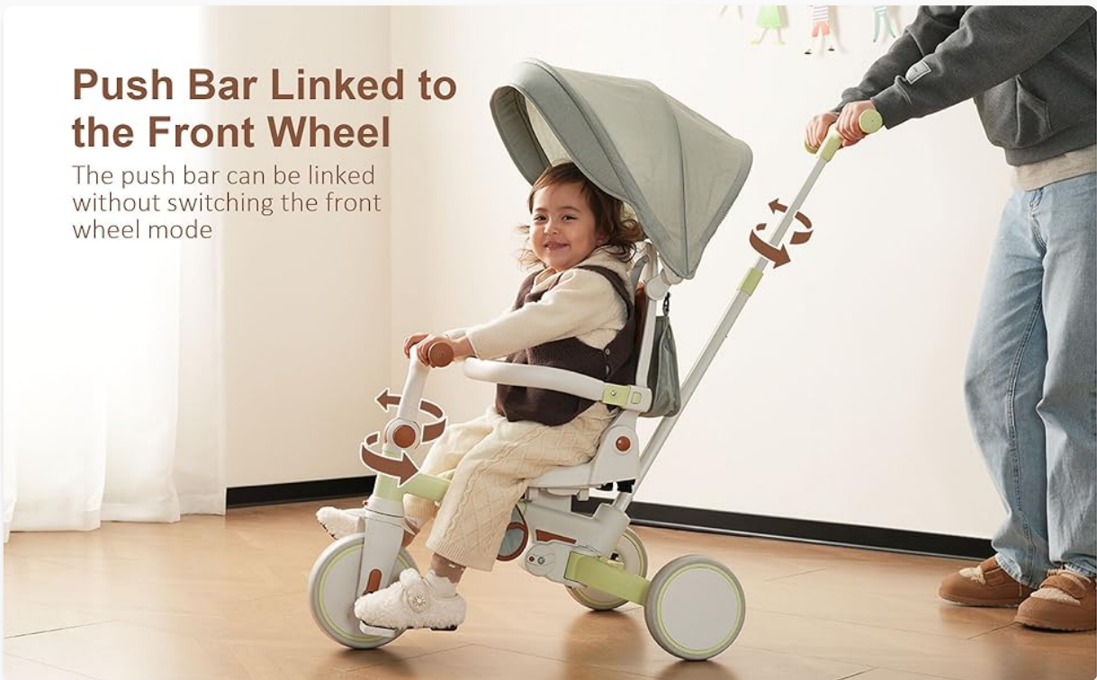
Image 5.2: Key features of the tricycle for enhanced usability and comfort.

The push bar can be linked without switching the front wheel mode