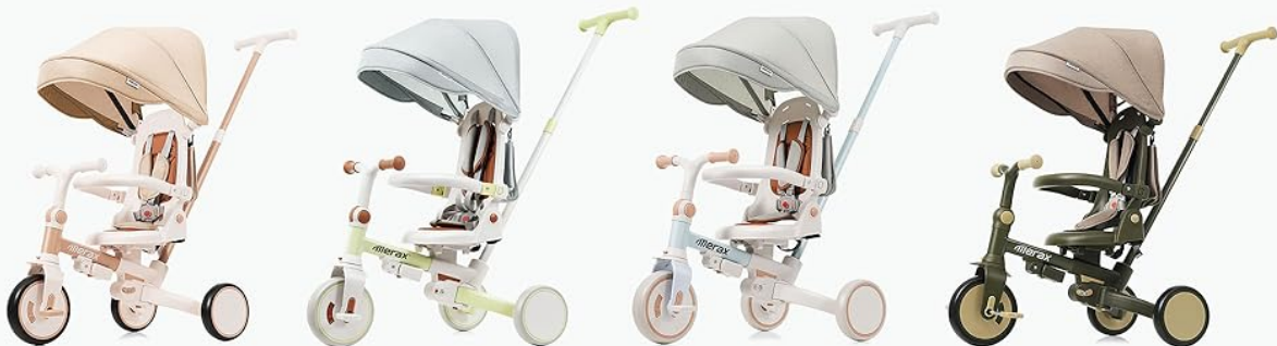
Image 1.1: The Merax 7-in-1 All-Terrain Kids Tricycle Stroller, showcasing its primary configuration.