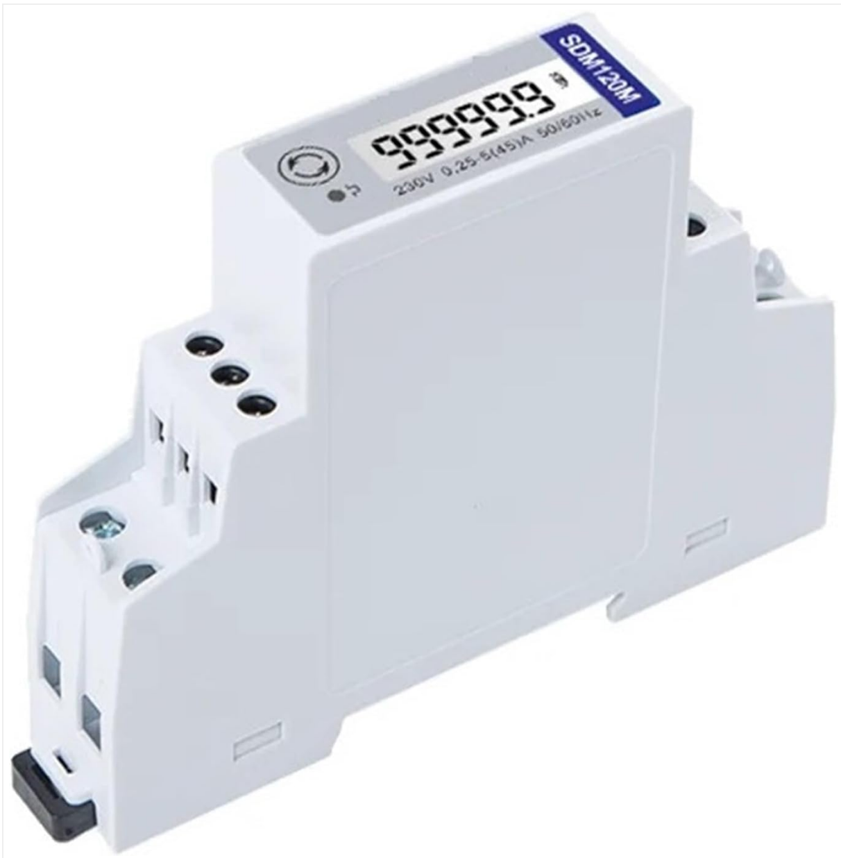
Figure 4: Dimensions of the SDM120M Meter, illustrating its physical measurements for installation planning.