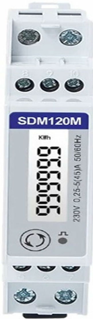
Figure 1: Front view of the TGP KPGTCTA SDM120M kWh Meter, displaying the digital readout and model identification.