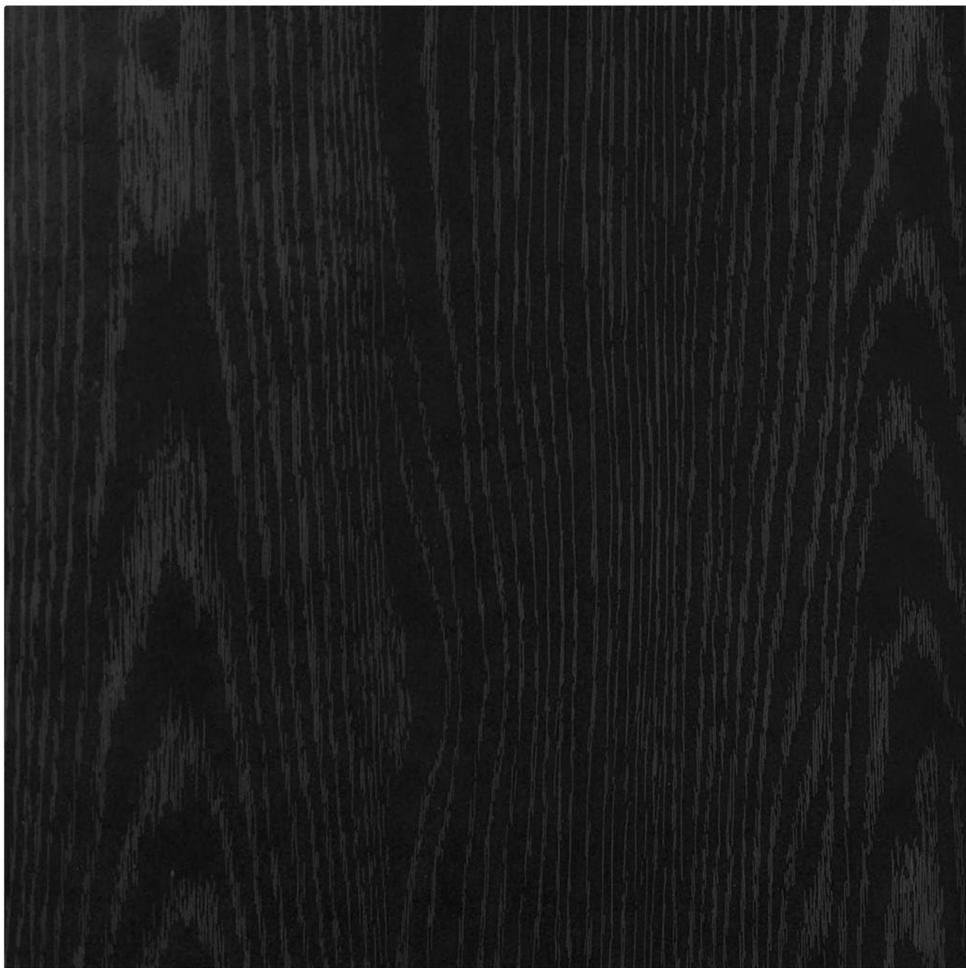
Image: Close-up of the black oak wood grain texture, highlighting the material's finish.