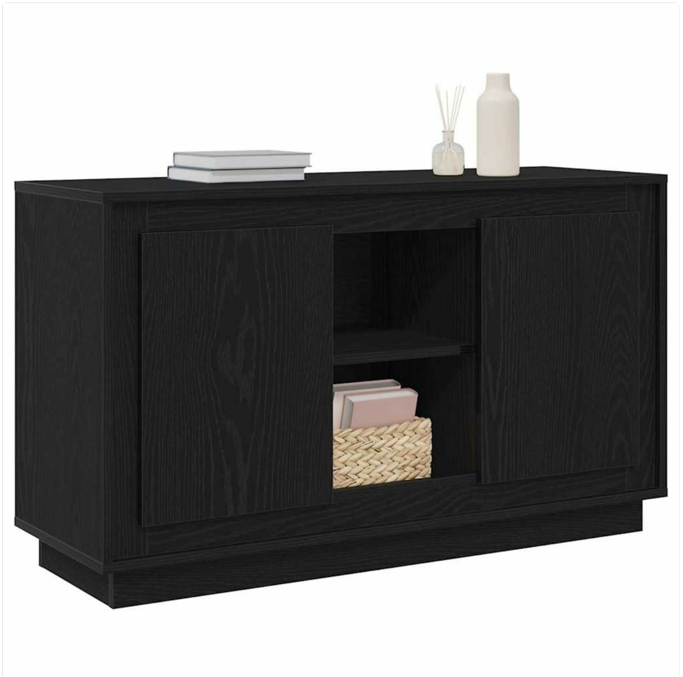
Image: The vidaXL Contemporary Black Oak Sideboard, showcasing its design and potential placement in a living room.