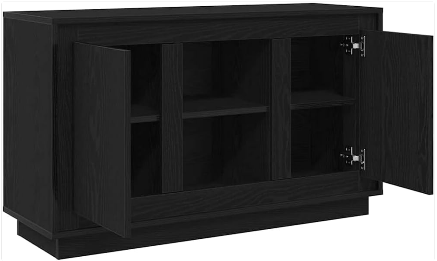
Image: The interior of the sideboard with doors open, showing the three storage compartments and the adjustable shelf.