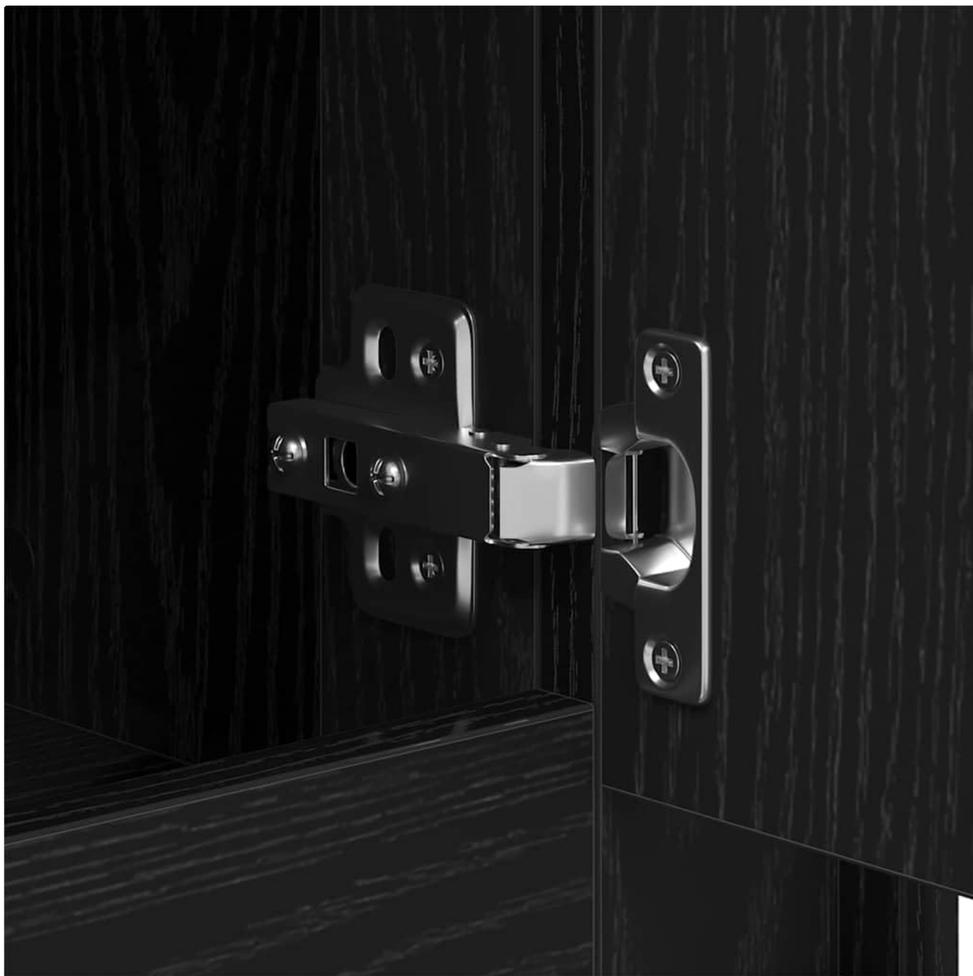
Image: Close-up view of a door hinge, illustrating the hardware used for door attachment.