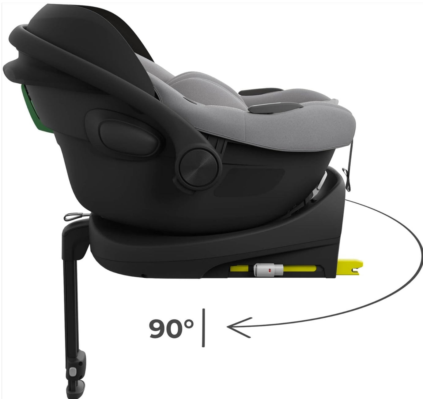
Image: Close-up of the infant carrier rotated 90 degrees on its base, illustrating the convenience for placing or removing a child.