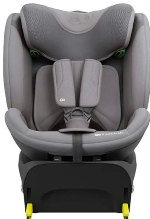
RWF 61-105 cm