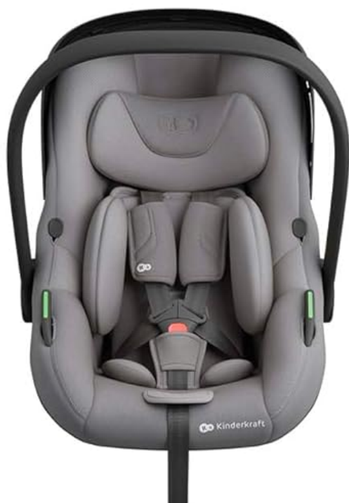
RWF 40-87 cm