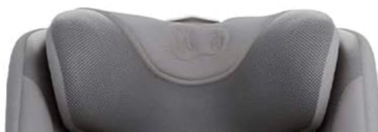
FWF 76-105 cm