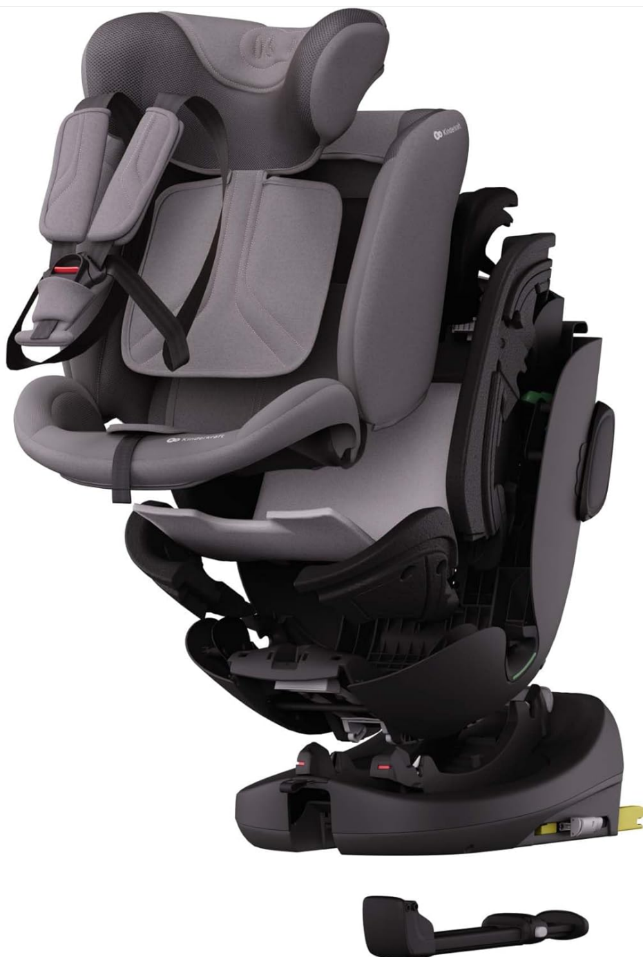
Image: An exploded view of the car seat, highlighting its internal structure, padding, and harness system, indicating I-Size compliance and a 10-year warranty.