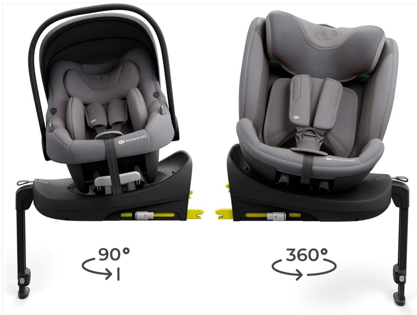
Image: The car seat demonstrating its 90-degree rotation feature for the infant carrier and 360-degree rotation for the toddler seat, facilitating child placement.