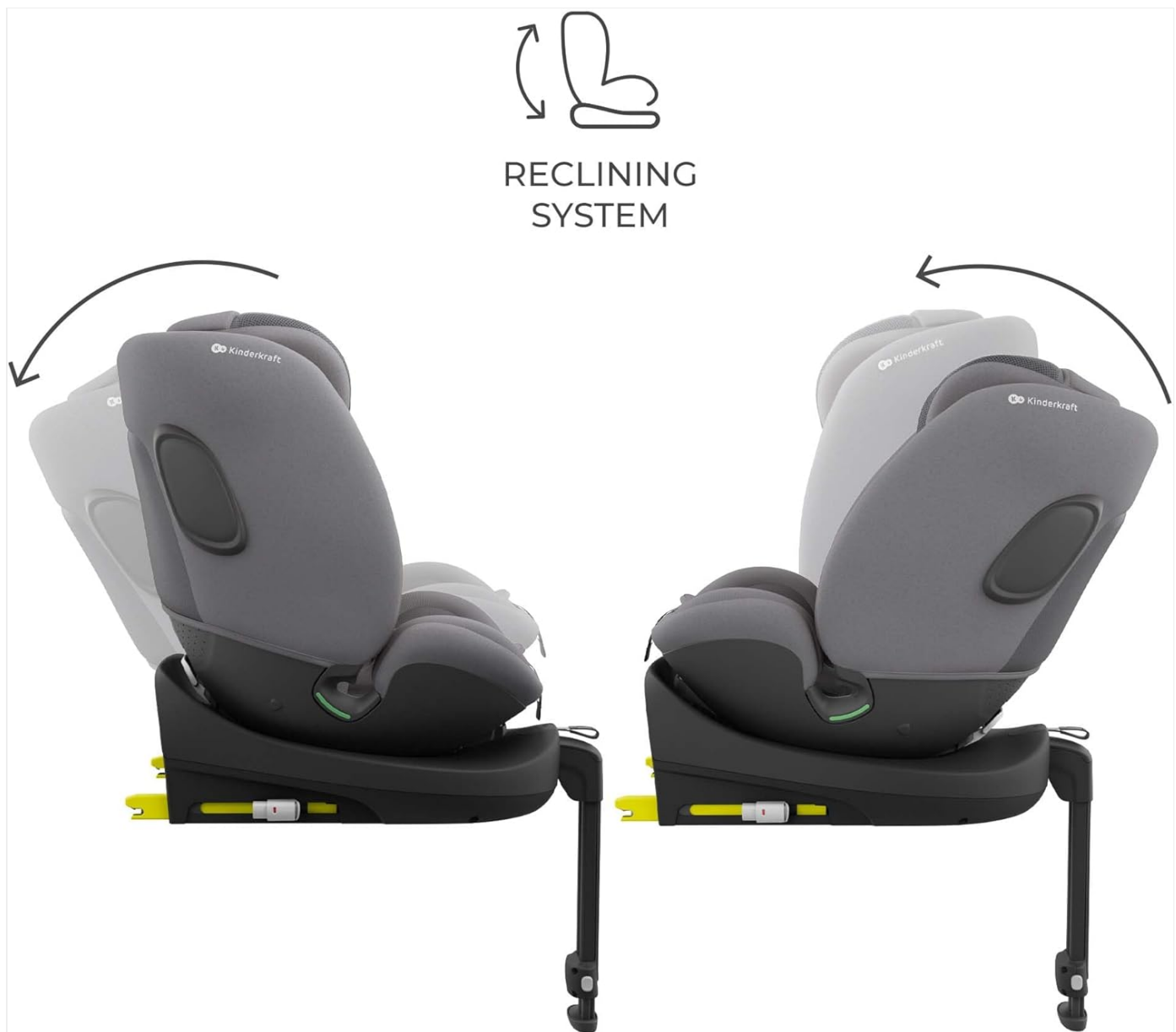
Image: Illustration of the car seat's reclining system, demonstrating various recline angles for optimal comfort and safety.