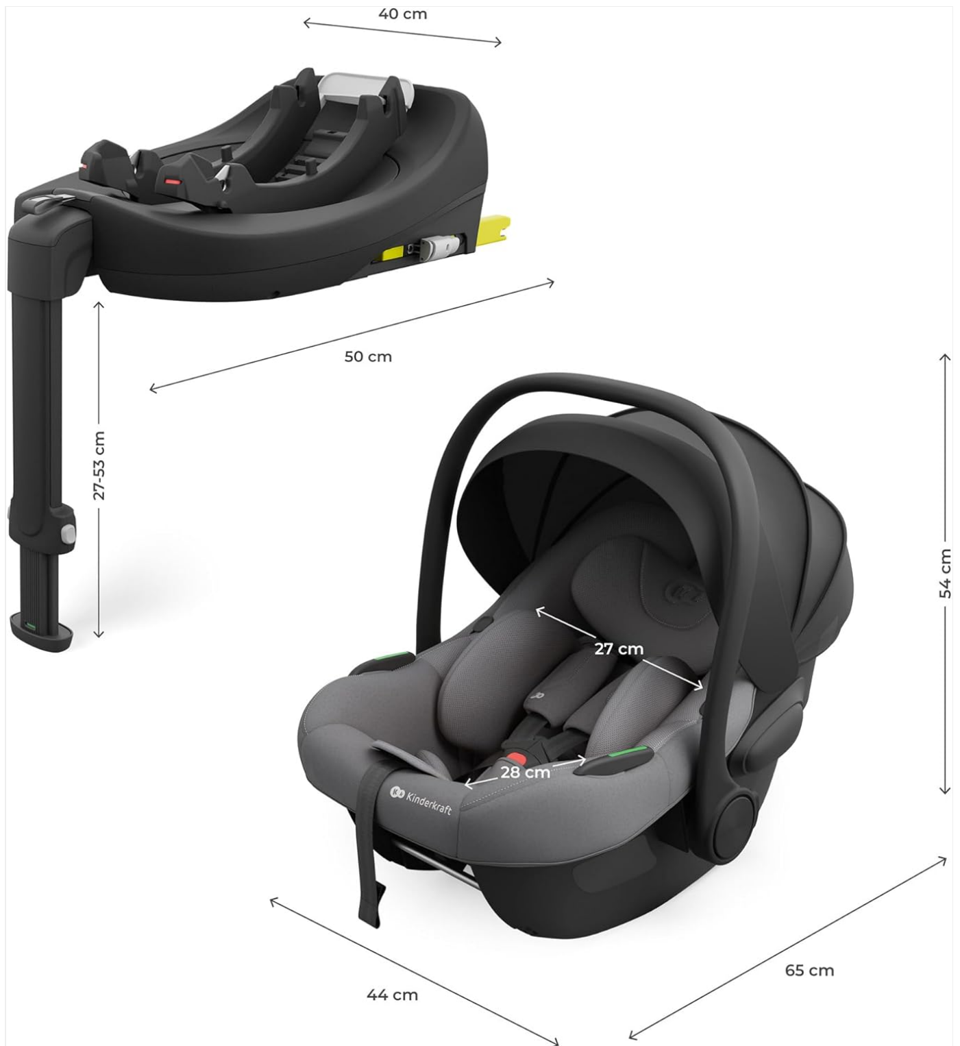
Image: Detailed dimensions of the infant carrier and the ISOFIX base, including height, width, and depth measurements for both components.

Image: Detailed dimensions of the toddler/child car seat component, including height, width, and depth measurements.