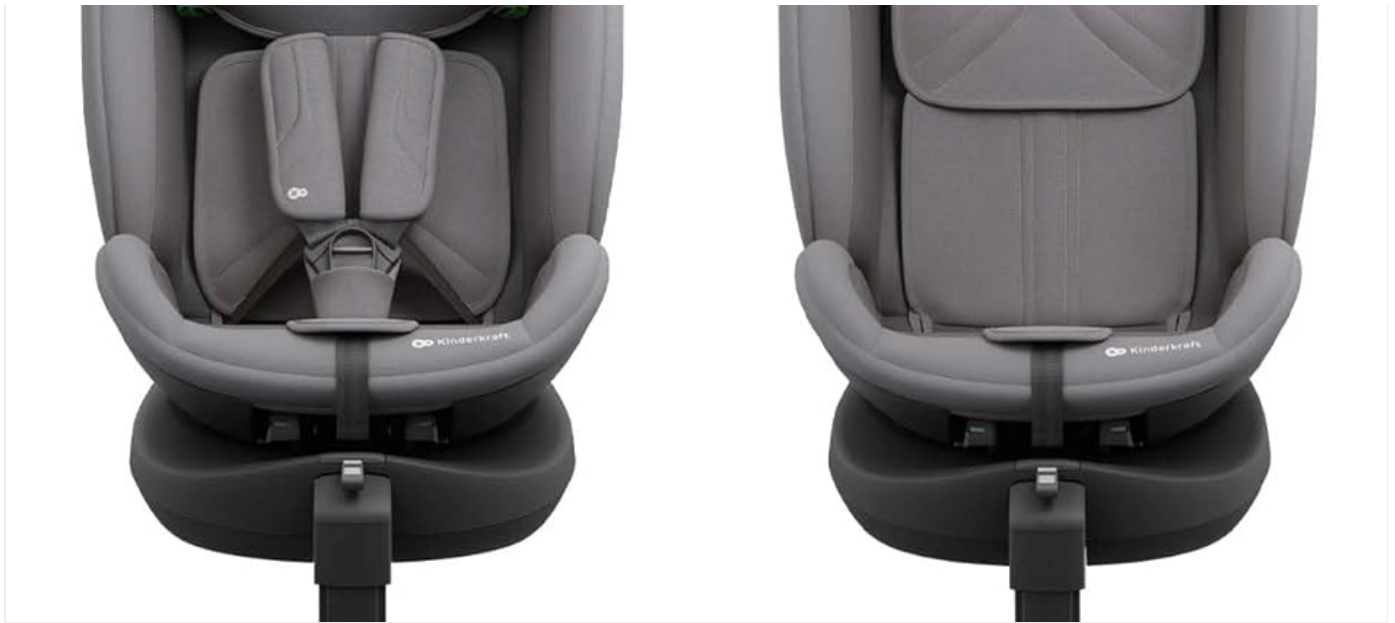
Image: Visual guide to car seat configurations from birth up to 12 years, detailing rear-facing (RWF 40-87 cm, RWF 61-105 cm) and forward-facing (FWF 76-105 cm, FWF 100-150 cm) positions based on child height.