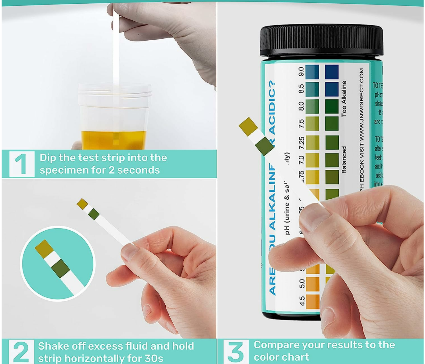
Image: Visual guide demonstrating the three simple steps for using the pH test strips: dipping the strip, shaking off excess liquid, and comparing the result to the color chart.