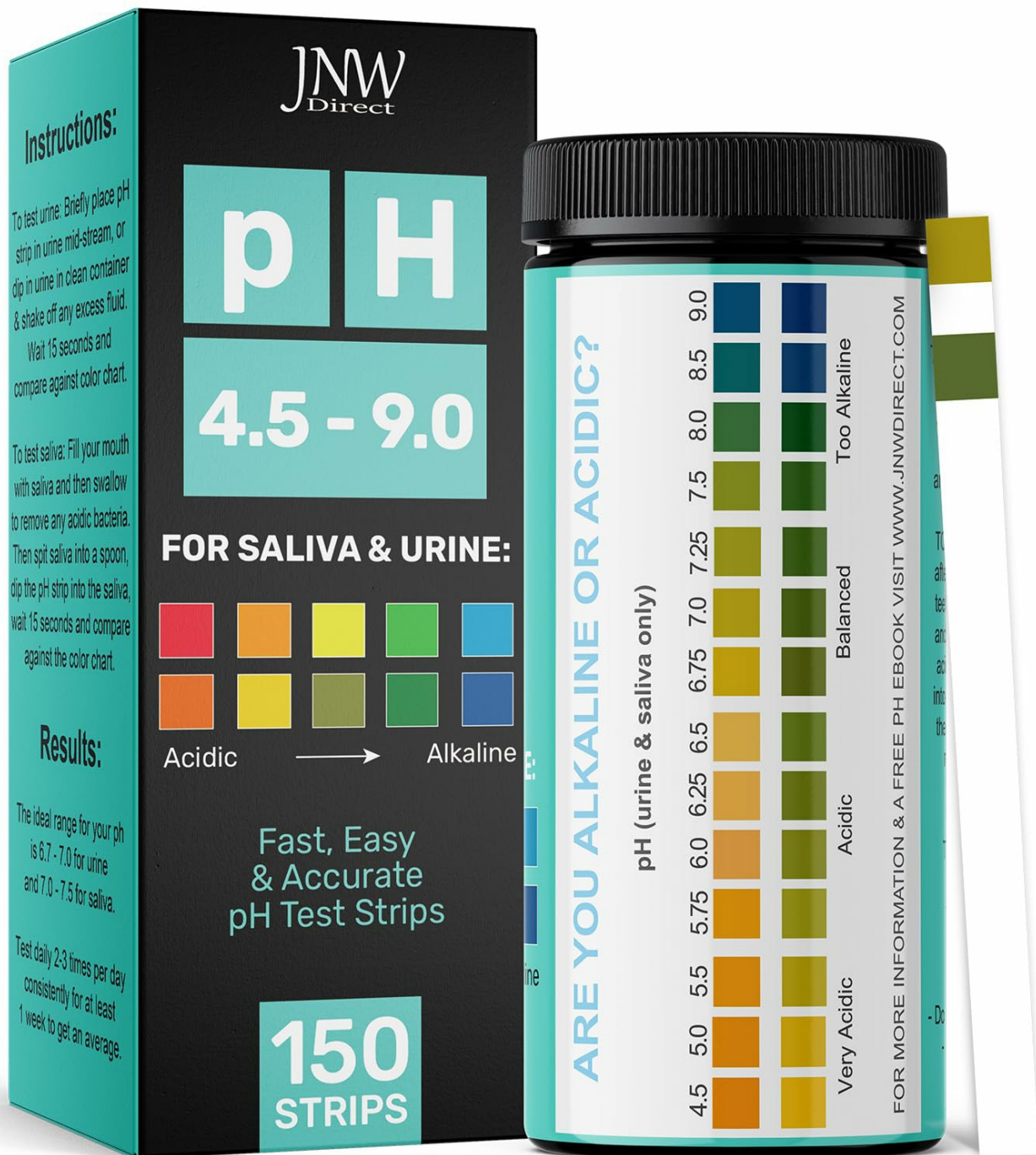
Image: JNW Direct pH Test Strips kit, showing the bottle, packaging, and the integrated color chart for easy pH level comparison.