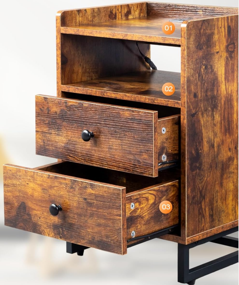
Figure 4: Multi-purpose storage options including top, open shelf, and drawers.

Your browser does not support the video tag.