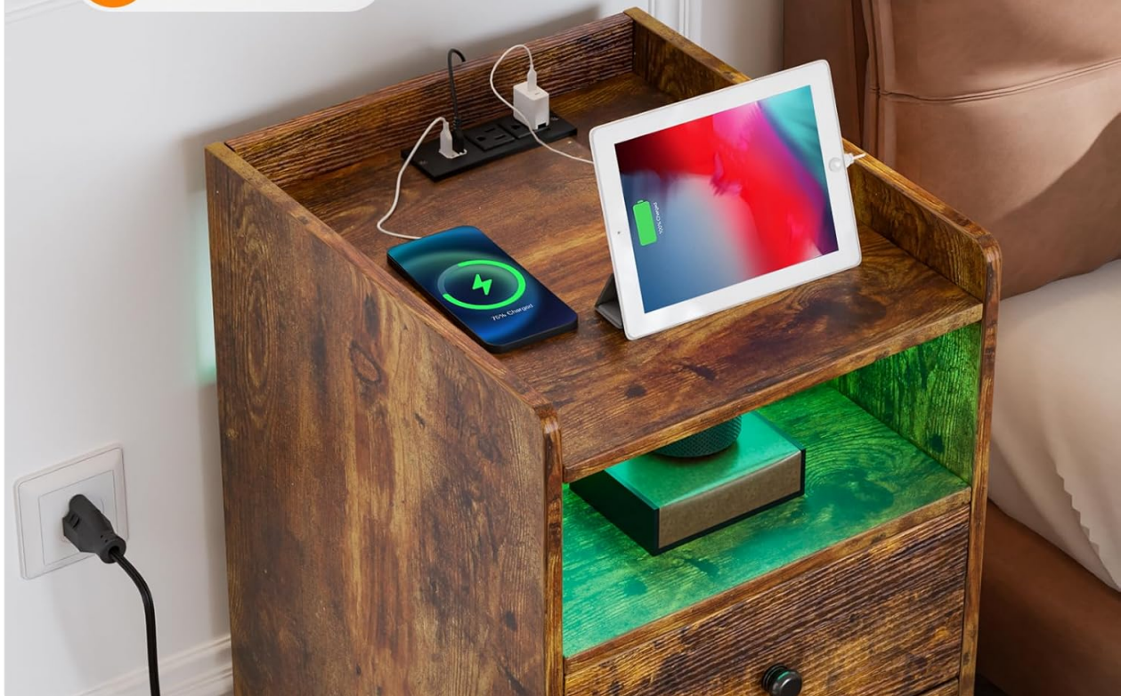
Figure 2: Integrated multi-device charging station on the nightstand's top surface.