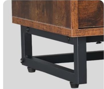
Sturdy Iron Frame Leg