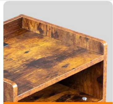
Durable Wood Board