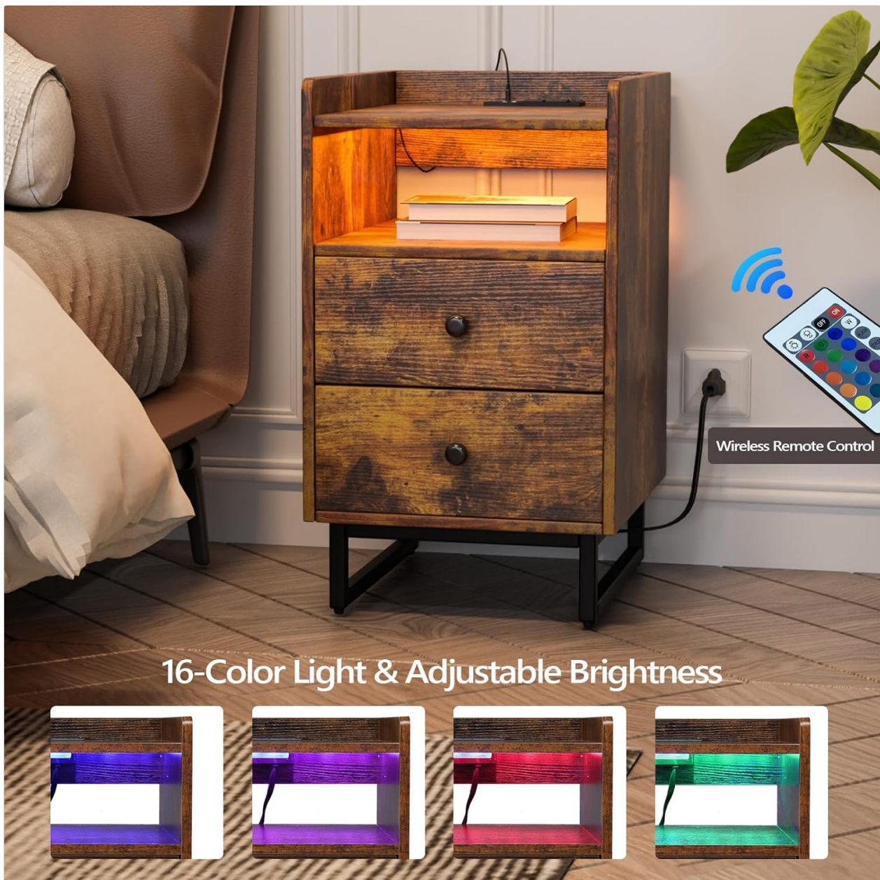
Figure 3: Nightstand with LED lights displaying various color options and remote control.