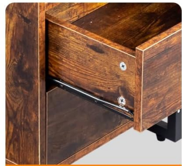
Metal Drawer Slide