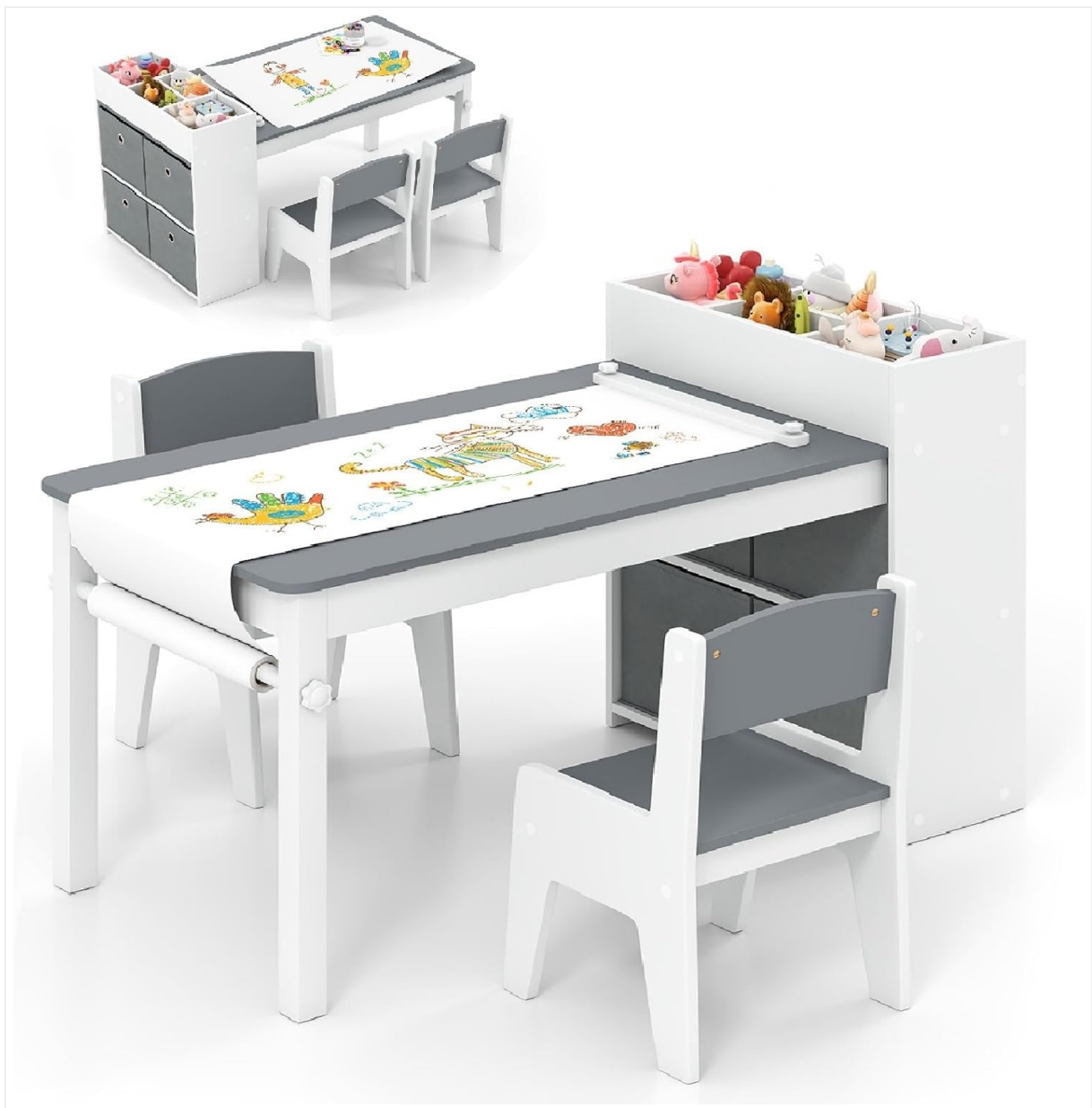
Image: The INFANS Kids Art Table and Chair Set, featuring a grey tabletop, two matching chairs, and an integrated white storage unit with grey canvas bins. A paper roll is visible on the table surface.