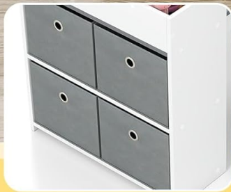
2 Tier Storage Shelf