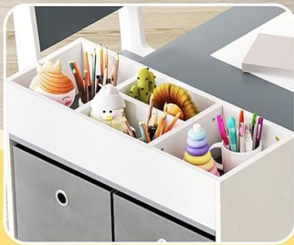
Multiple Storage Basket