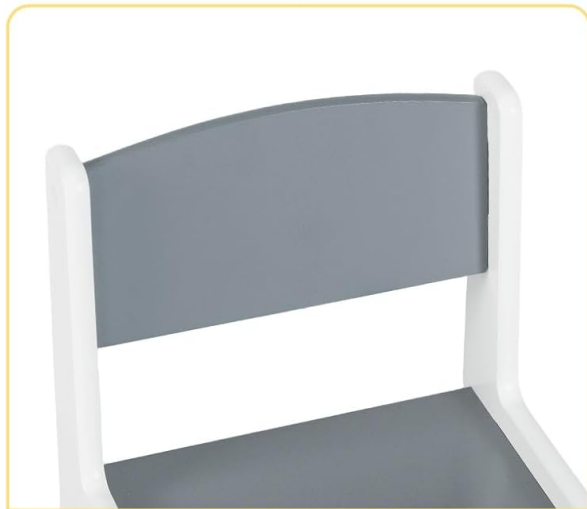
Sturdy Seat Back