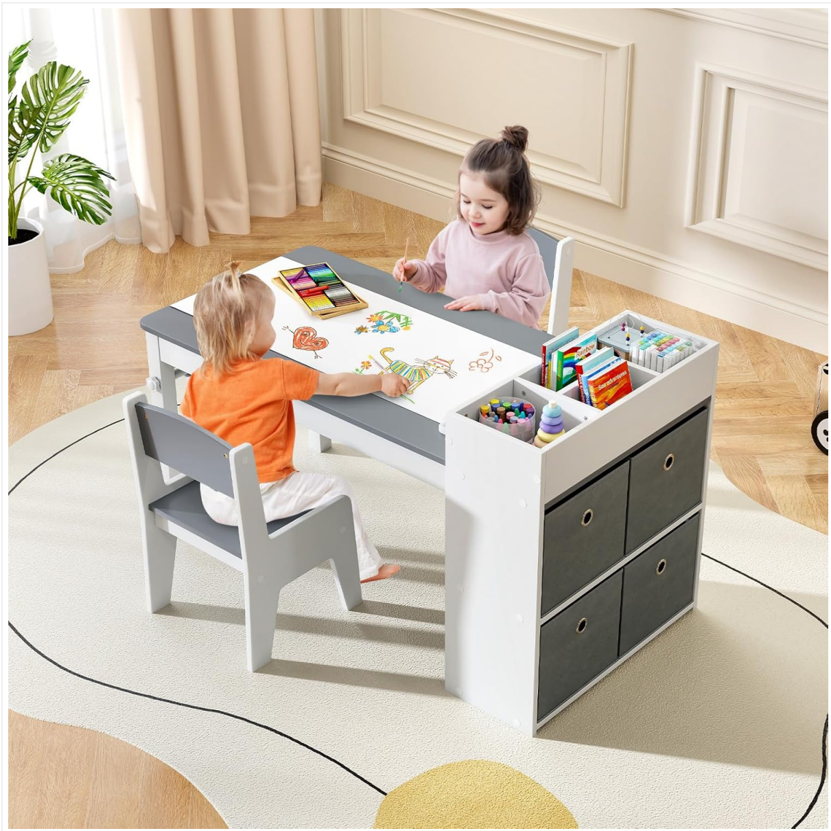
Image: Two young children seated at the art table, actively engaged in drawing on the paper roll, demonstrating the table's use for creative activities.