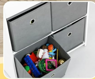
4 Foldable Storage Cloths

Image: A detailed view of the integrated storage unit, showcasing multiple compartments and four grey foldable canvas bins, ideal for organizing art supplies and toys.