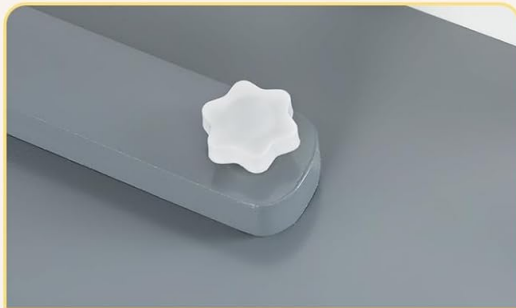
Pressing Rod with Knobs