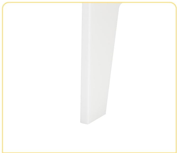
Solid Wood Legs