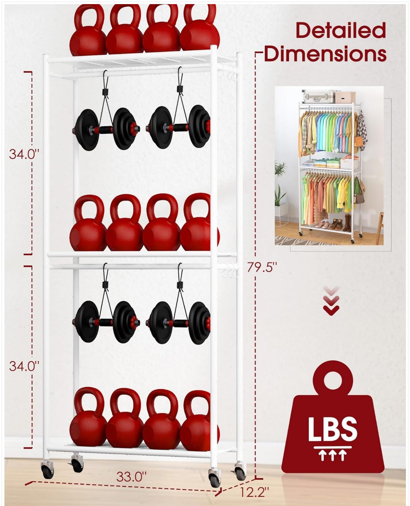
Figure 3: A visual representation of the Sakugi Clothes Rack's dimensions (33.0" W x 12.2" D x 79.5" H) and its robust load capacity, illustrated by heavy items placed on its shelves.