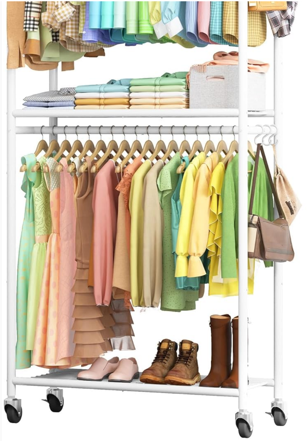
Figure 1: The Sakugi Clothes Rack, showcasing its capacity for hanging garments, folded items on shelves, and shoes at the base. The rack is white and features multiple storage levels.