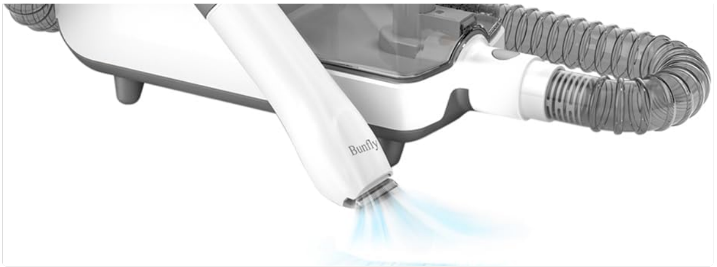
Image 2: Diagram illustrating the Bunfly S1 Replacement Blade being fitted onto a compatible Bunfly vacuum clipper system.

Important Note: This replacement blade is specifically designed for Bunfly S1 compatible clippers. Using it with incompatible models may result in improper fit or malfunction.