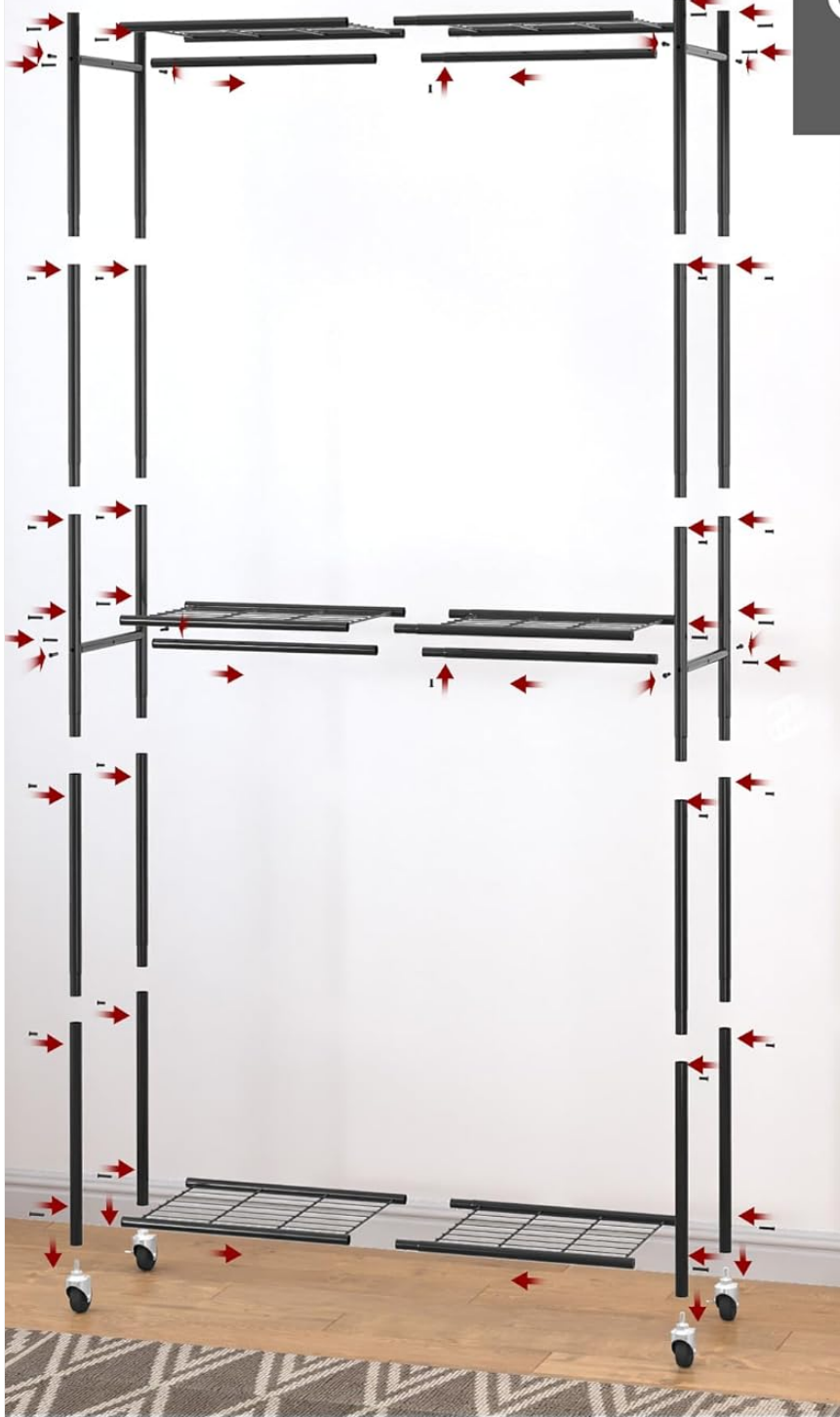
Image: An exploded diagram illustrating the assembly process, showing how each component connects to form the complete clothes rack. Necessary tools are also depicted.

Detailed Instruction Video & User Manual