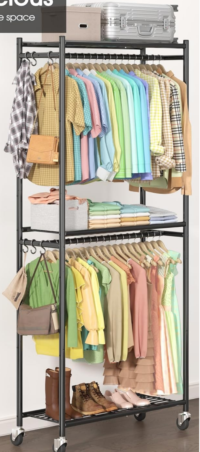
Image: An overview of the rack's versatile storage capabilities, illustrating dedicated areas for various items such as folded clothes, hanging garments, bags, and shoes.