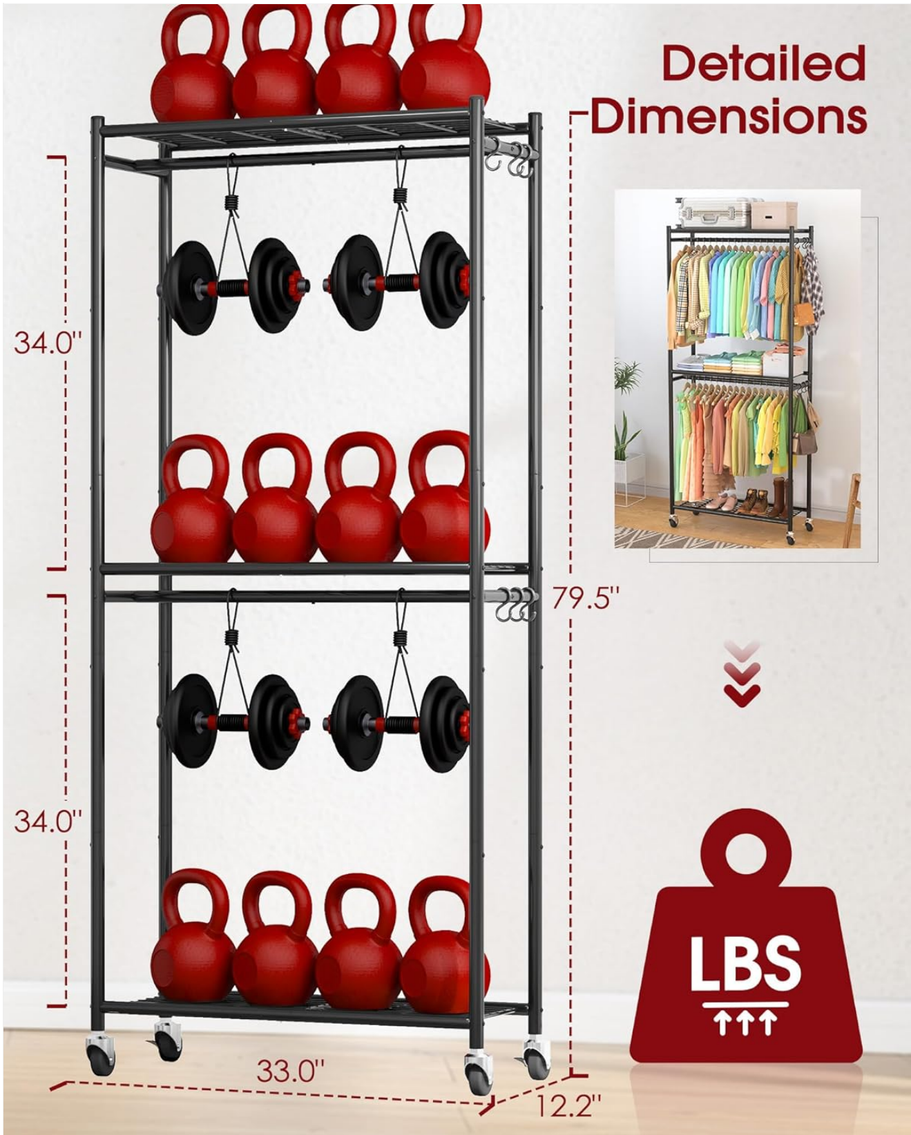
Image: A visual representation of the clothes rack's dimensions (33.0" W x 12.2" D x 79.5" H) and its robust load capacity, illustrated with weights.