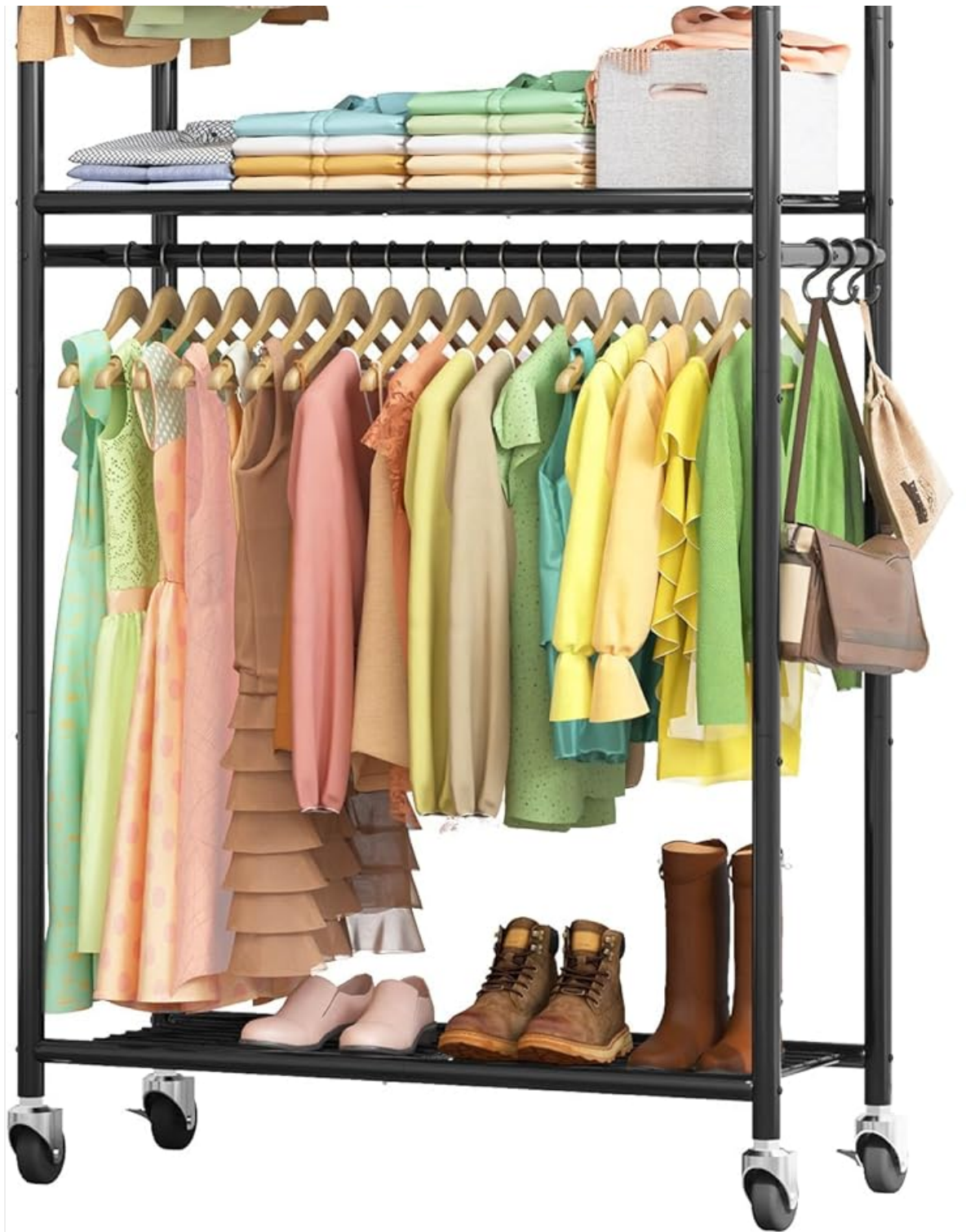
Image: The Sakugi Clothes Rack, fully assembled and organized with clothing, bags, and shoes, demonstrating its storage capacity.