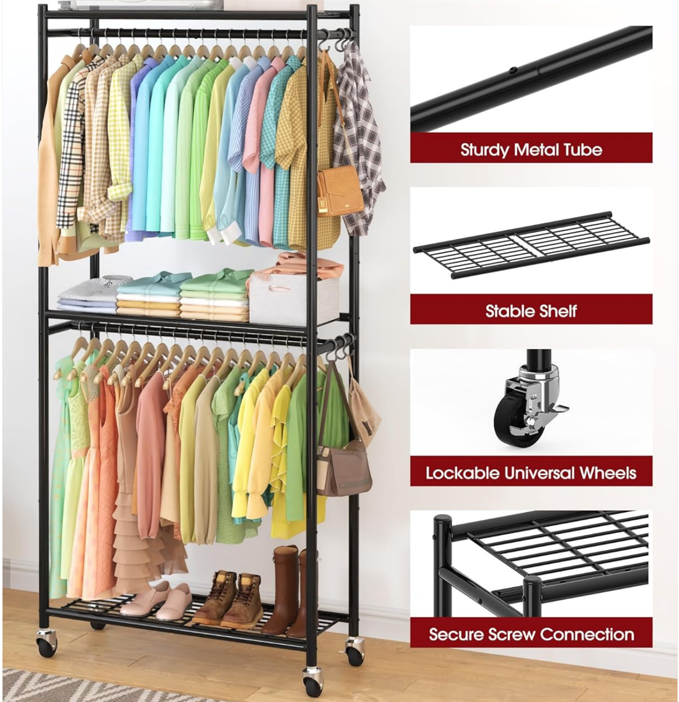
Image: Close-up of the rack's premium construction, detailing the sturdy metal tubes, stable mesh shelves, and secure screw connections that contribute to its durability.