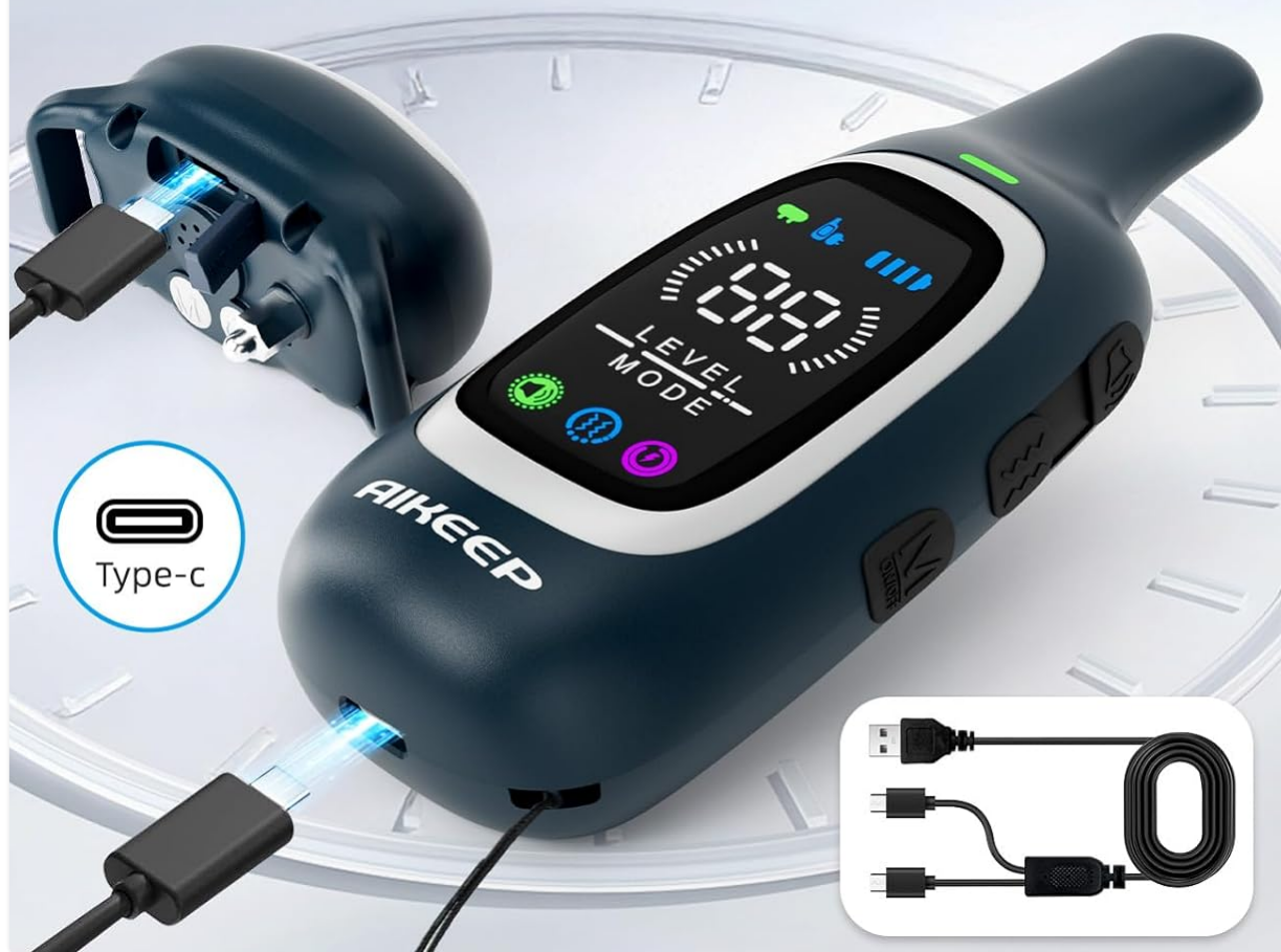
Image: Visual representation of the Type-C fast charging and long battery life for both the remote and receiver.