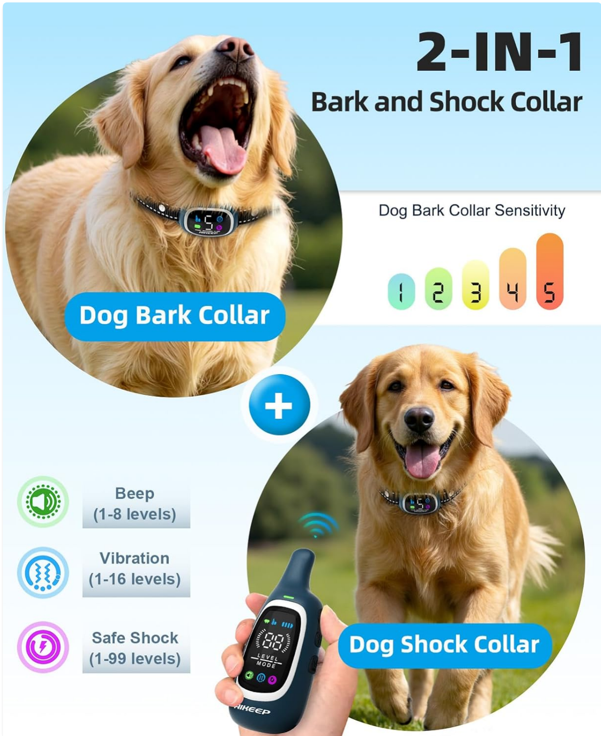
Image: Illustration of the 2-in-1 bark and shock collar functionality with sensitivity levels and mode types.