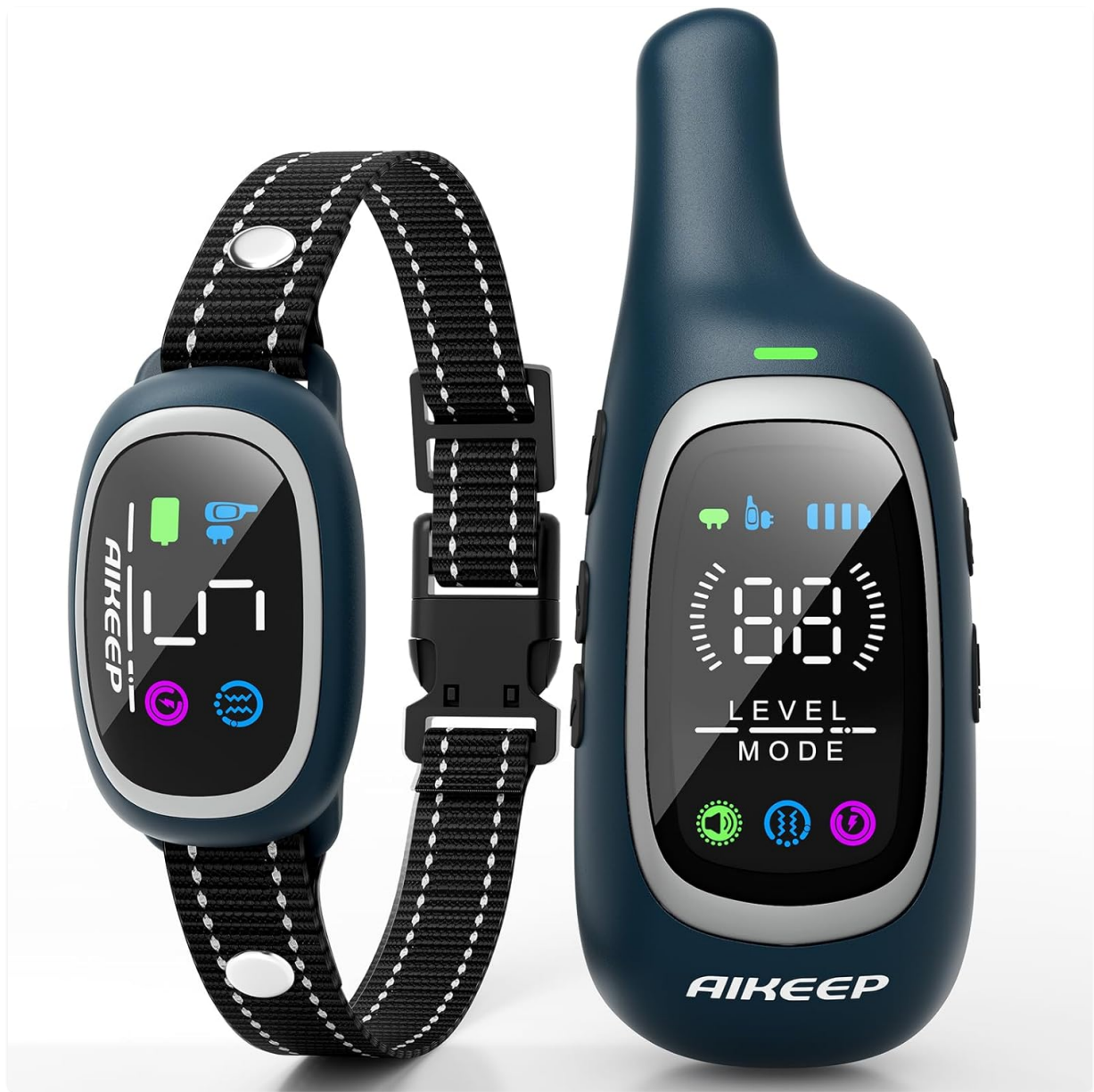
Image: All components included in the AIKEEP 2-in-1 Dog Shock Collar and Bark Collar package.

Your browser does not support the video tag.