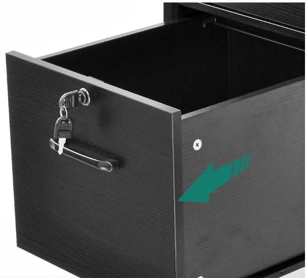
Smooth Sliding Rail