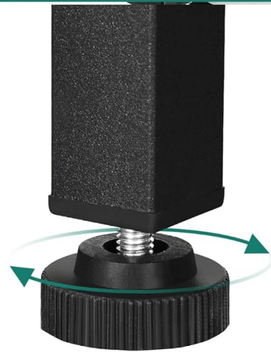
Strong Metal Support Legs

Key features include a lockable drawer, smooth operation, and stable construction.