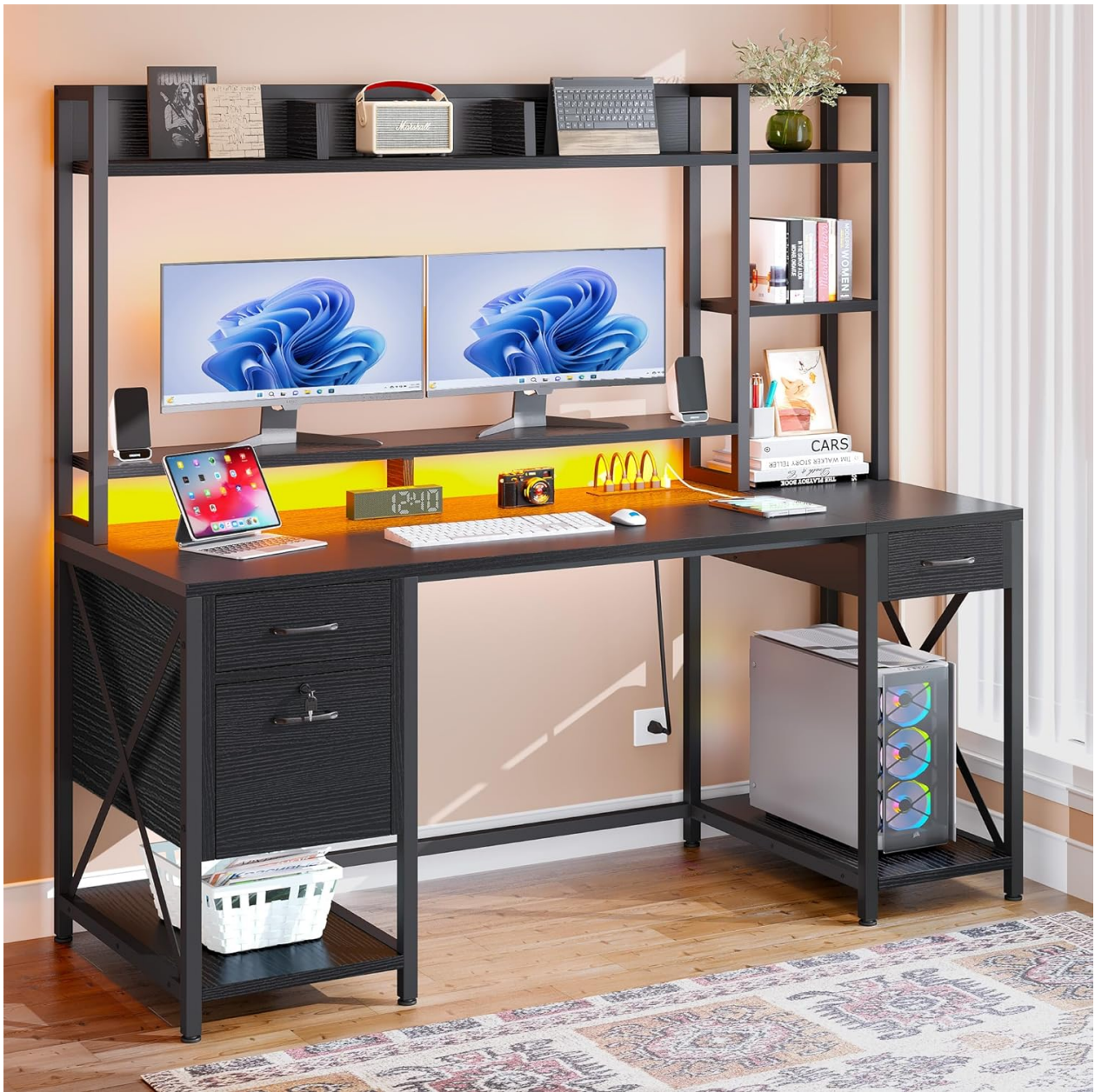
The DWVO Computer Desk, designed for home office and gaming setups.