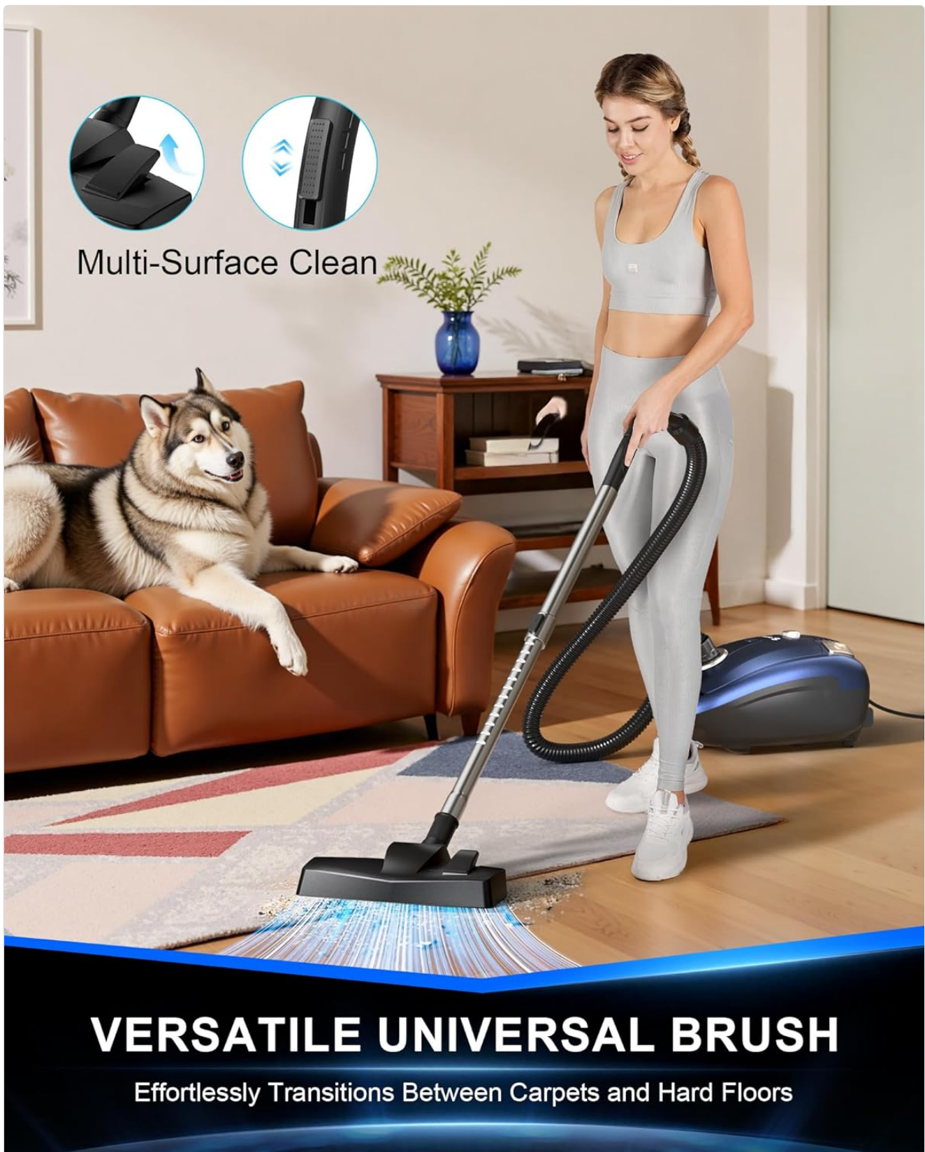
Image: The versatile universal brush of the EYESUN EV-200, designed for effective cleaning on both carpets and hard floors.