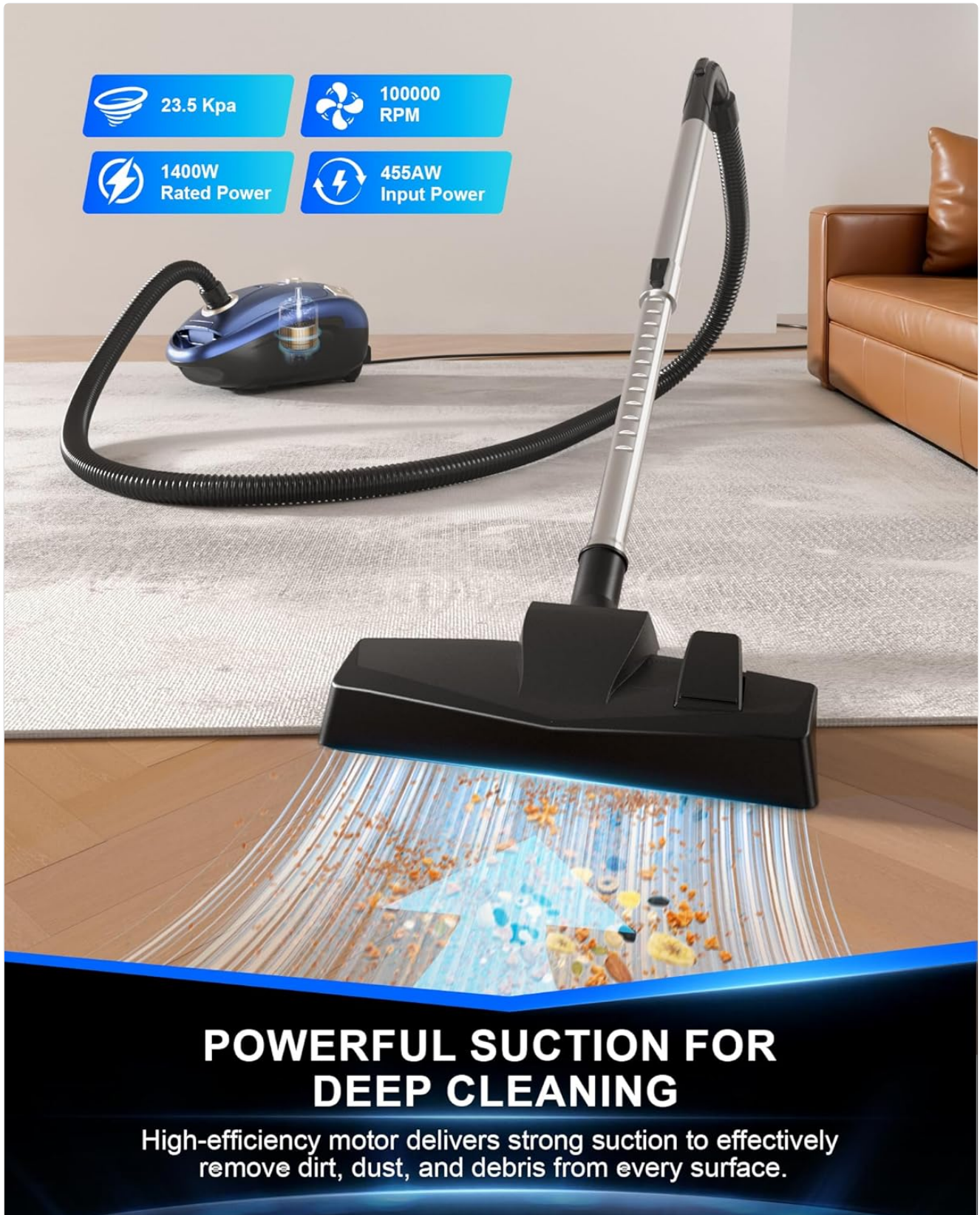
Image: The EYESUN EV-200 in action, showcasing its powerful suction for deep cleaning on various surfaces.