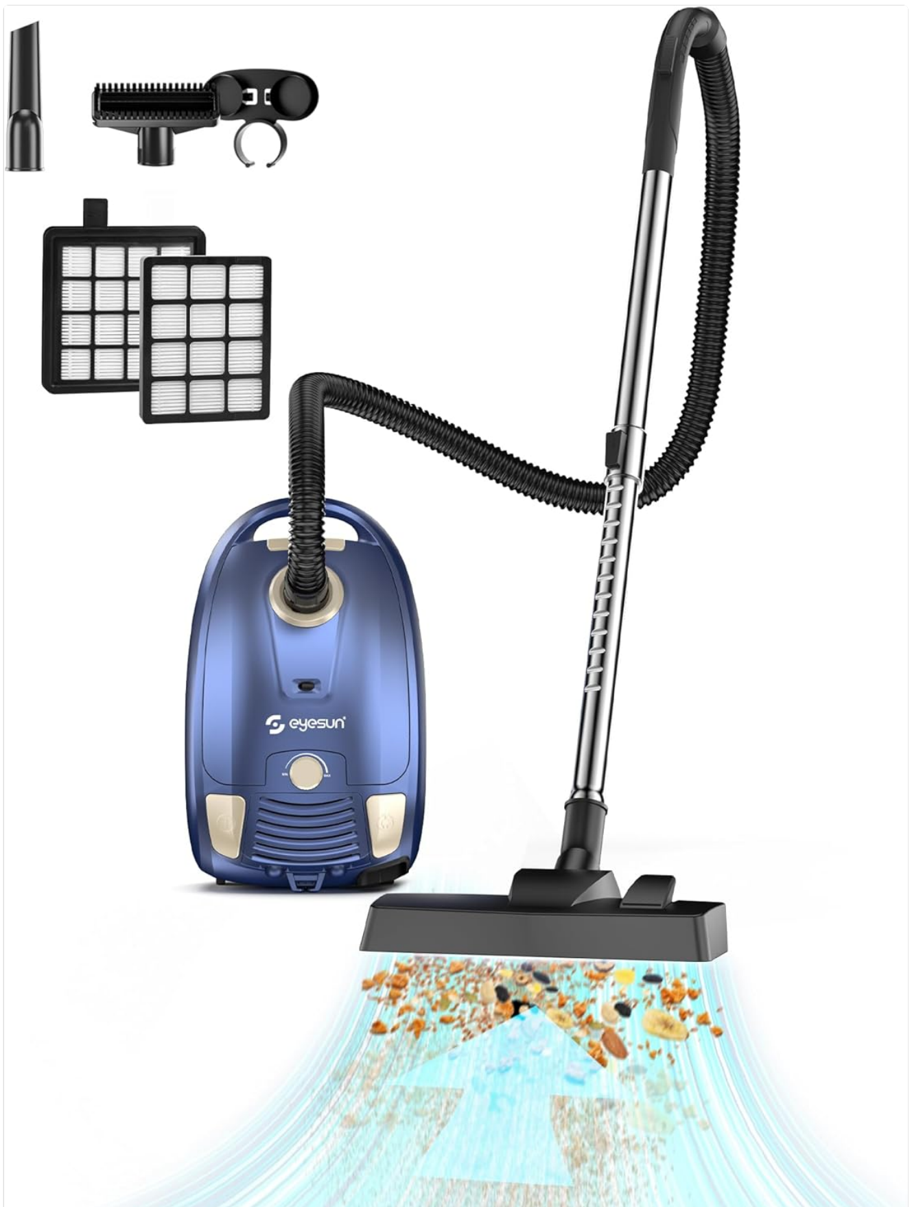
Image: All included accessories for the EYESUN EV-200 vacuum cleaner, including the main unit, hose, telescoping wand, floor brush, crevice tool, sofa nozzle, and filters.