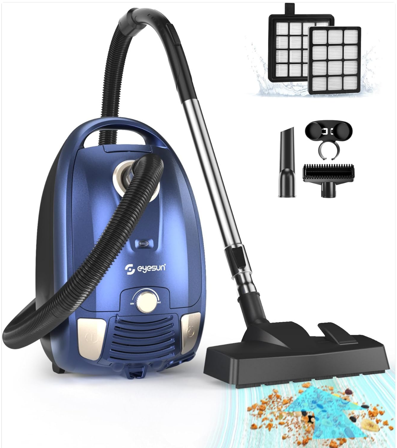
Image: The EYESUN EV-200 Bagged Canister Vacuum Cleaner fully assembled, ready for use.