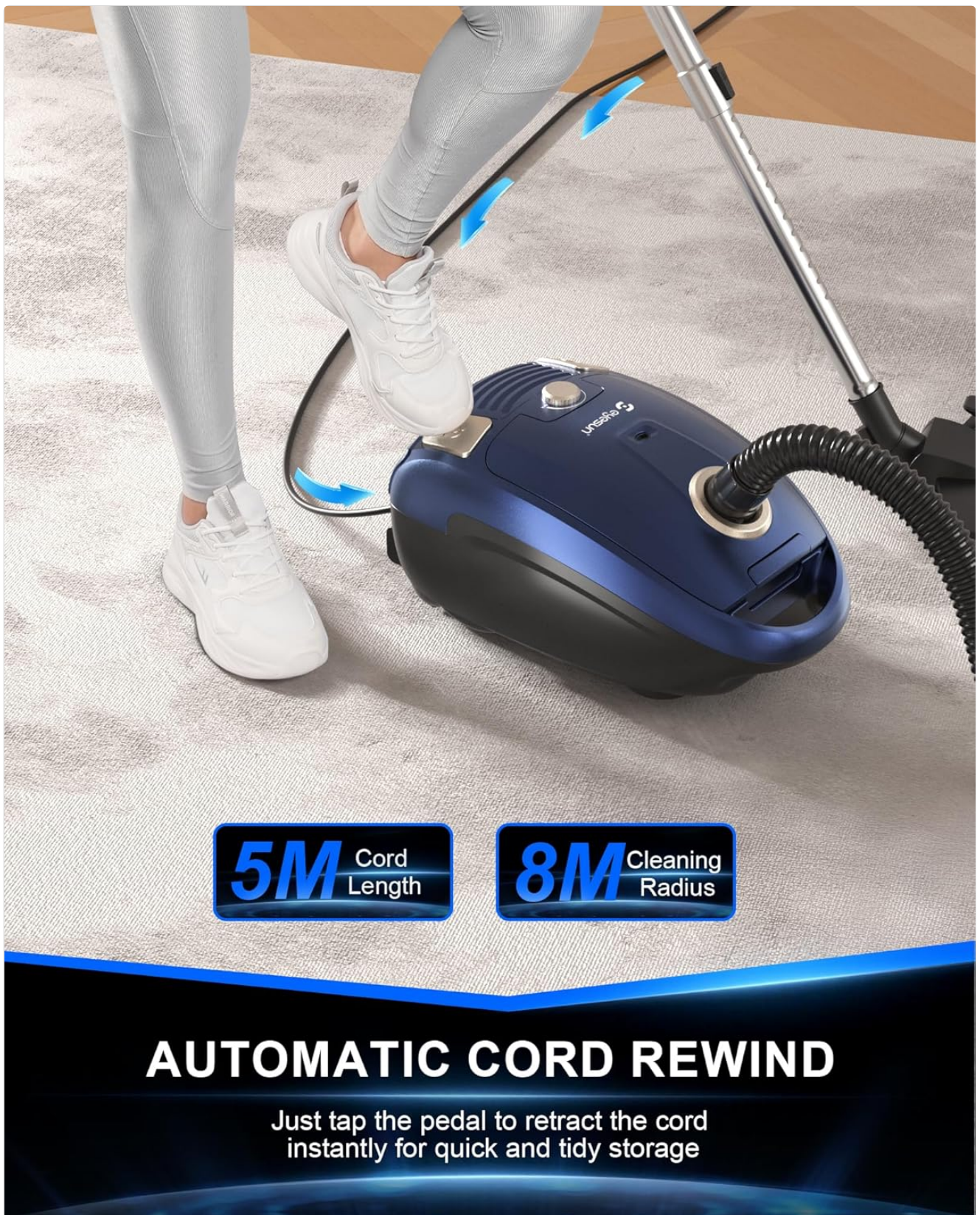
Image: Automatic cord rewind feature for quick and tidy storage.