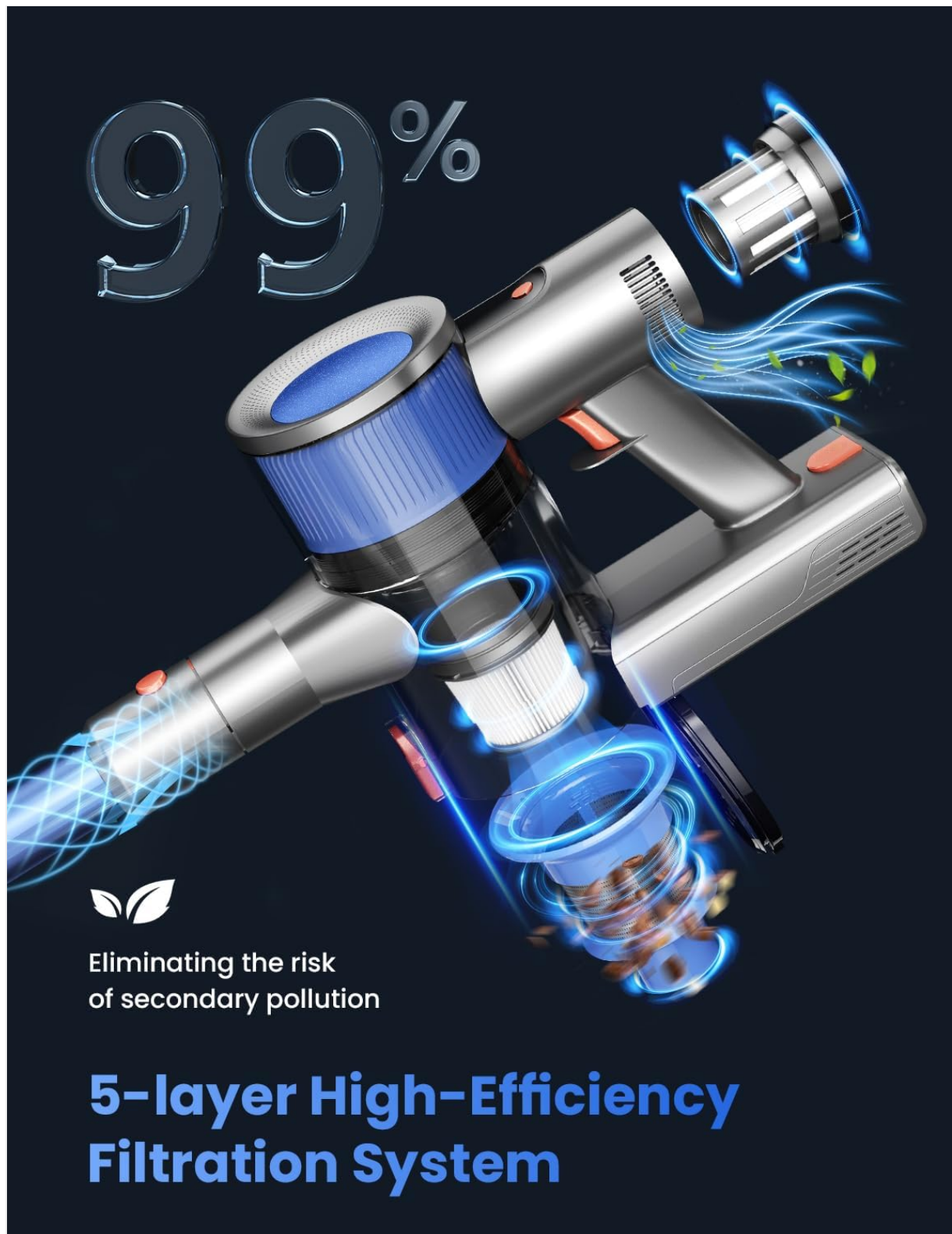
Image: Exploded view of the vacuum's multi-layer filtration system.