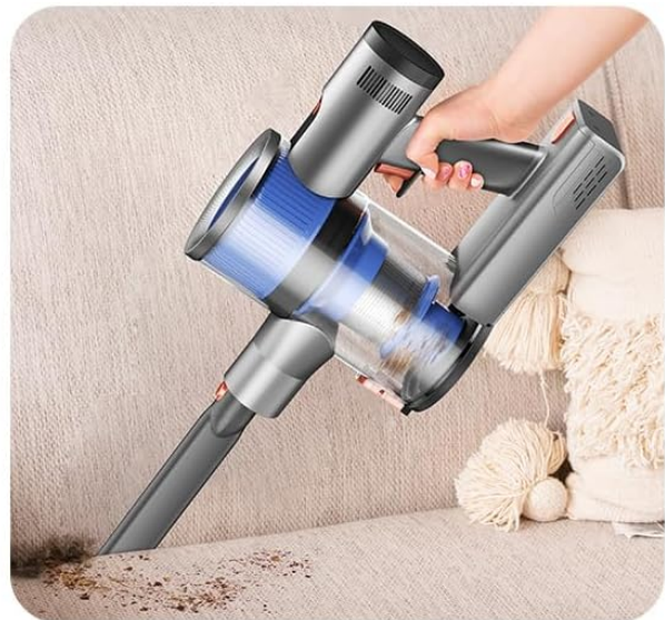
Image: Examples of using the vacuum in handheld configuration for various cleaning tasks.