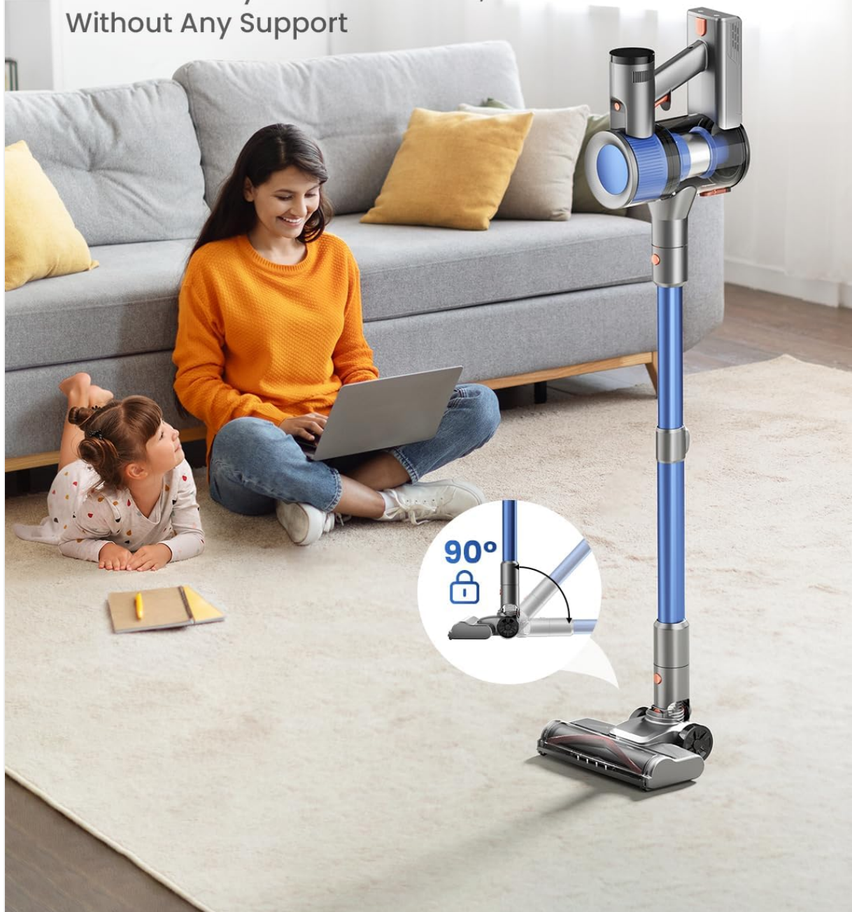
Image: The vacuum standing independently, showcasing its self-standing capability.

Can Put It Anywhere You Want, Without Any Support