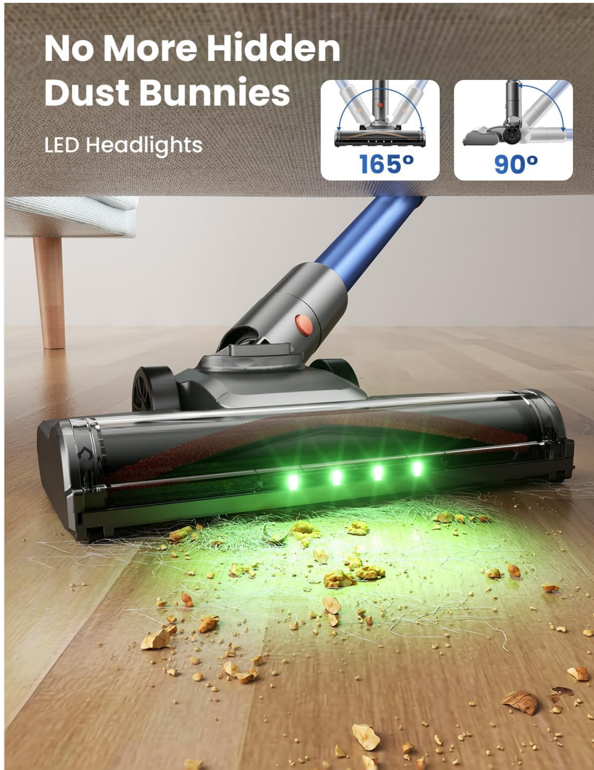
Image: The vacuum's LED headlights revealing hidden dust on a floor.

The motorized cleaner brush is equipped with green LED headlights that illuminate dust and debris in dark areas, such as under furniture or along baseboards, ensuring thorough cleaning.