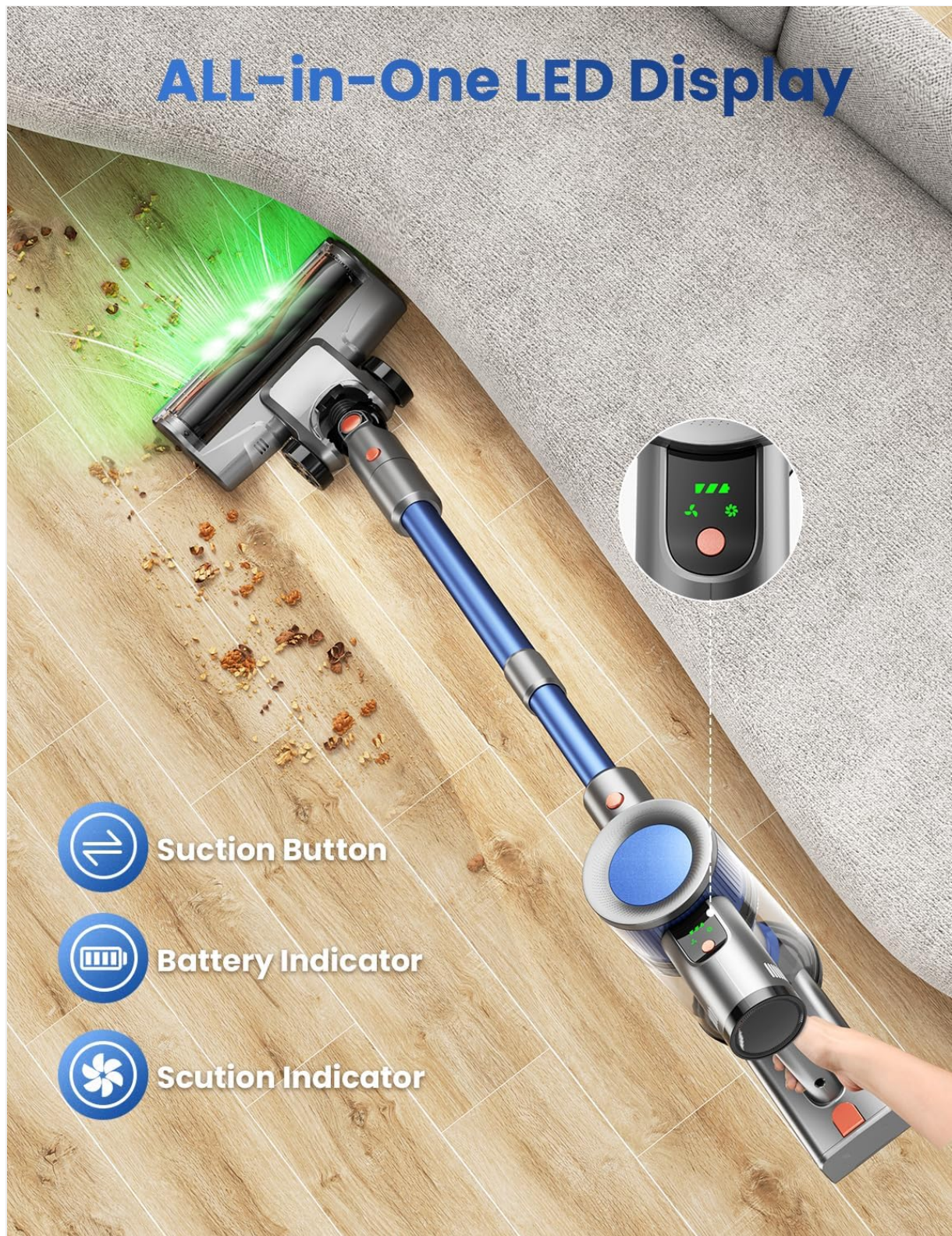
Image: The Smart LED Display providing real-time information on battery level and selected suction mode.