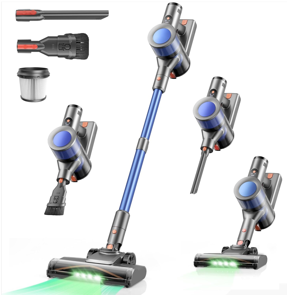
Image: The DZAKI S2 Cordless Vacuum Cleaner shown with its main body, extension tube, motorized floor brush, crevice tool, and 2-in-1 brush attachment.