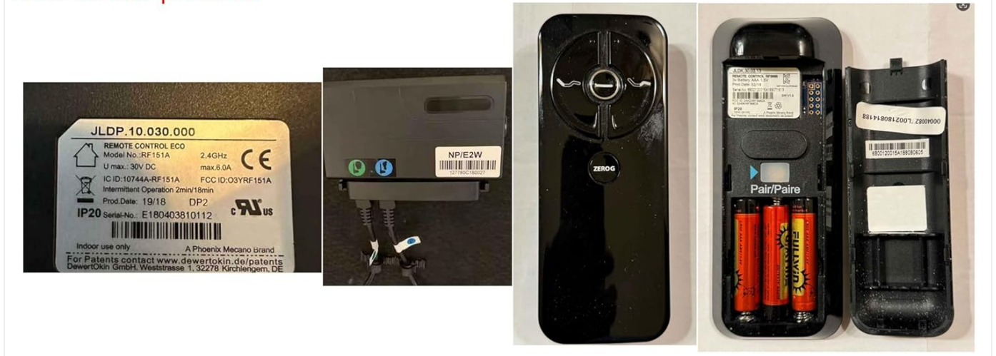
Image 2: This image illustrates the importance of compatibility, showing examples of control box labels and the interior of a remote's battery compartment where model numbers are typically located. It emphasizes the need to match your specific control box and old remote to ensure proper functionality with the replacement.

Remote is Not Universal, Before placing your order, please send some clear pictures of your control box and old remote (front & back) in order to match the Right remote for your bed, refer to our pictures