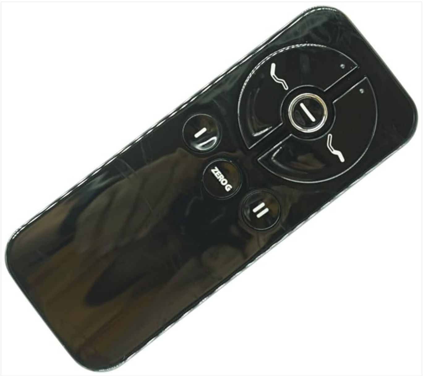
Image 1: Front view of the replacement remote control. This image displays the sleek black remote with clearly visible buttons for bed adjustments, including head and foot articulation, and a 'ZERO G' button for a zero-gravity preset.