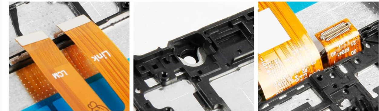
Figure 1: Product compatibility details and specifications.