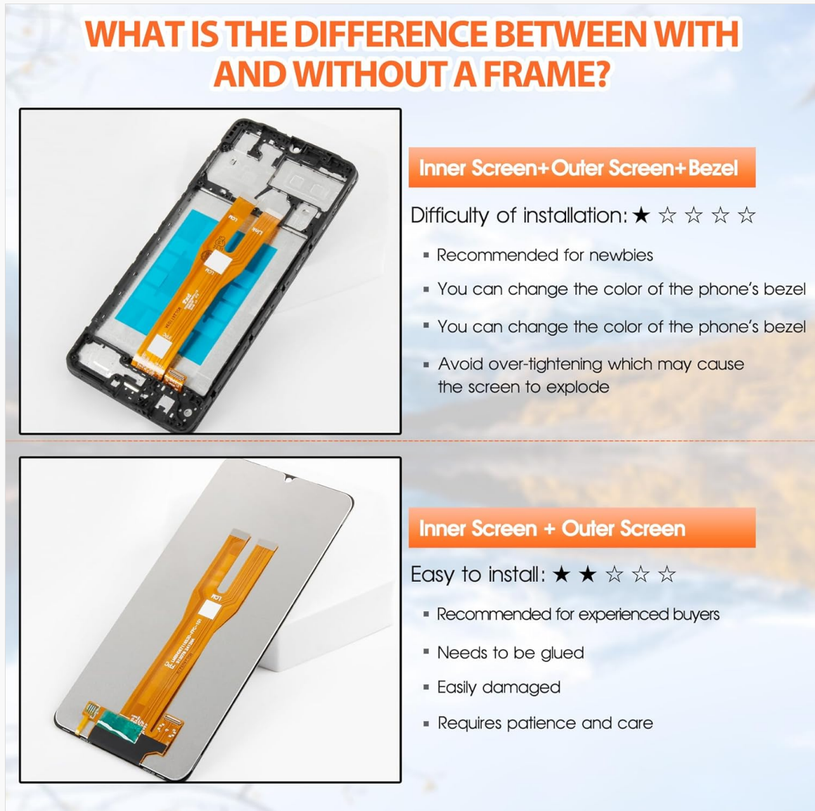
Figure 3: Comparison of screen replacement types and their installation considerations.