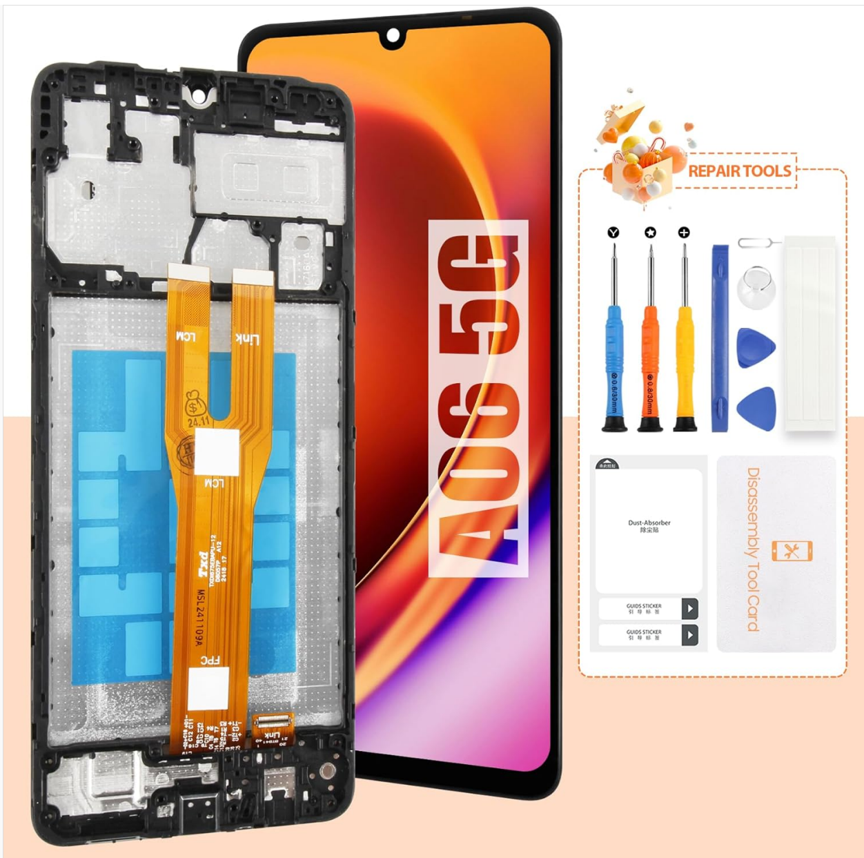
Figure 2: Contents of the package, including the screen assembly and repair tools.