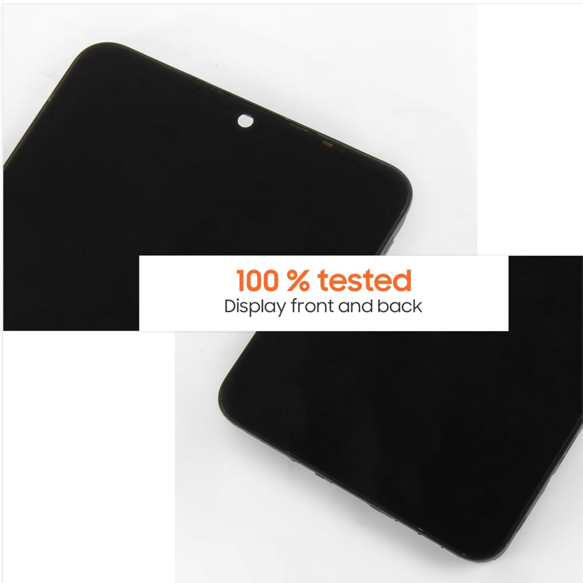
Figure 5: Example of a screen undergoing testing for functionality.