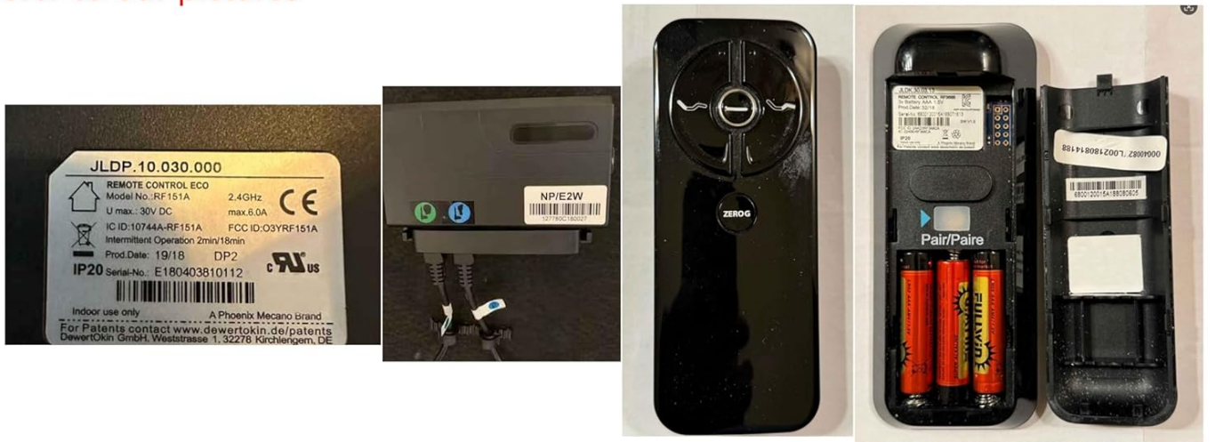
Image: A composite image showing important tips for compatibility. It displays examples of control box labels with model numbers (e.g., JLDP.10.030.000) and images of the front and back of a remote control, including the battery compartment with batteries inserted, to help users identify their existing components.

Remote is Not Universal, Before placing your order, please send some clear pictures of your control box and old remote (front & back) in order to match the Right remote for your bed, refer to our pictures