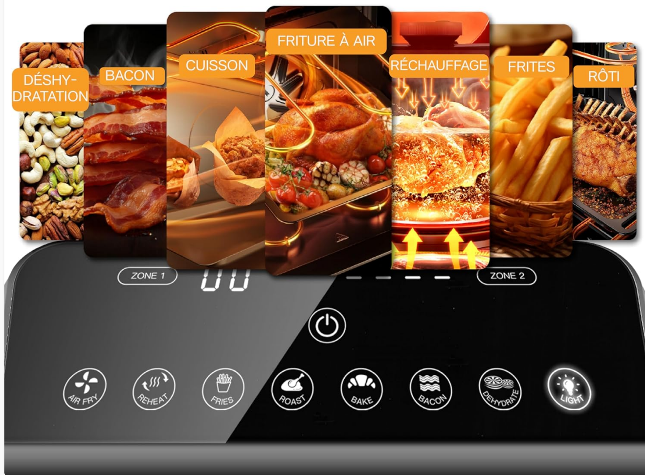
Figure 2.2: Detailed view of the control panel, showing various preset icons and function buttons.

Panneau de commande clair pour faciliter la cuisson