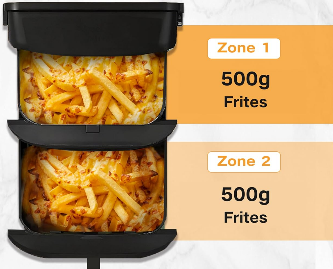
Figure 4.2: MATCH COOK function example, cooking fries in both Zone 1 and Zone 2 with identical settings.

Cuisson simultanée de deux portions des mêmes ingrédients.