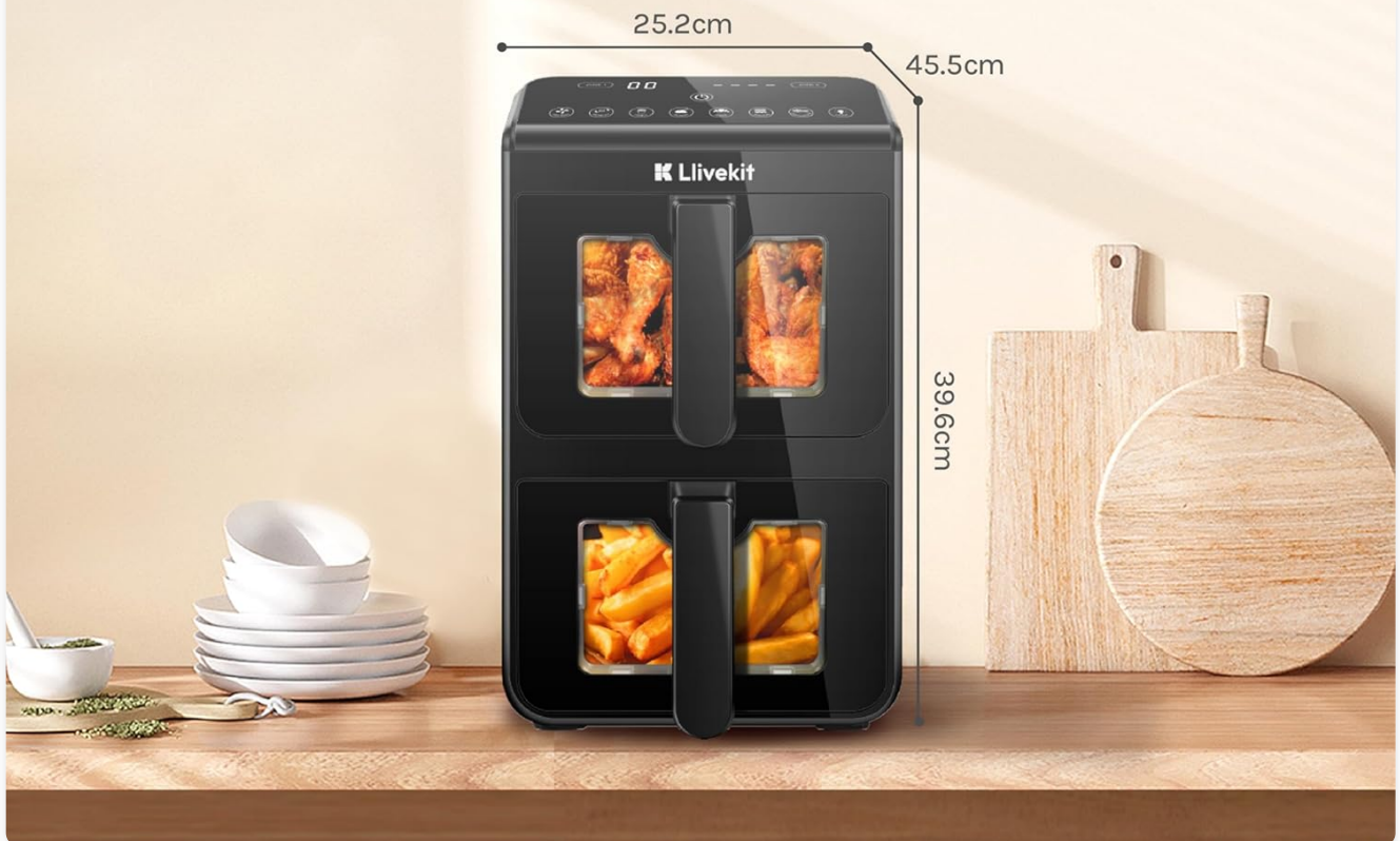
Figure 7.1: Dimensions of the LLIVEKIT 10L Dual Compartment Air Fryer.

Économiser 30% d'espace Profiter de capacité doublée