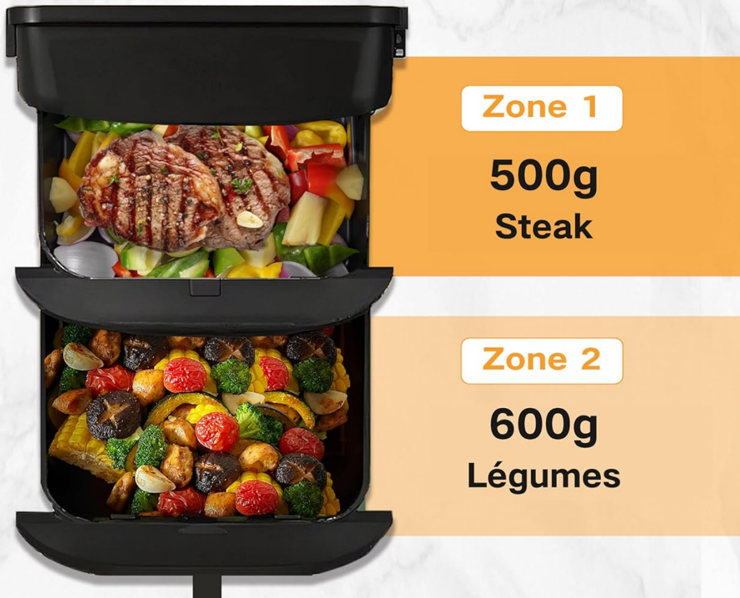
Figure 4.1: SMART FINISH function example, cooking steak in Zone 1 and vegetables in Zone 2, finishing together.

Le plaisir synchronisé de deux aliments différents