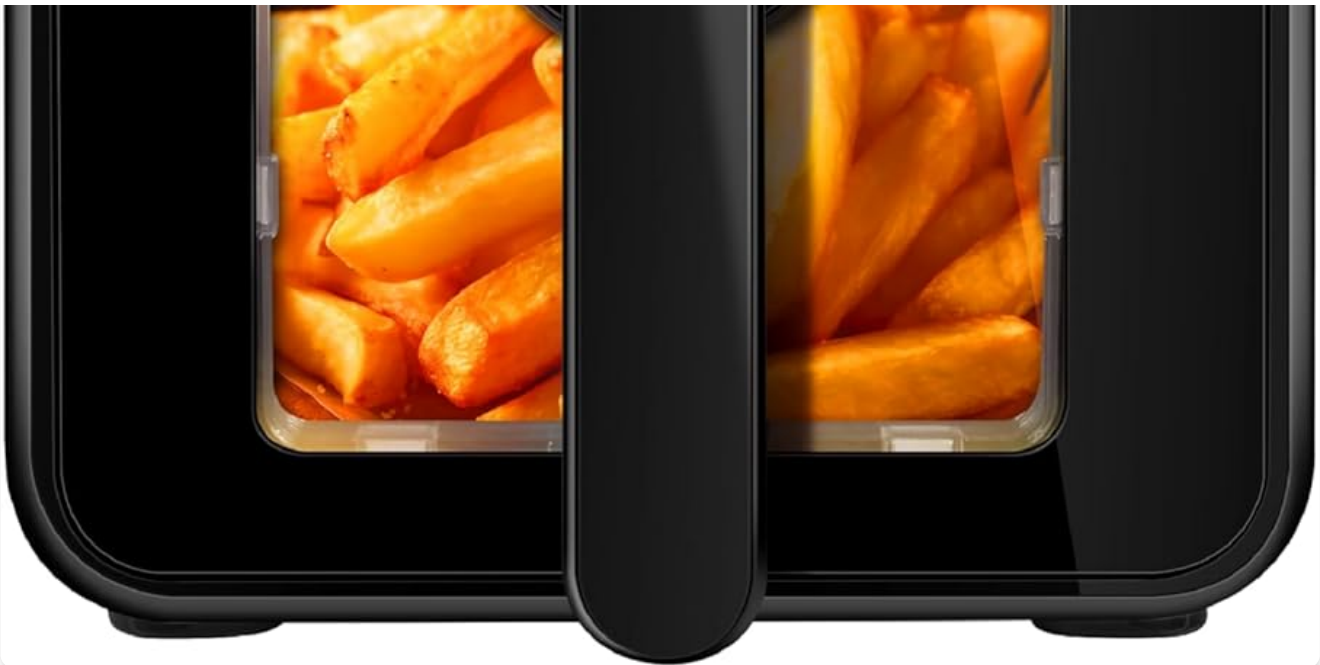
Figure 2.1: Front view of the LLIVEKIT 10L Dual Compartment Air Fryer with food visible in both baskets.