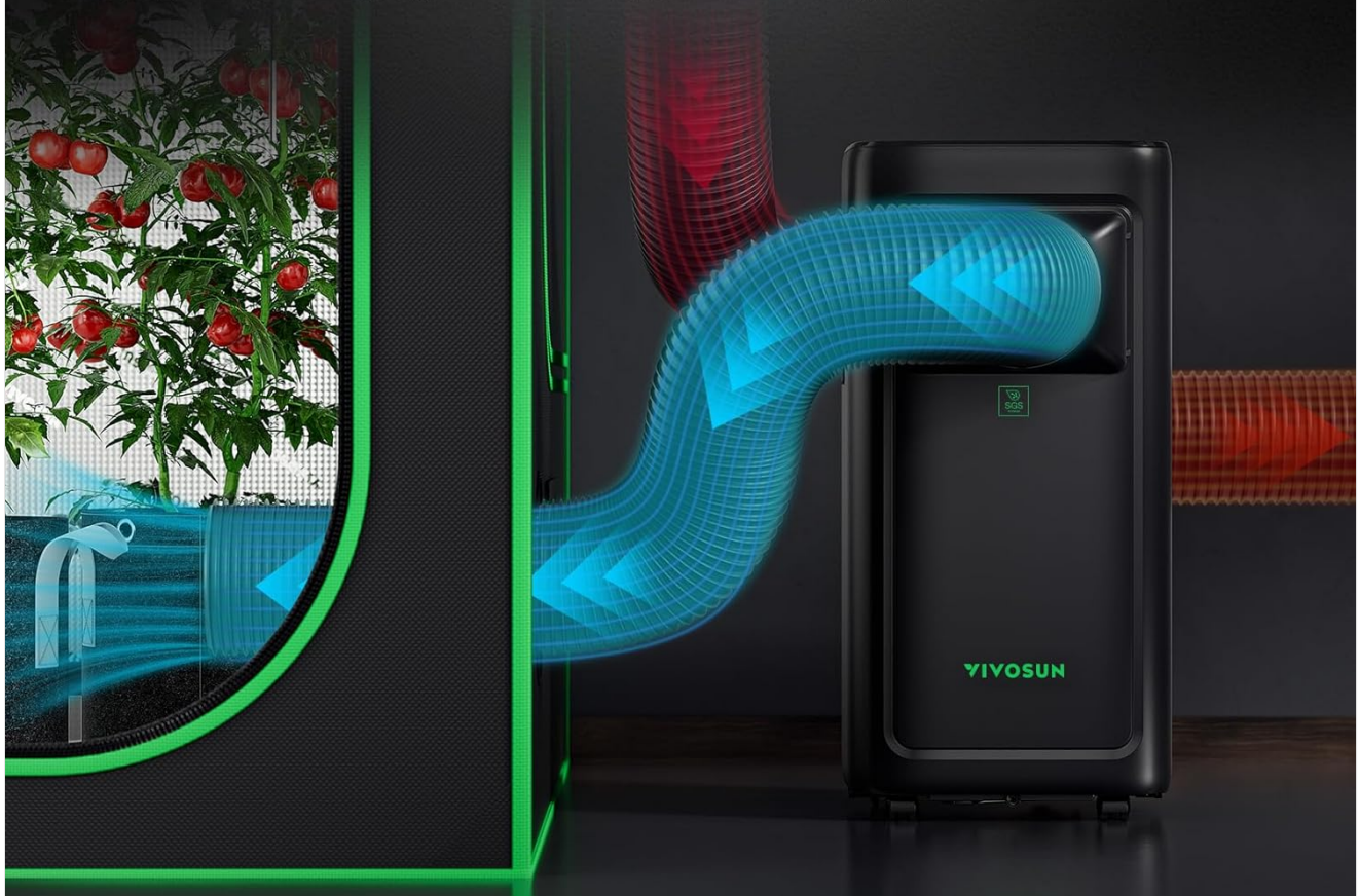
Figure 4: 4-in-1 Climate Control. This image visually represents the four operational modes: Cool, Heat, Dry, and Fan.