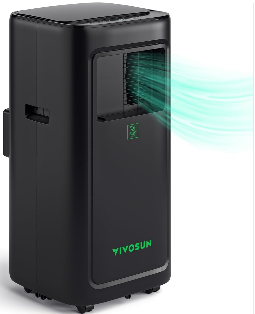
Figure 1: VIVOSUN AeroLush C08 Smart Air Conditioner. This image shows the sleek black design of the portable air conditioner with air visibly flowing from its vent.