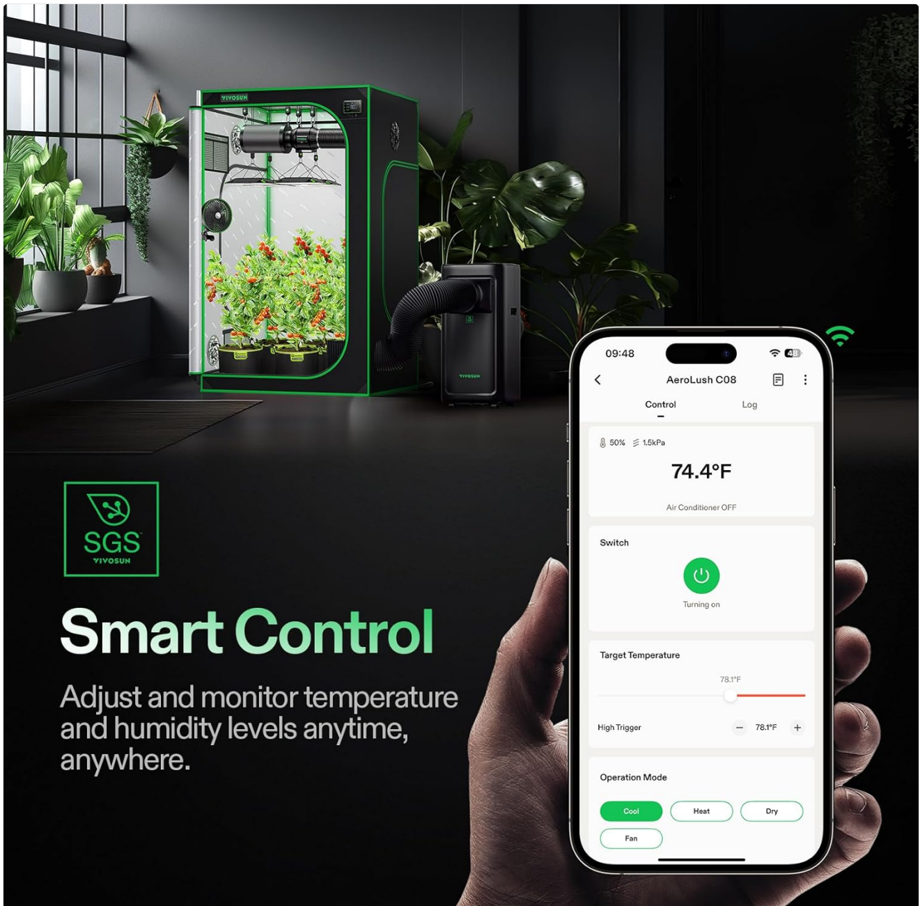
Figure 5: Smart Control via VIVOSUN App. This image shows a hand holding a smartphone displaying the VIVOSUN app, which allows users