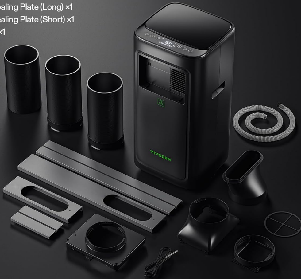
Figure 2: Package Contents. This image displays the main air conditioner unit along with all included accessories such as ducts, adapters, and the temperature/humidity probe.

Air Conditioner x1 Evaporator Air Inlet Hood x1 Evaporator Air Inlet Hood x1 Temperature & Humidity Probe x1 2M Exhaust Duct (with adapter) x2 2M Exhaust Duct x1 Filter x1 Condenser Outlet Adapter x1 Window Duct Adapter x1 Window Sealing Plate (Long) x1 Window Sealing Plate (Short) x1 Drain Pipe x1