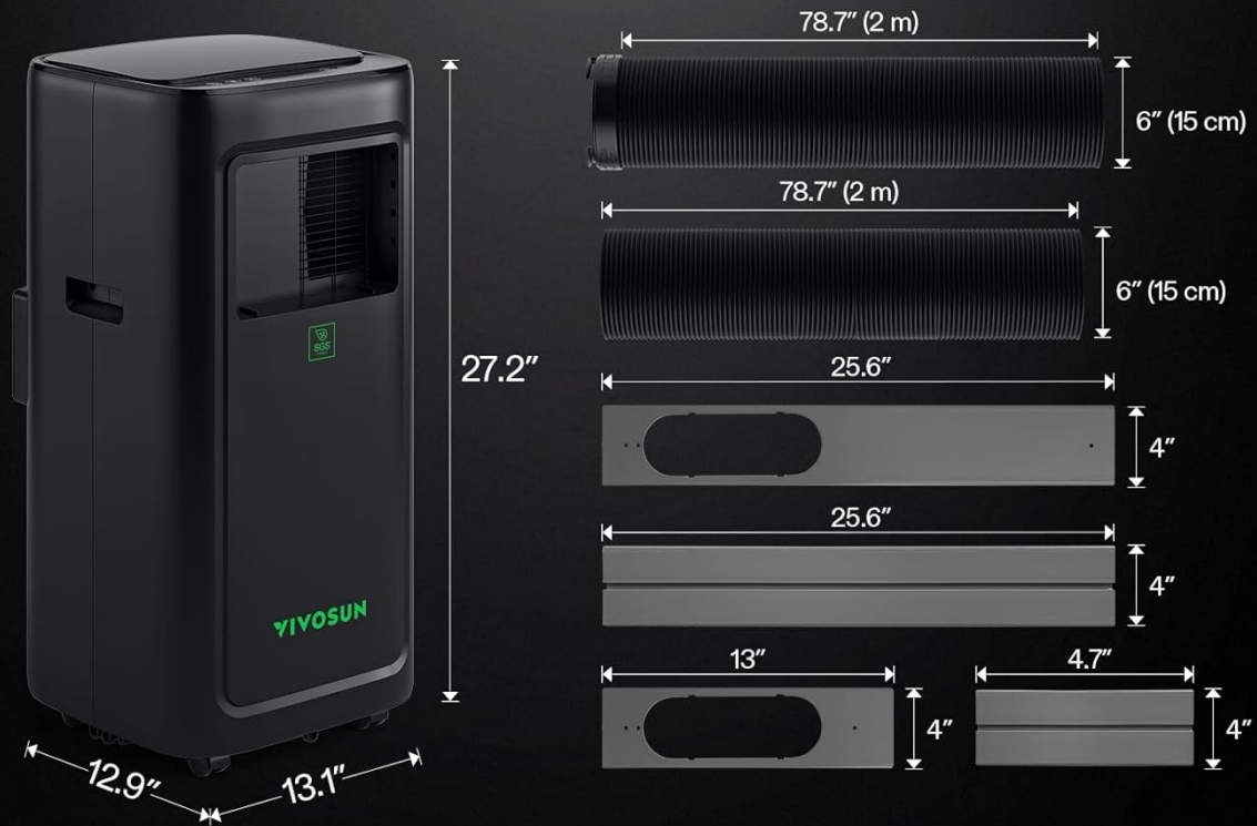
Figure 6: Product Specifications. This image provides a visual summary of the key technical specifications and dimensions of the AeroLush C08 unit.