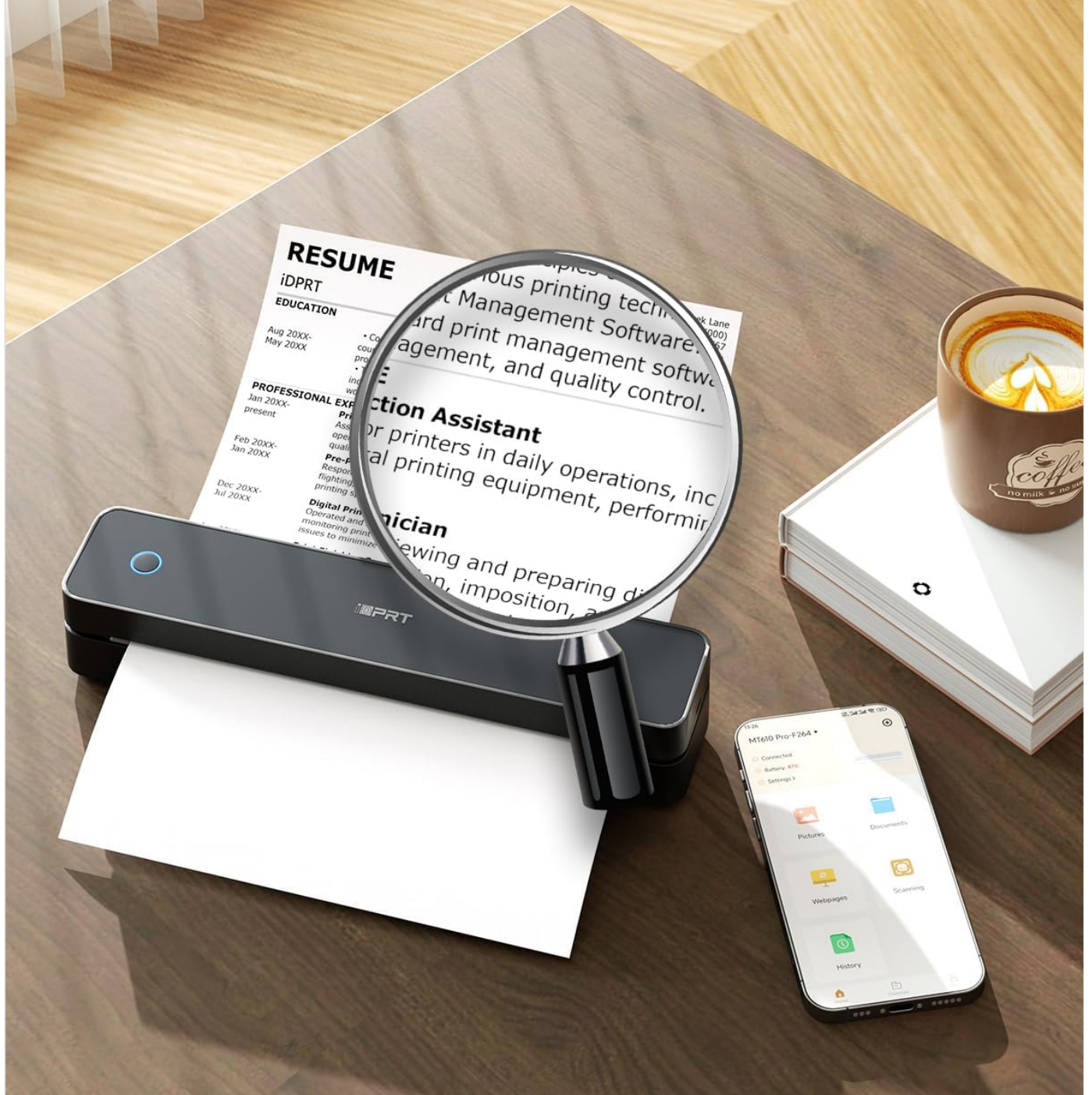
Image: The iDPRT MT610 Pro Portable Thermal Printer.

Every detail is clear, Long-term preservation without blur