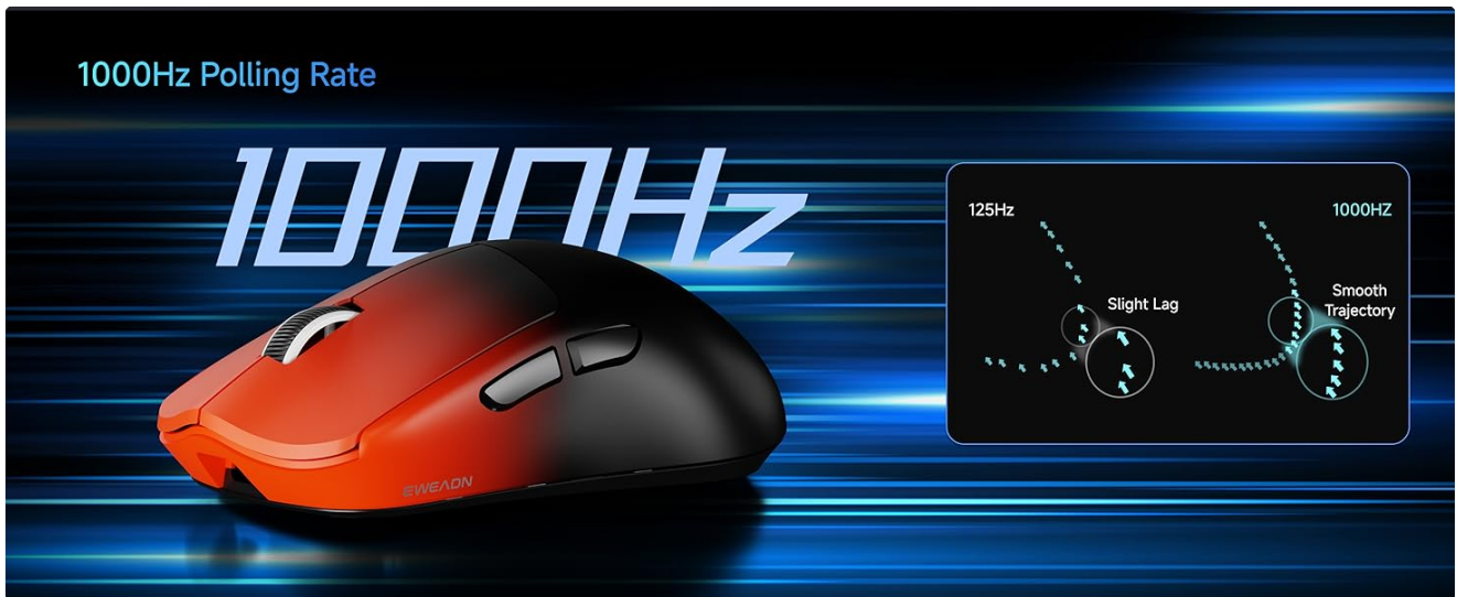
Illustration demonstrating the benefit of the X23Pro's 1000Hz polling rate, ensuring smooth and responsive tracking.