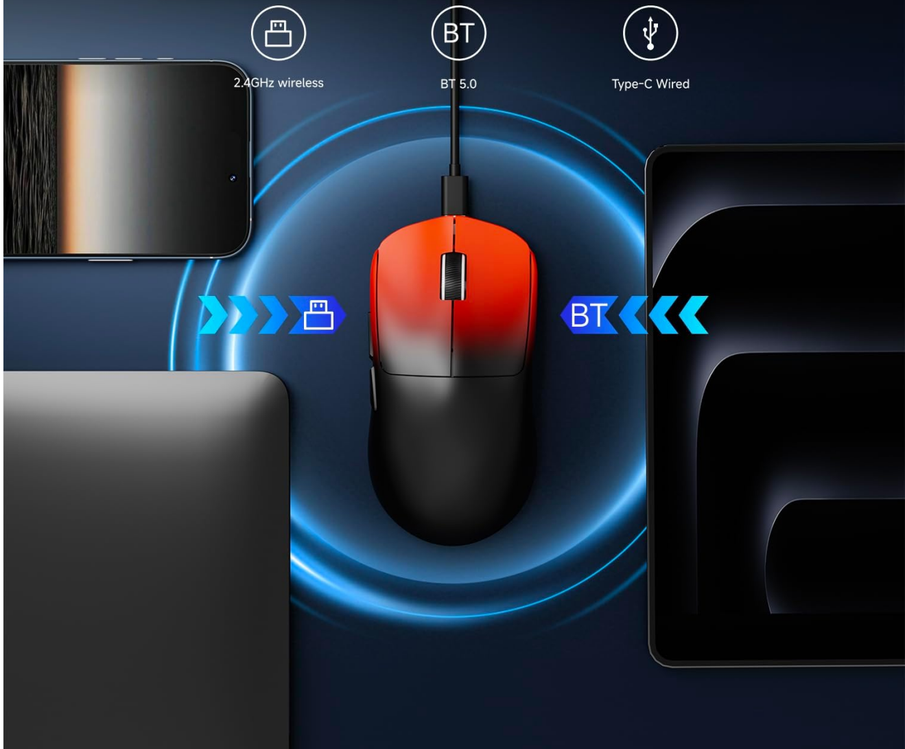
Diagram illustrating the three connection modes of the X23Pro mouse: 2.4GHz wireless, Bluetooth 5.0, and wired USB-C, enabling versatile use across multiple devices.