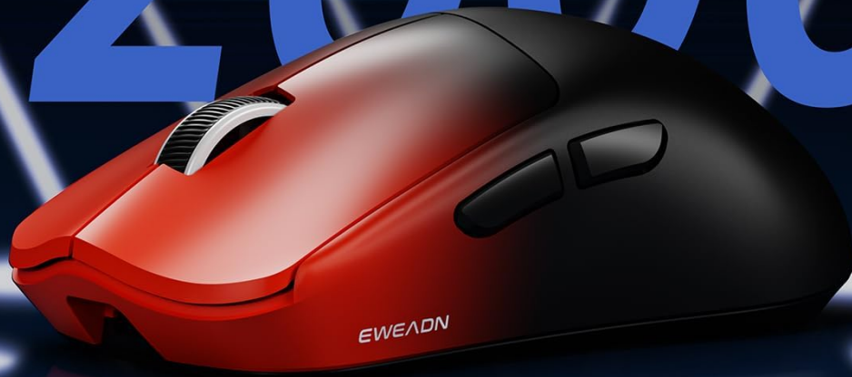
Illustration showing the EWEADN X23Pro mouse and its capability for up to 12,000 DPI, allowing for precise cursor control.