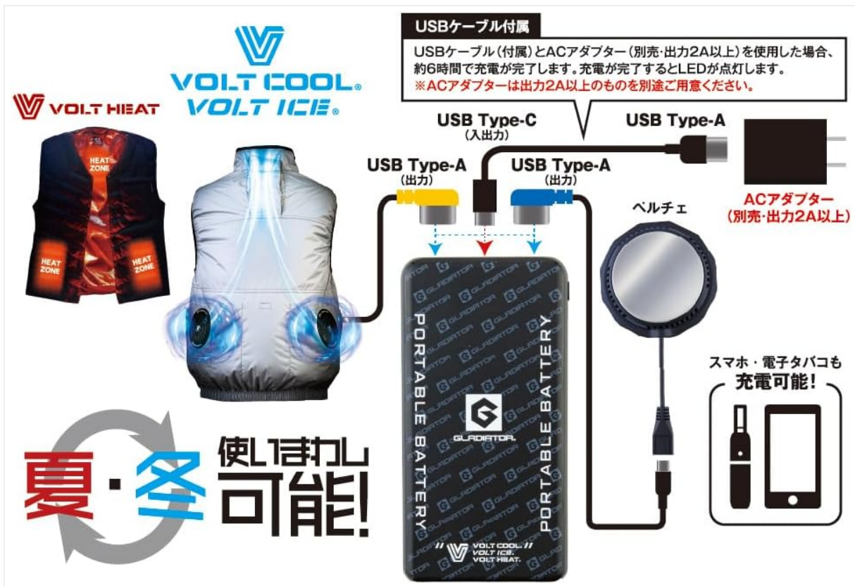
Figure 6: Diagram illustrating the GLADIATOR GB-852 Mobile Battery connected to a VOLT COOL fan-equipped vest and a VOLT HEAT heated vest, demonstrating its versatility for both summer and winter products. It also shows connections for charging a smartphone/e-cigarette and a Peltier device.