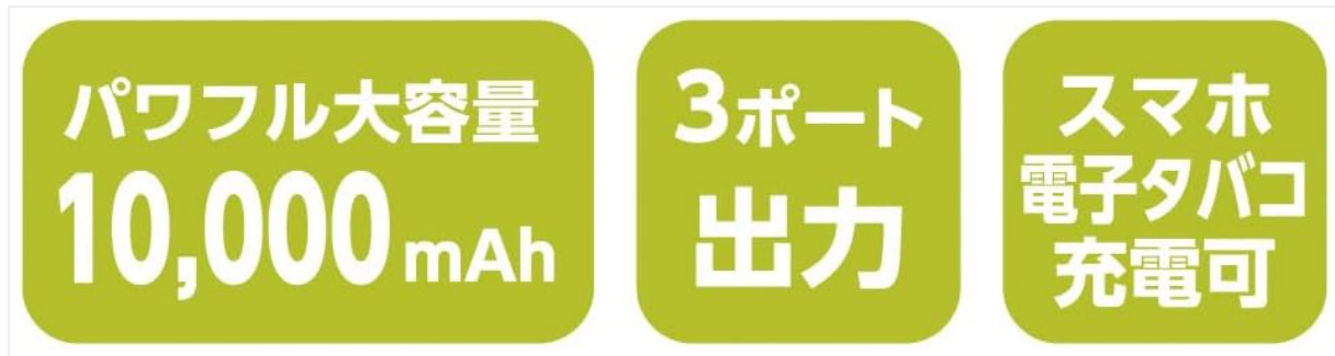
Figure 3: Visual representation of key features: Powerful 10,000mAh capacity, 3 output ports, and compatibility for charging smartphones and electronic cigarettes.