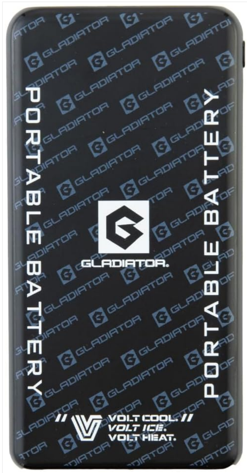
Figure 1: Front view of the GLADIATOR GB-852 Mobile Battery, showcasing its sleek black design with the GLADIATOR logo and "PORTABLE BATTERY" text.