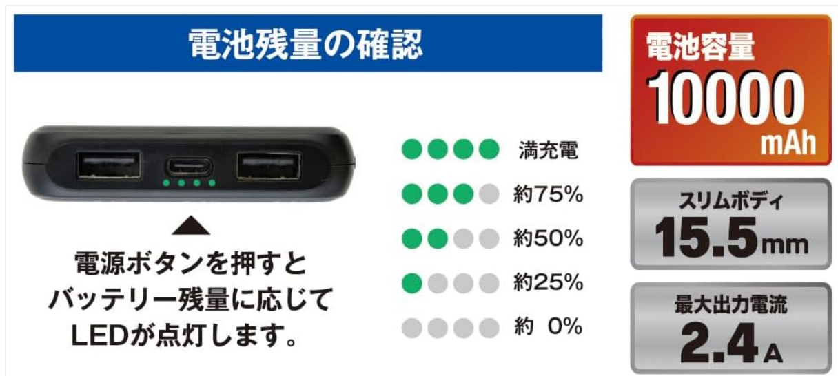
Figure 5: Illustration of the battery level check feature, showing the LED indicators and their corresponding charge percentages (e.g., 4 green dots for full charge).