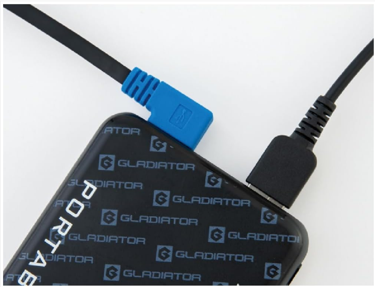
Figure 4: The GLADIATOR GB-852 Mobile Battery with a blue USB-C cable connected to its input port, illustrating the charging setup.