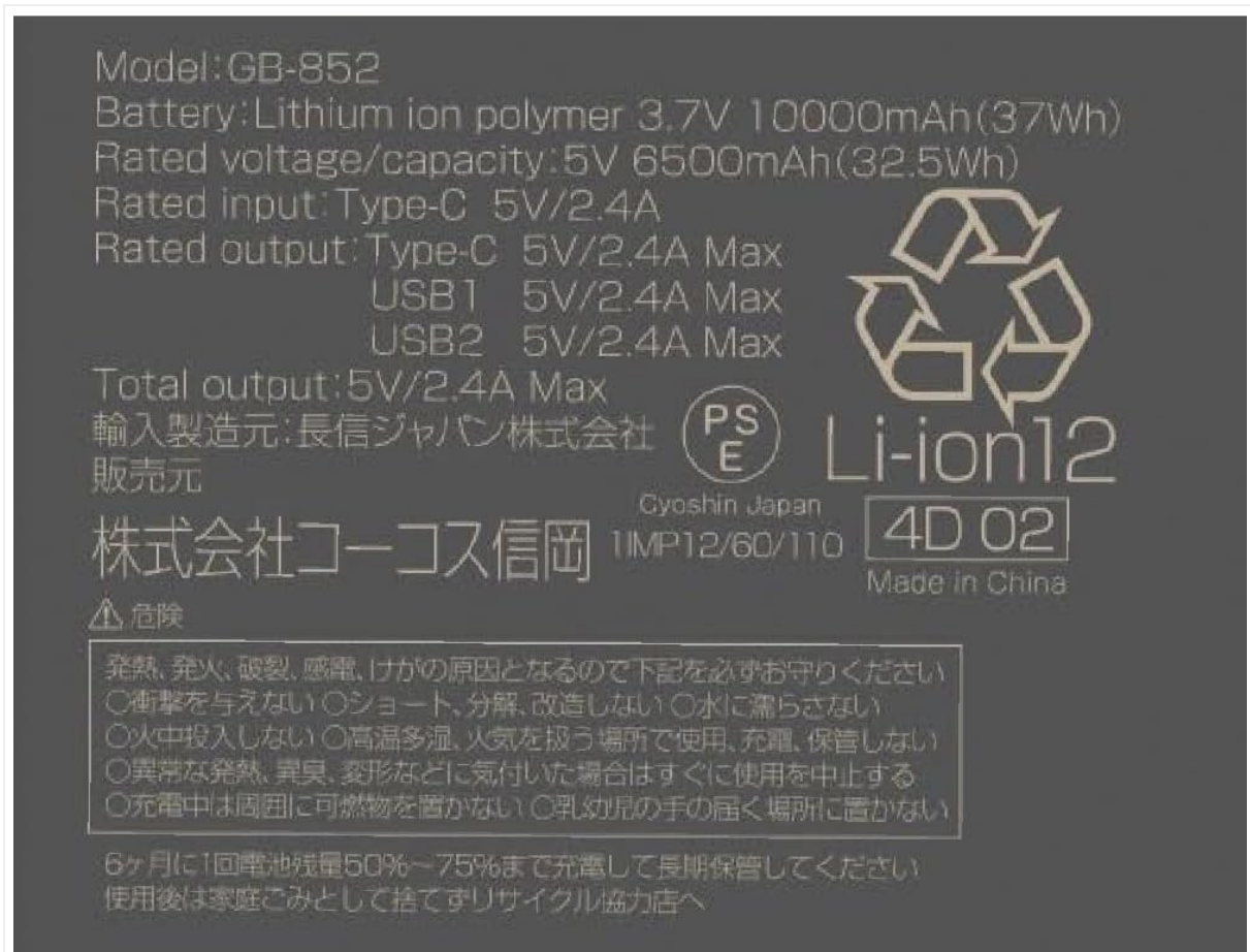
Figure 2: Back view of the GLADIATOR GB-852 Mobile Battery, showing regulatory markings including PSE certification and a "Made in China" label, along with safety warnings in Japanese.