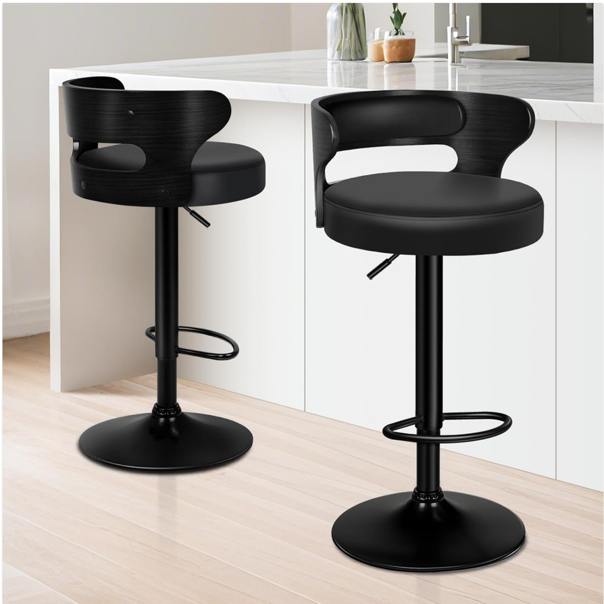
Image 1.1: ALFORDSON Ramiro Series Bar Stools in a kitchen setting.