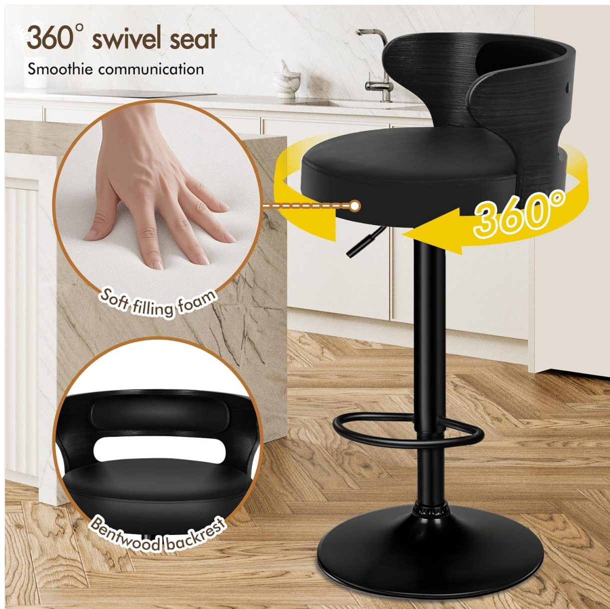
Image 4.2: Details of the 360° swivel seat, foam, and bentwood backrest.