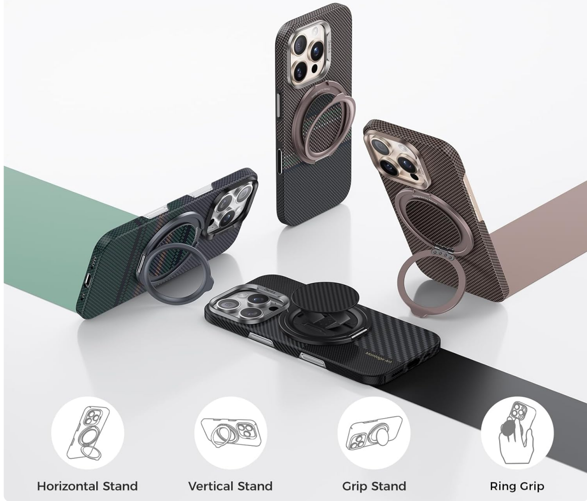
Image: Visual representation of the multiple ways to use the ArmorPop grip: horizontal stand, vertical stand, grip stand, and ring grip.

Grip it, flip it, stand it – Perfect for selfies, work and binge