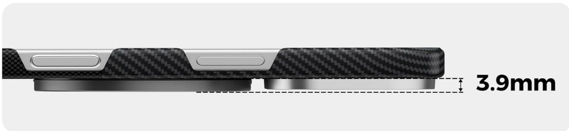
Image: The slim profile of the ArmorPop grip, highlighting its 3.9mm thickness and 22g weight, designed for minimal bulk.