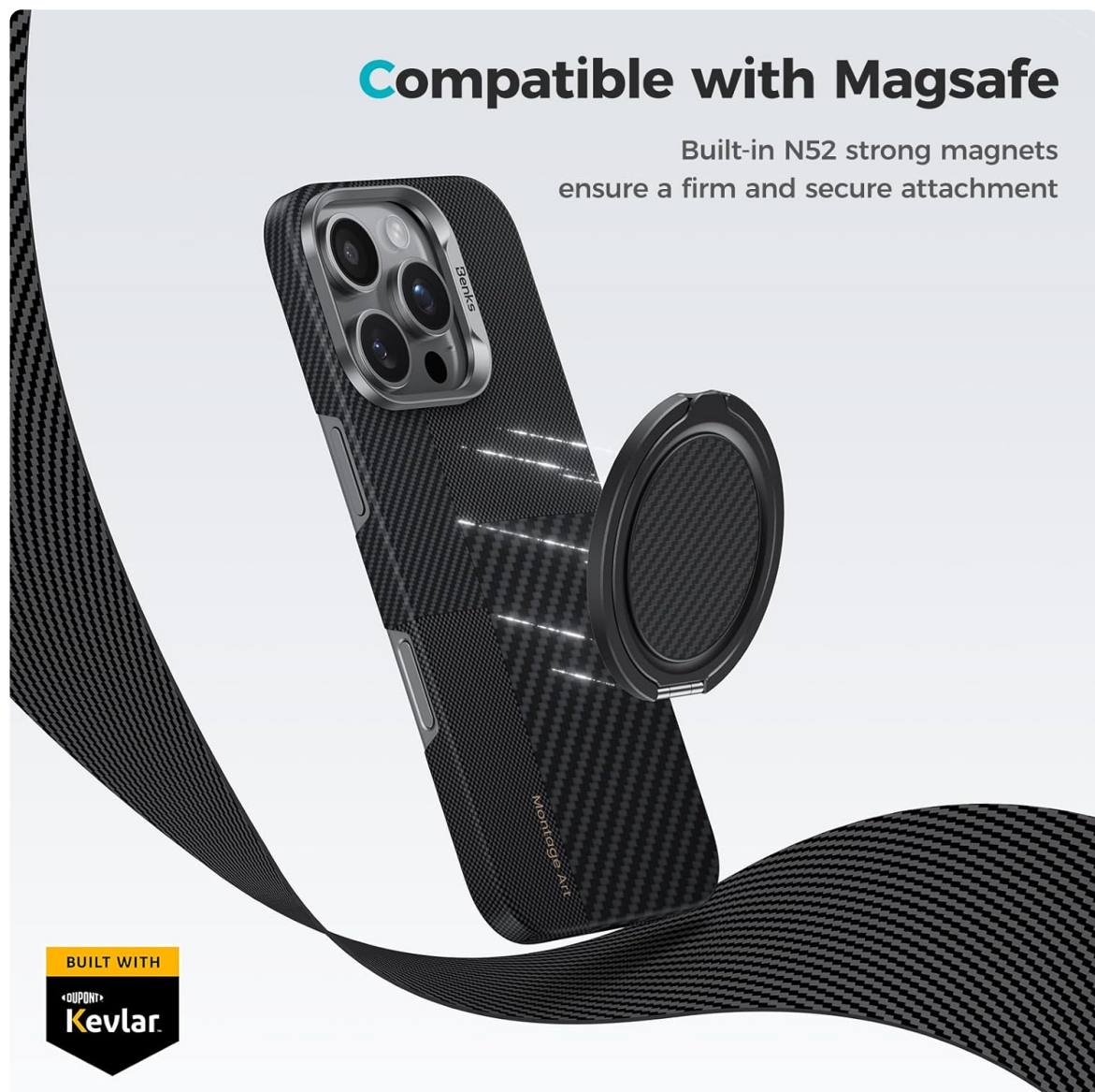
Image: The BENKS ArmorPop Magnetic Phone Grip securely attached to the back of an iPhone via MagSafe, highlighting its strong