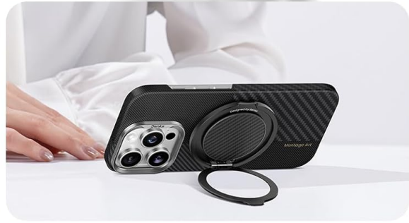
Image: The ArmorPop grip demonstrating its 360° rotation and 180° flip features, allowing for flexible positioning as a grip or stand.