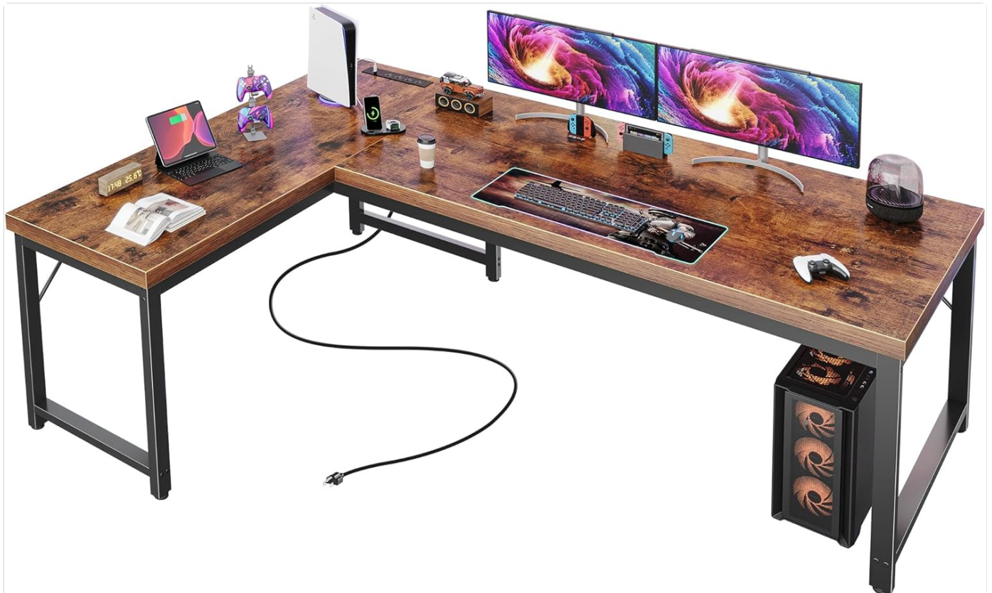
Figure 1: Overview of the Huuger 63 Inch L Shaped Desk setup, showcasing its spacious design and integrated power outlets.

The Huuger 63 Inch L Shaped Desk is designed for versatile use in home offices, gaming setups, and study environments. It features a robust construction with a thick desktop and a reinforced steel frame, ensuring stability and durability. A key feature is the integrated power strip, providing convenient access to AC outlets, USB, and USB-C ports for charging multiple devices.