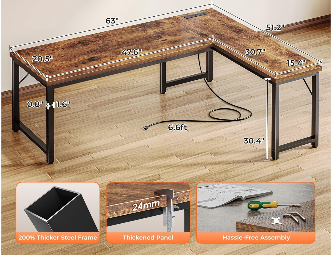
Figure 2: Key structural components and included assembly tools for the desk.