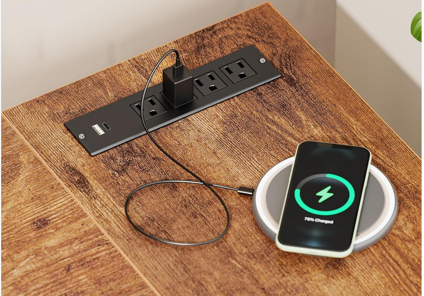
Figure 4: Detail of the integrated power outlets, demonstrating their use for charging various devices.

To use, simply plug your devices into the appropriate ports. Ensure that the total power draw does not exceed the maximum capacity of the power strip. Avoid overloading the outlets to prevent electrical hazards.