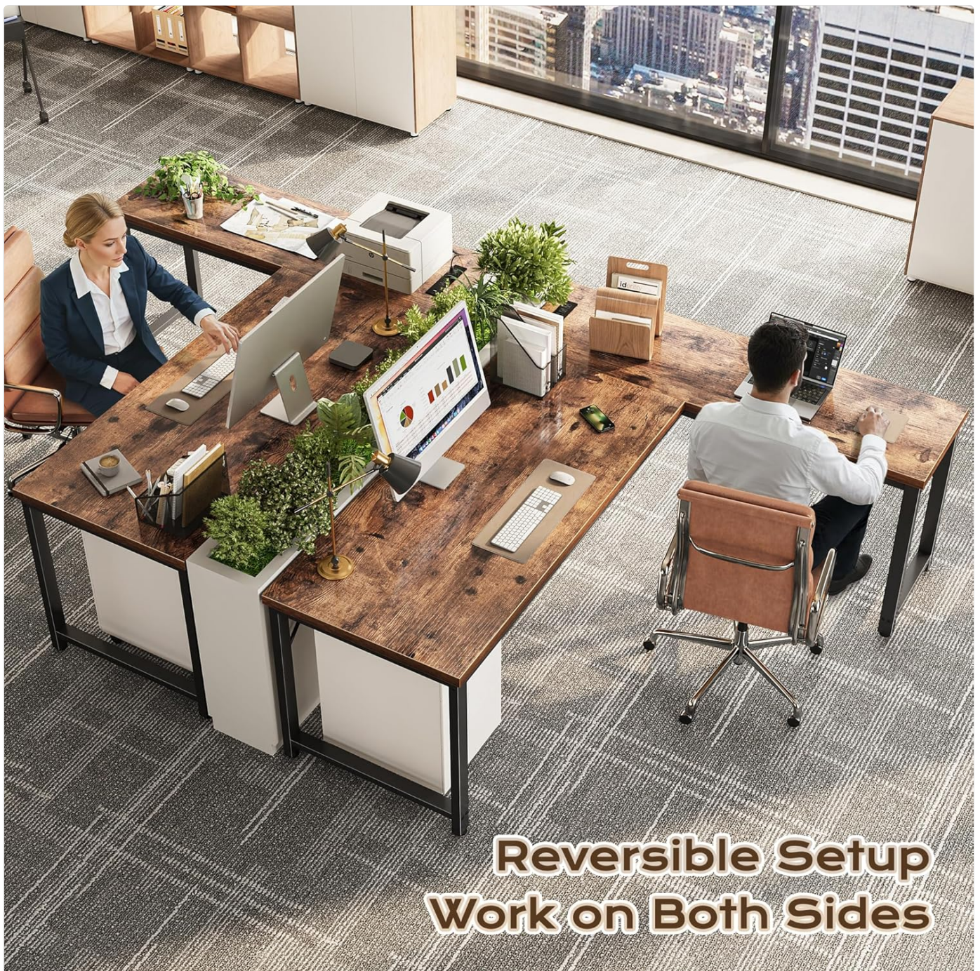
Figure 3: Example of a reversible setup, showing how two desks can be configured for a shared workspace.