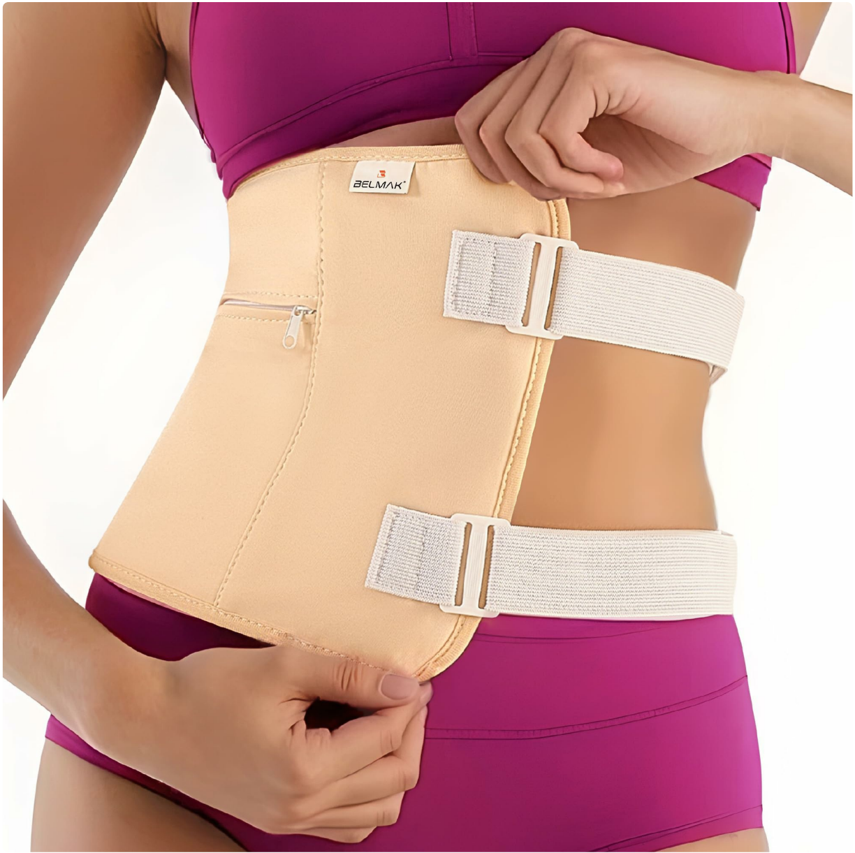
Image 2.1: The BELMAK Castor Oil Pack Wrap, showcasing its adjustable and reusable design.