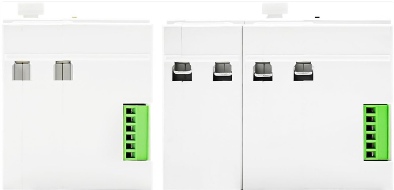
Figure 3: Side view of the Automatic Transfer Switch, highlighting the input and output wiring terminals. This view is helpful for understanding the physical layout for wire connections.