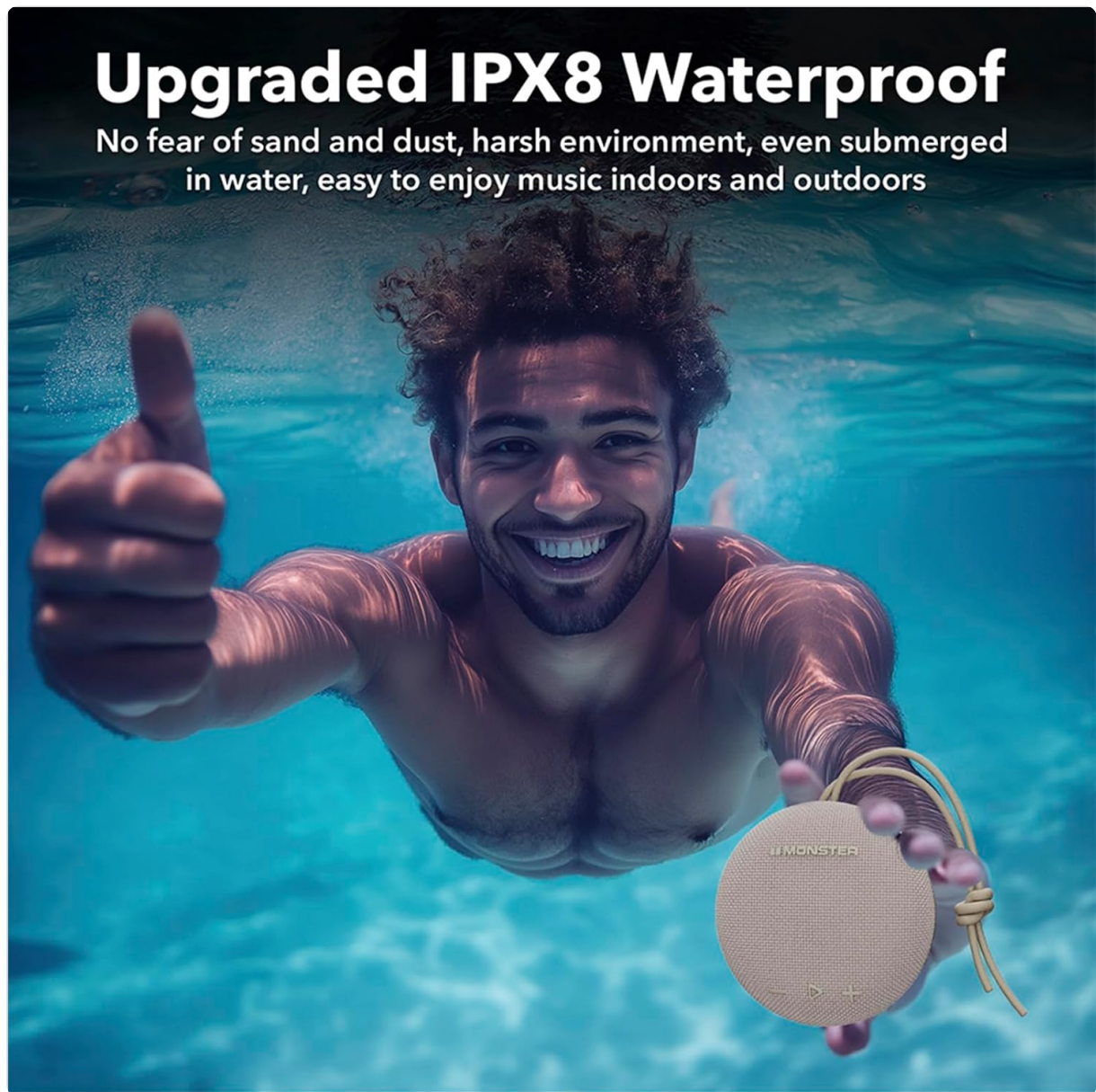
Figure 4: The speaker's IPX8 waterproof capability allows for use even when fully submerged.

charging port cover is securely closed before exposing the speaker to water.