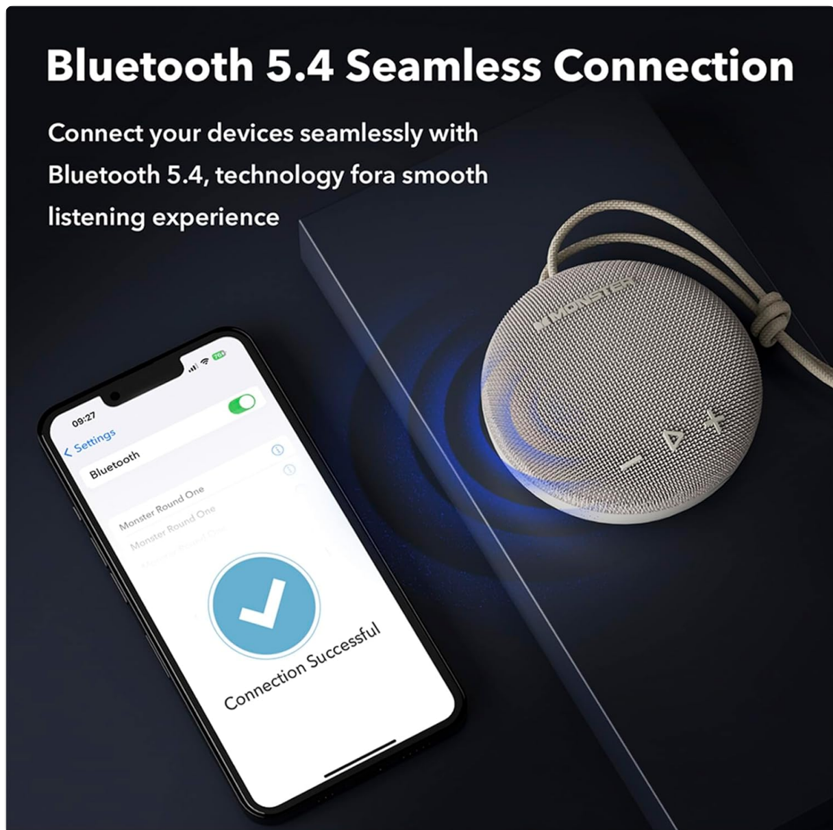
Figure 3: Seamless Bluetooth 5.4 connection process.