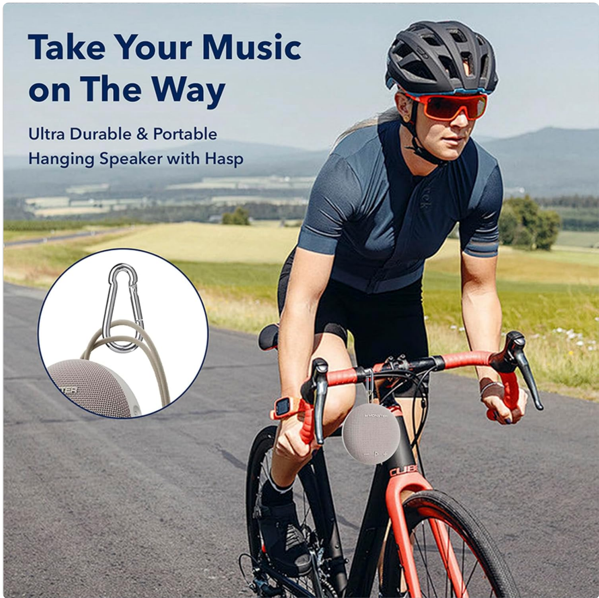
Figure 6: The speaker's portability with the carabiner clip, ideal for outdoor activities like cycling.

Ultra Durable & Portable Hanging Speaker with Hasp