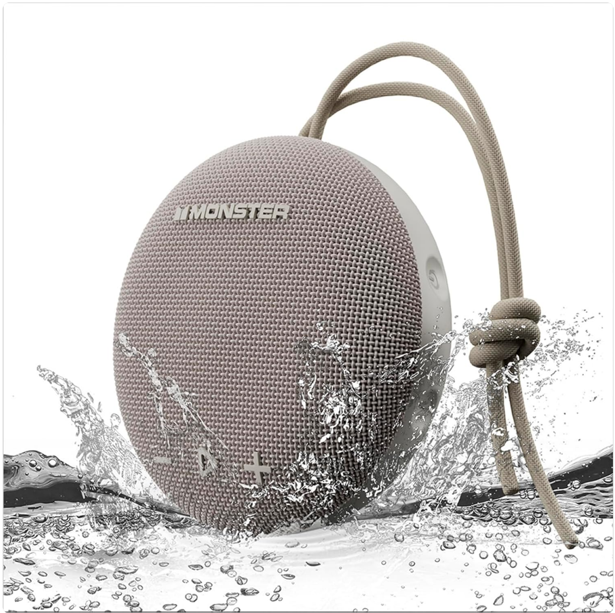
Figure 1: Monster Bluetooth Speaker, showcasing its waterproof design with water splashes.

The Monster Bluetooth Speaker features a compact, round design with a durable fabric grille and integrated controls. It includes a lanyard for portability and a detachable suction cup for versatile mounting. The speaker is equipped with a built-in microphone for hands-free calls.