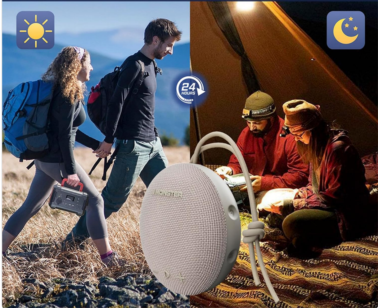
Figure 7: The speaker's long battery life supports extended outdoor use.

Built-in long-lasting battery, worry-free for a whole day