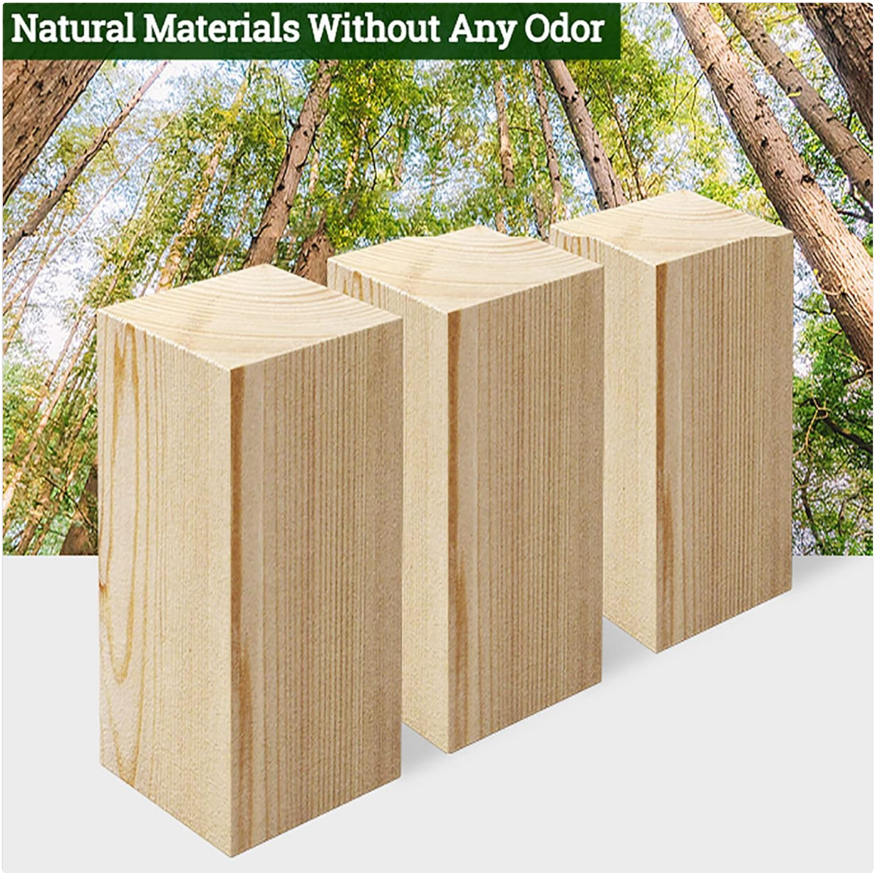
Image: Three solid wood blocks, symbolizing the natural and odor-free materials used in the bed frame's construction, with a blurred background of trees.