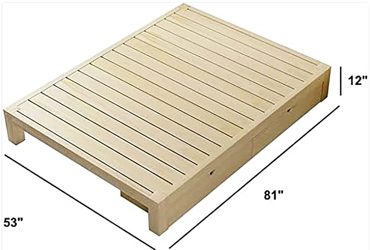
Image: A diagram showing the dimensions of the SUZEPER Solid Wood Bed Frame: 53 inches wide, 81 inches long, and 12 inches high, indicating the overall size of the Full model.