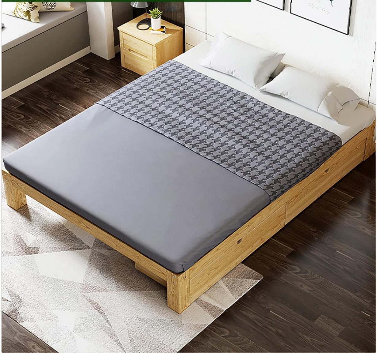
Image: The fully assembled SUZEPER Solid Wood Bed Frame, shown with a mattress and bedding, illustrating its Scandinavian modern design and low platform profile.