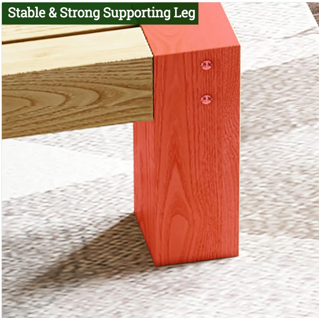
Image: A close-up view of a stable and strong supporting leg, demonstrating the robust construction of the bed frame.