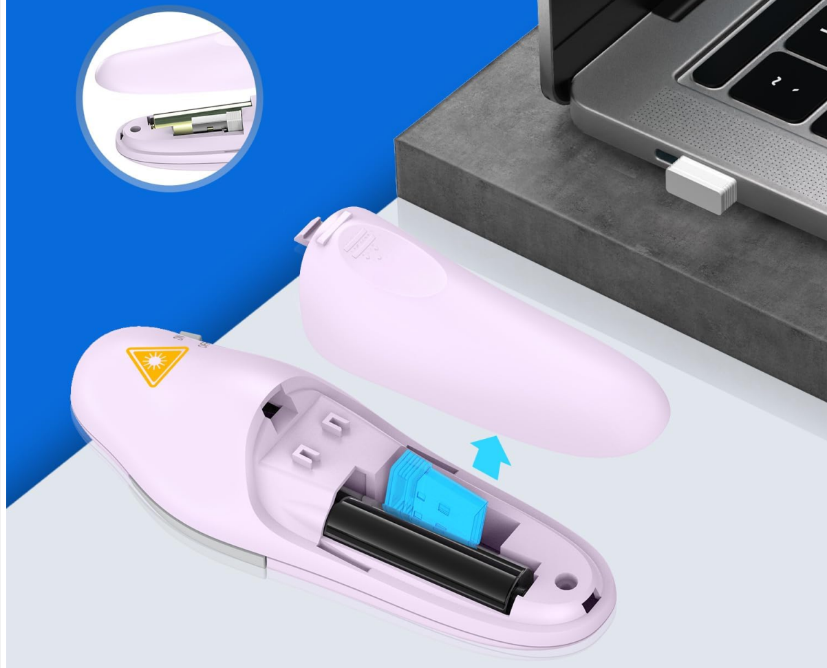
Image: The USB receiver being inserted into a laptop's USB port, demonstrating the plug-and-play setup.

Just Plug The Usb Receiver Into The Computer, No Need To Download Additional Drivers