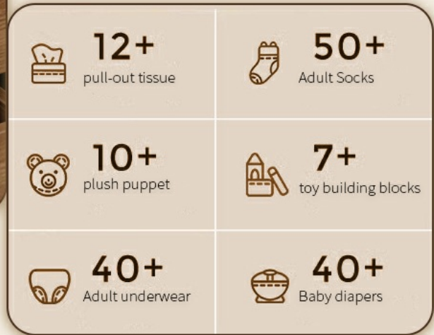
Figure 5.2: Visual representation of the wider and deeper drawers, designed for increased storage capacity and organization of various items.

Six storage spaces, zoned storage, storage categories are not limited to meet different storage needs