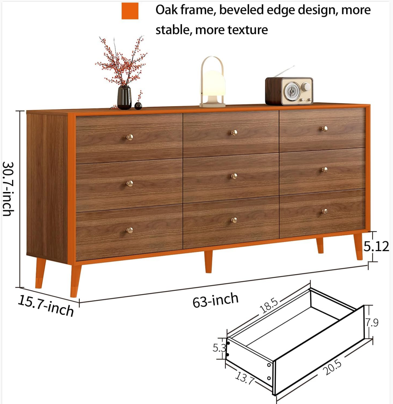
Figure 4.1: Overall dimensions of the Messenya 9-Drawer Dresser (15.7"D x 63"W x 30.7"H).