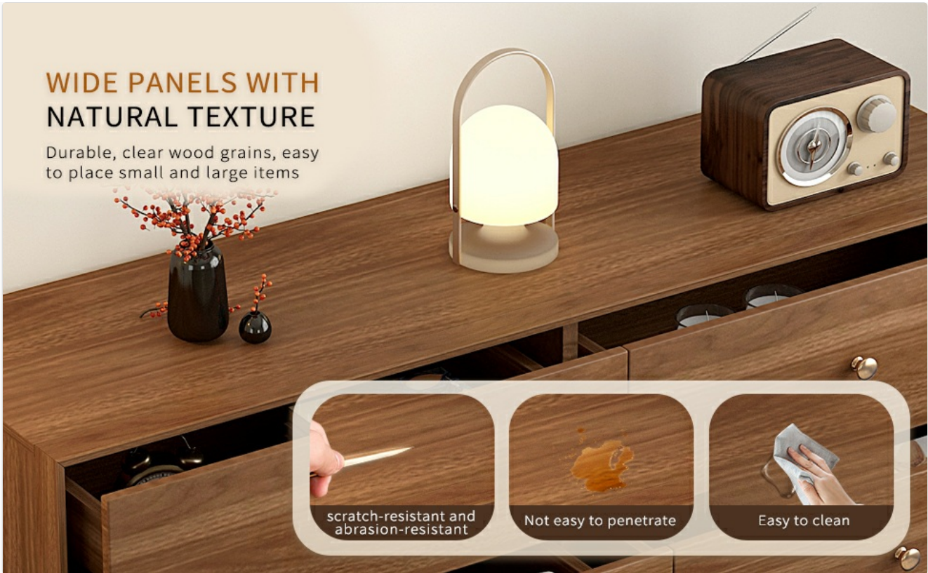
Figure 6.1: The dresser's wide panels feature a natural texture that is scratch-resistant, abrasion-resistant, not easy to penetrate, and easy to clean.

Durable, clear wood grains, easy to place small and large items