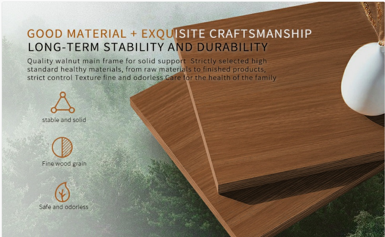
Figure 8.1: Emphasizing the quality materials and craftsmanship, including stable and solid construction, fine wood grain, and safe, odorless components.