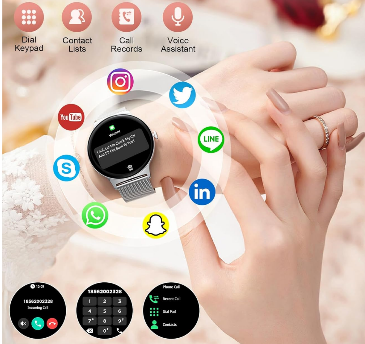
Image 2.1: Bluetooth call and message notification feature on the LIGE FV12-E Smart Watch.