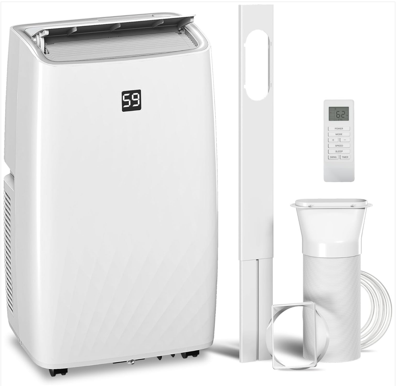
Figure 1: HOMCOM Portable Air Conditioner and included accessories.