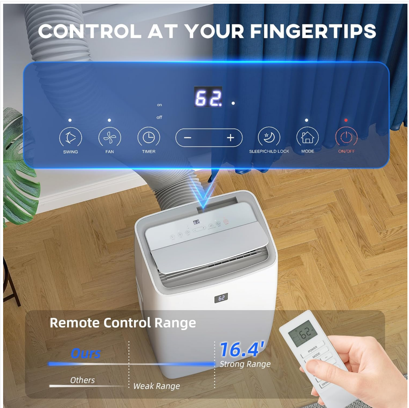
Figure 6: The unit features a clear digital display and intuitive touch controls, complemented by a remote control for convenience.