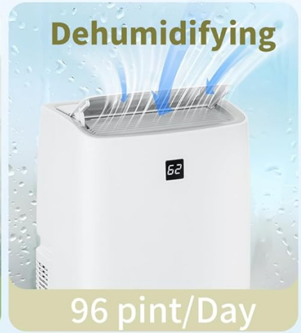
Figure 2: The unit's 3-in-1 functionality: Cooling, Fan, and Dehumidifying.