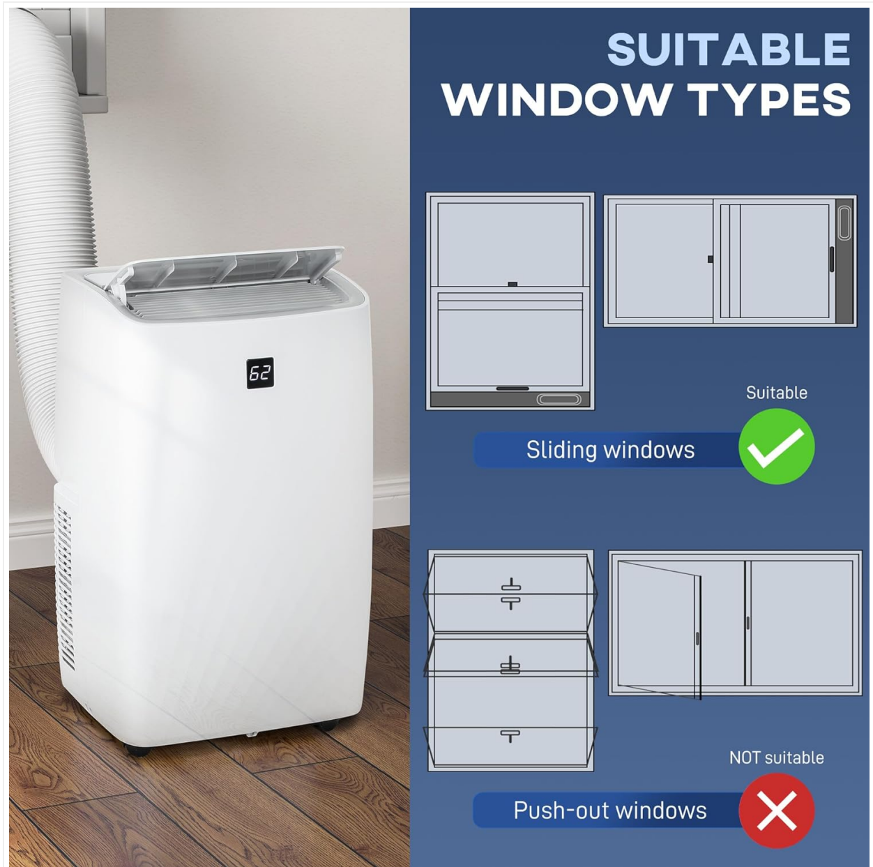
Figure 5: The window kit is suitable for sliding windows. Not suitable for push-out windows.