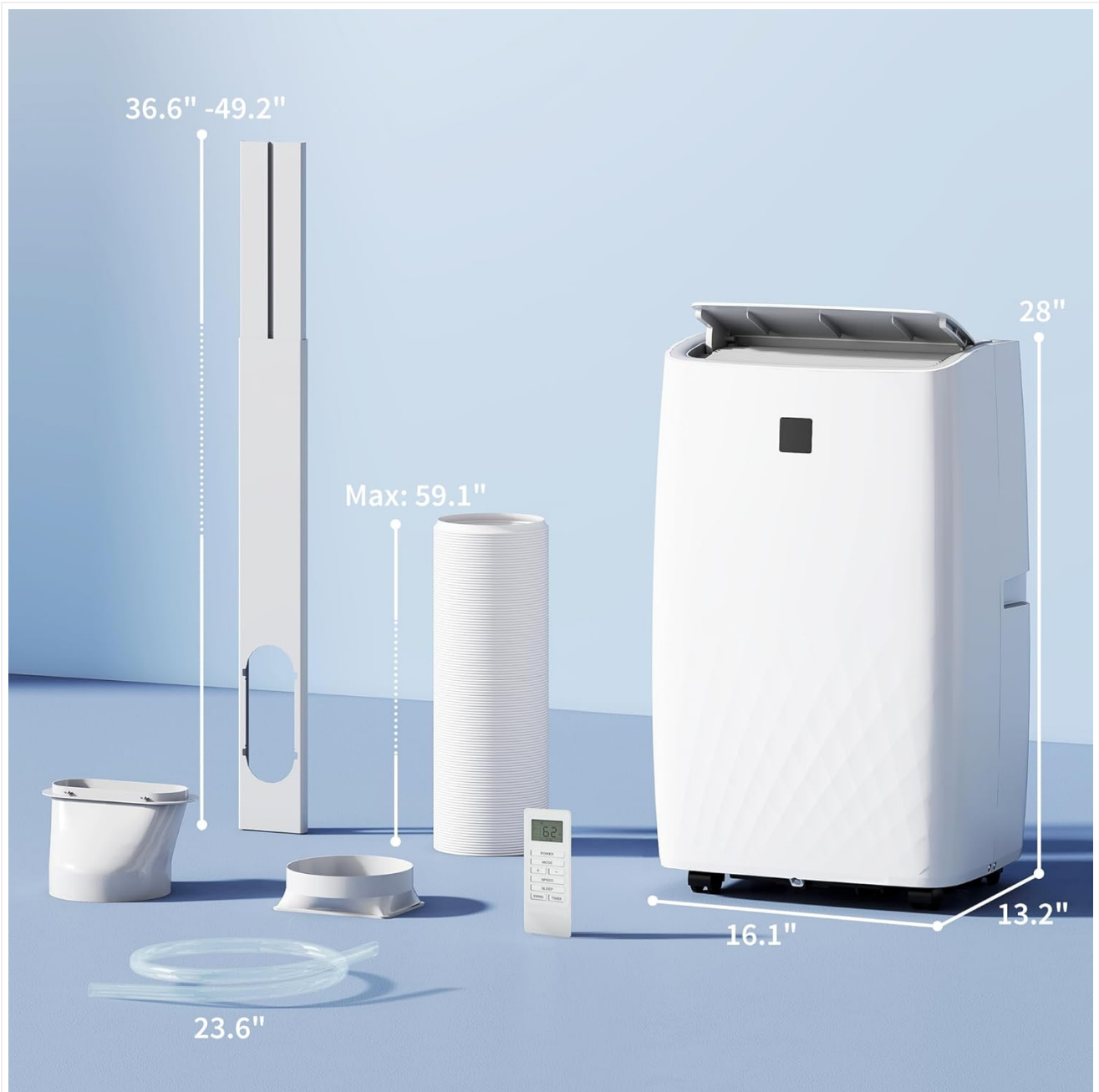
Figure 4: Detailed dimensions of the unit and its components.