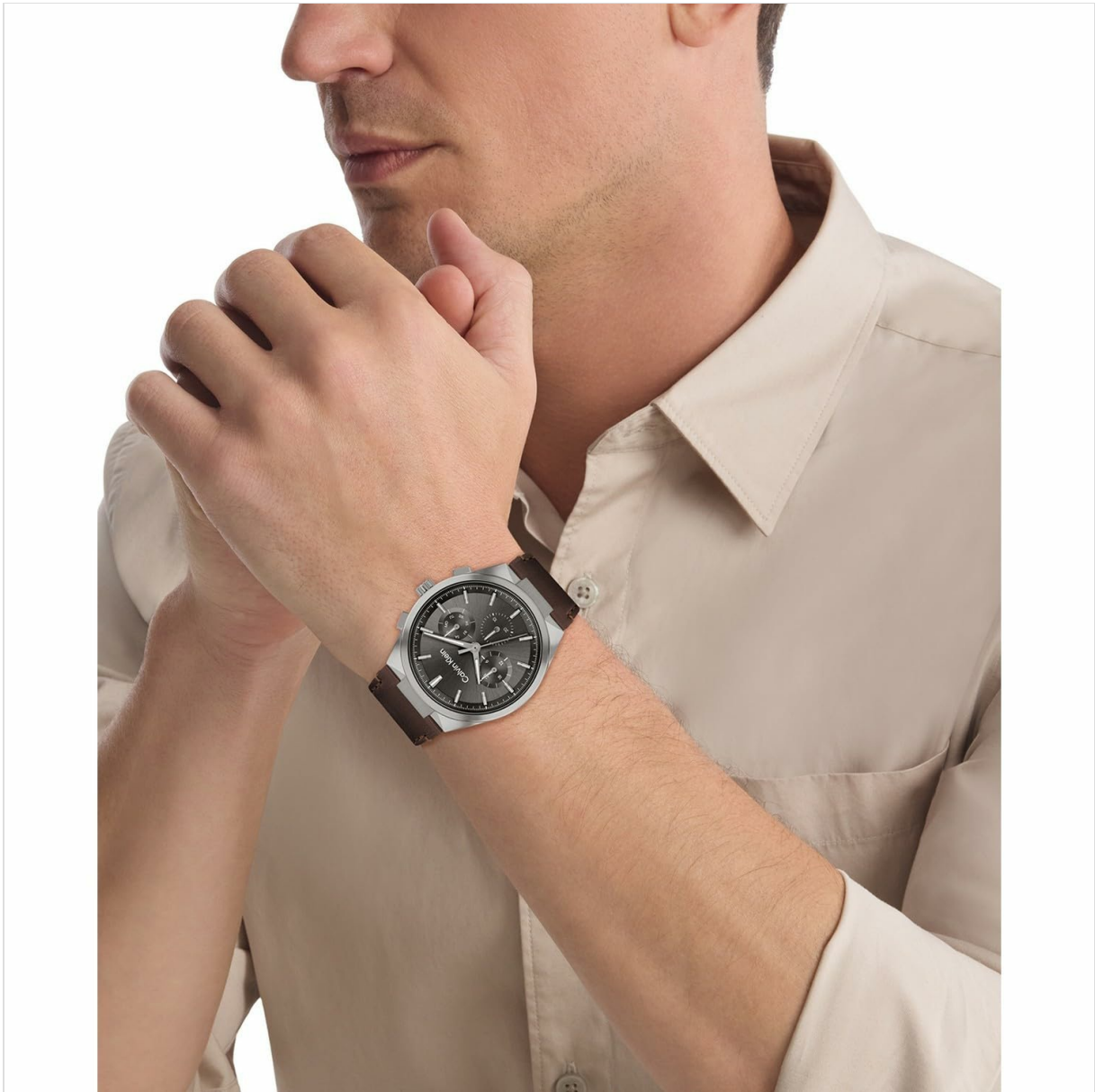
Image: The Calvin Klein Distinguish watch worn on a man's wrist, demonstrating its appearance during use.