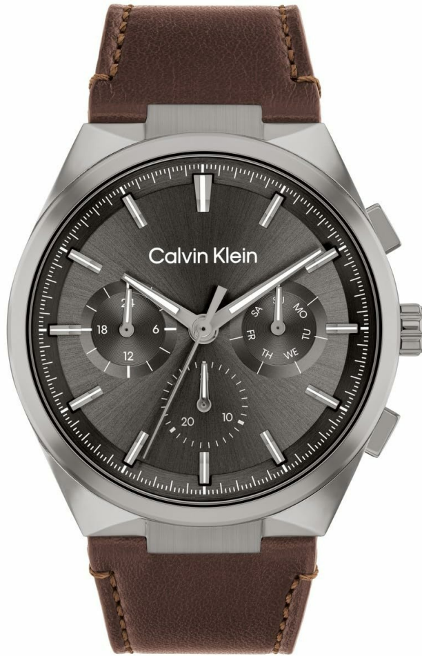
Image: Front view of the Calvin Klein Distinguish watch, showcasing the gunmetal round dial and brown leather strap.