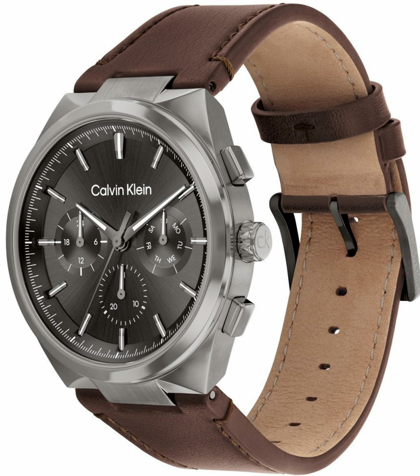
Image: Side view of the Calvin Klein Distinguish watch, highlighting the crown and pushers used for setting time and operating multifunction features.