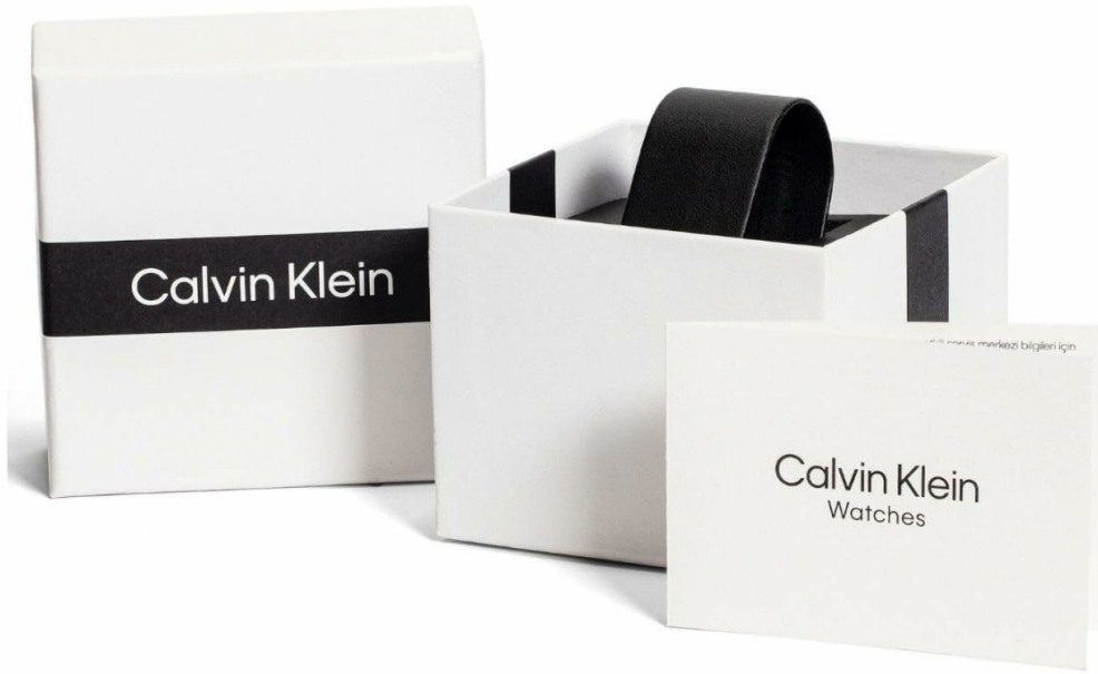
Image: The Calvin Klein Distinguish watch presented in its original packaging box, alongside a small instruction card.