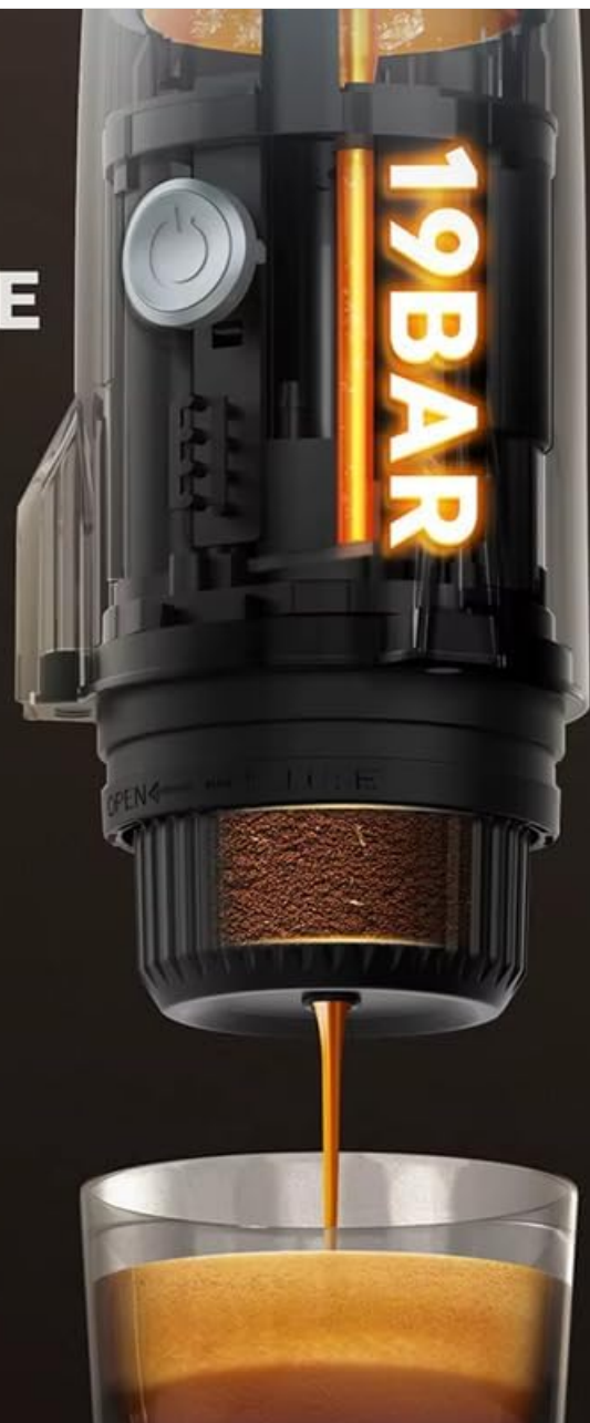
Figure 1: Detailed view of the Omana Portable Coffee Machine components.