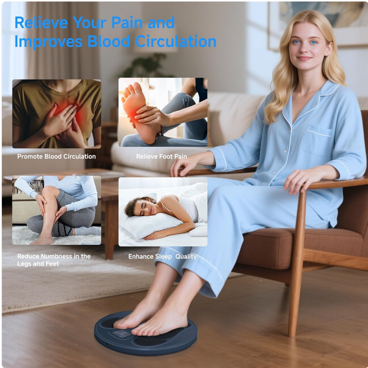
Image: Benefits of using the NENRENT EMS/TENS Foot Stimulator, including improved circulation and pain relief.