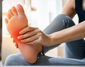
Relieve Foot Pain