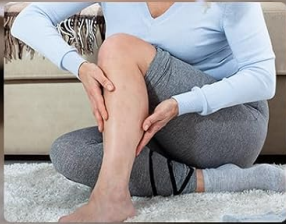
Reduce Numbness in the Legs and Feet