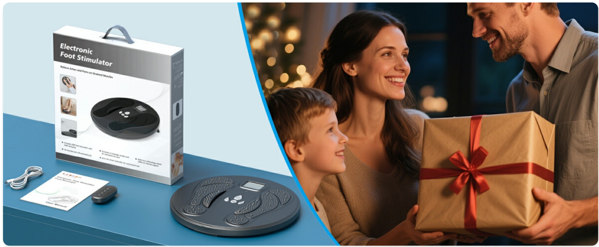
Image: Visual guide for preparing and setting up the foot stimulator.