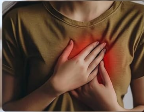
Promote Blood Circulation