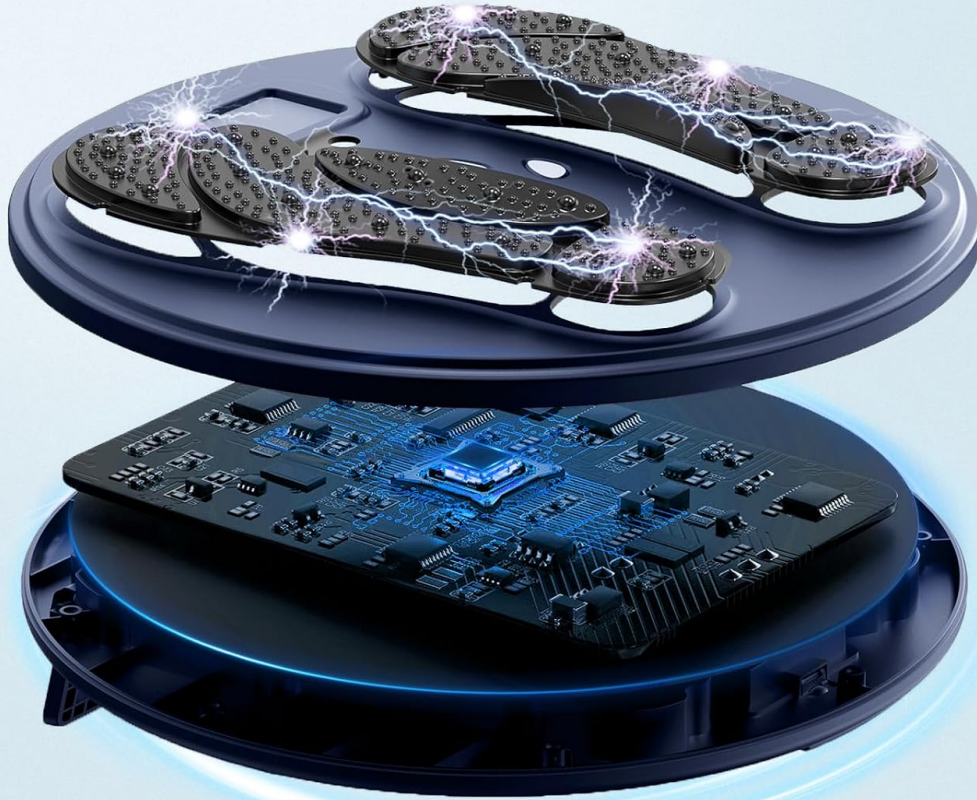
Image: Internal components and key features of the foot stimulator.