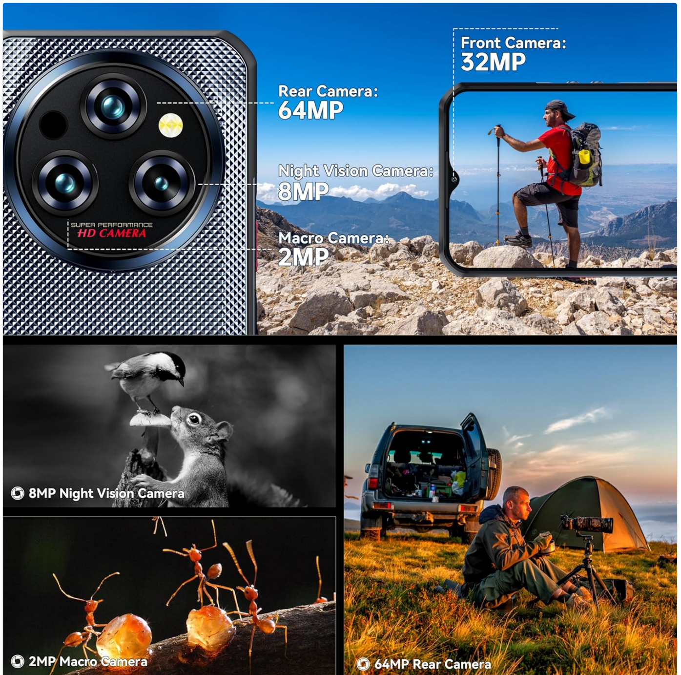
Figure 6: Details of the multi-camera system for diverse photographic needs.