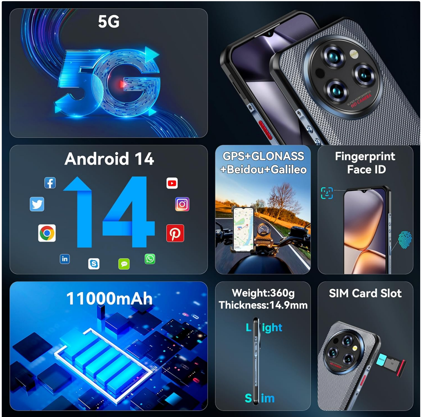
Figure 2: Overview of phone features including the SIM card slot for installation.