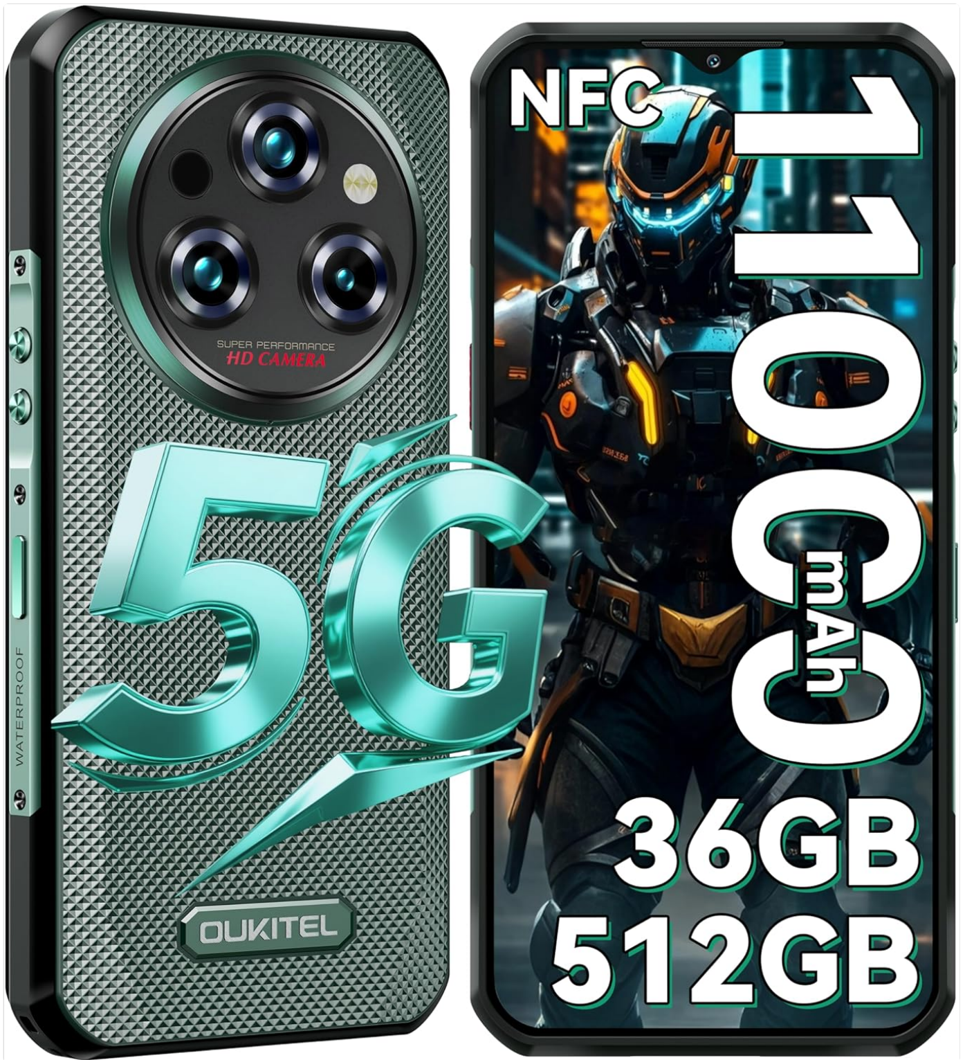
Figure 1: OUKITEL WP35 Pro device overview, showcasing its robust design and key specifications.