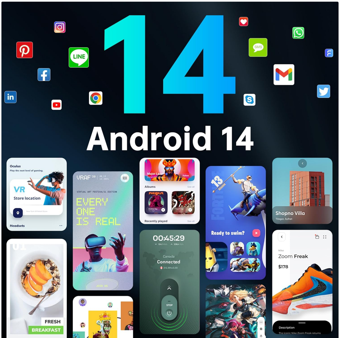
Figure 3: The Android 14 operating system provides a user-friendly interface for initial setup and daily use.

setup, including language selection, Wi-Fi connection, Google account setup, and security settings (fingerprint/face recognition).