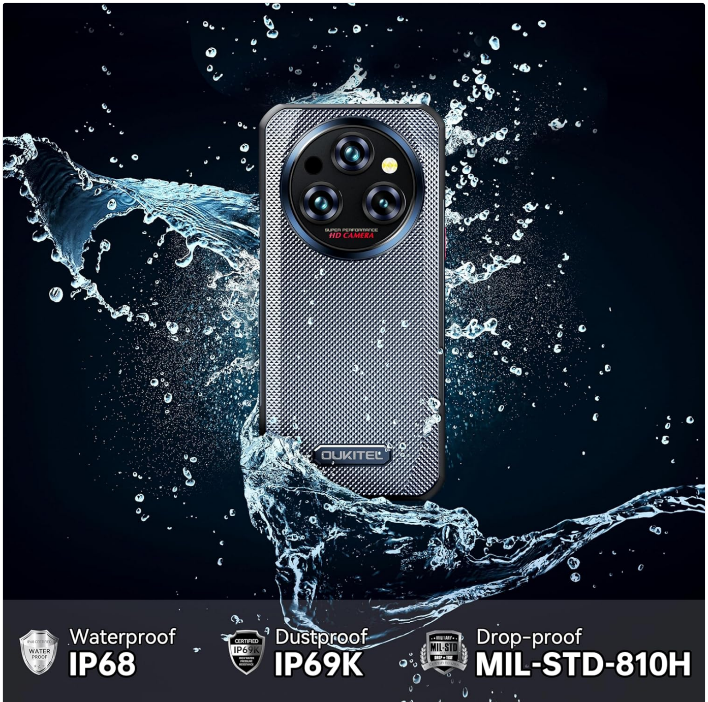
Figure 8: Visual representation of the phone's robust protection features.

Your browser does not support the video tag.