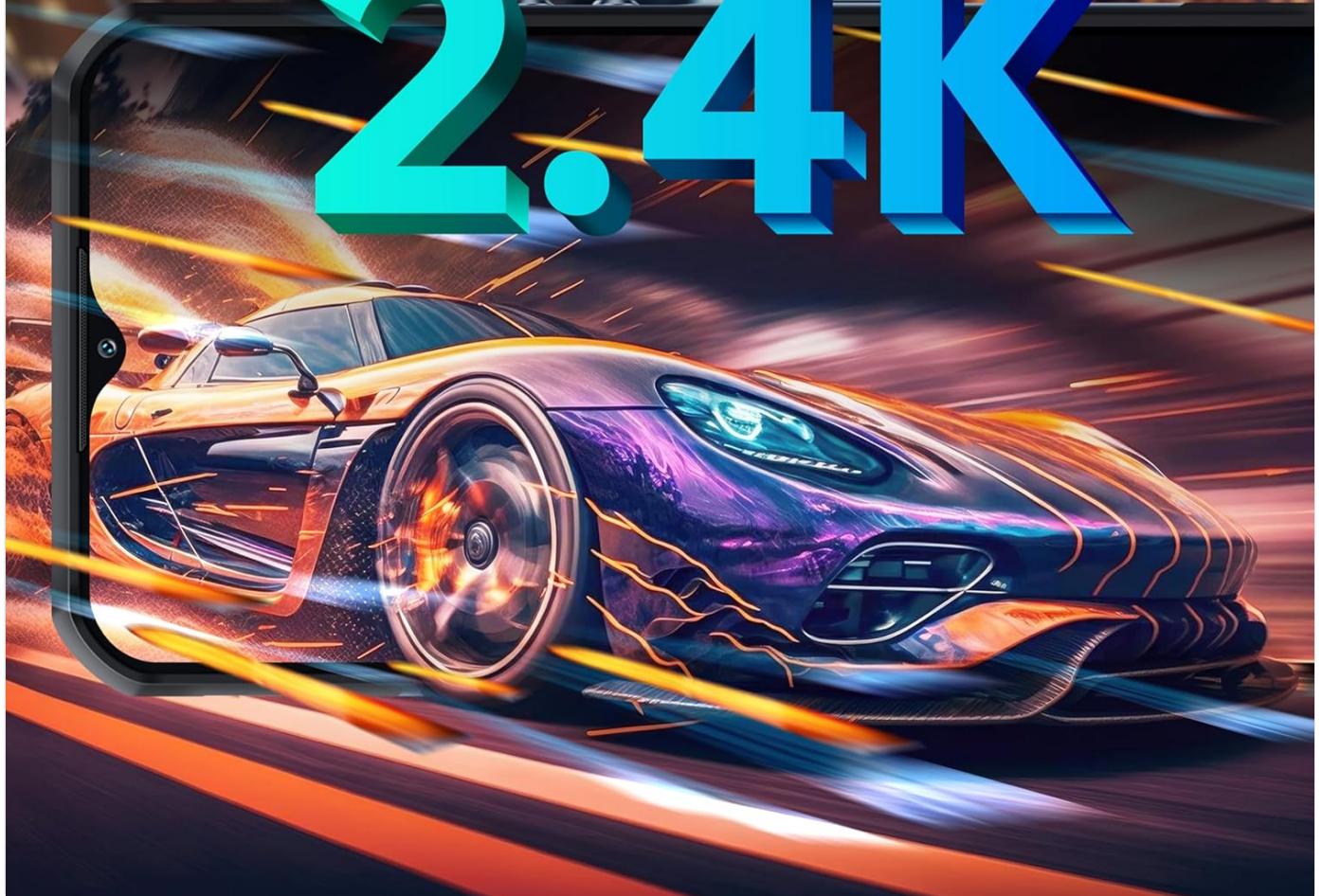
Figure 4: Detailed specifications of the 6.6-inch 2.4K display.